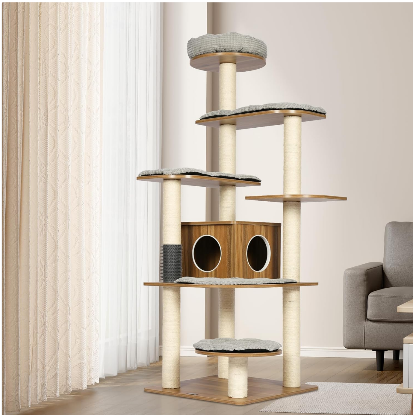
Figure 1: Fully assembled KAMABOKO 69-inch Tall Wood Cat Tree.

Assembly of the KAMABOKO Cat Tree is designed to be straightforward. Please follow the included clear instructions step-by-step. It is recommended to inventory all parts before you begin to ensure nothing is missing.