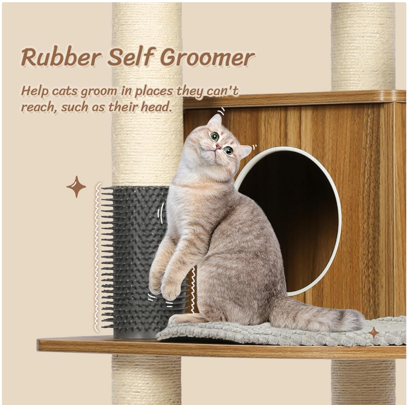
Figure 4: Rubber Self Groomer.

A rubber self-groomer is integrated into the design to help cats groom themselves, especially in hard-to-reach areas like their head.