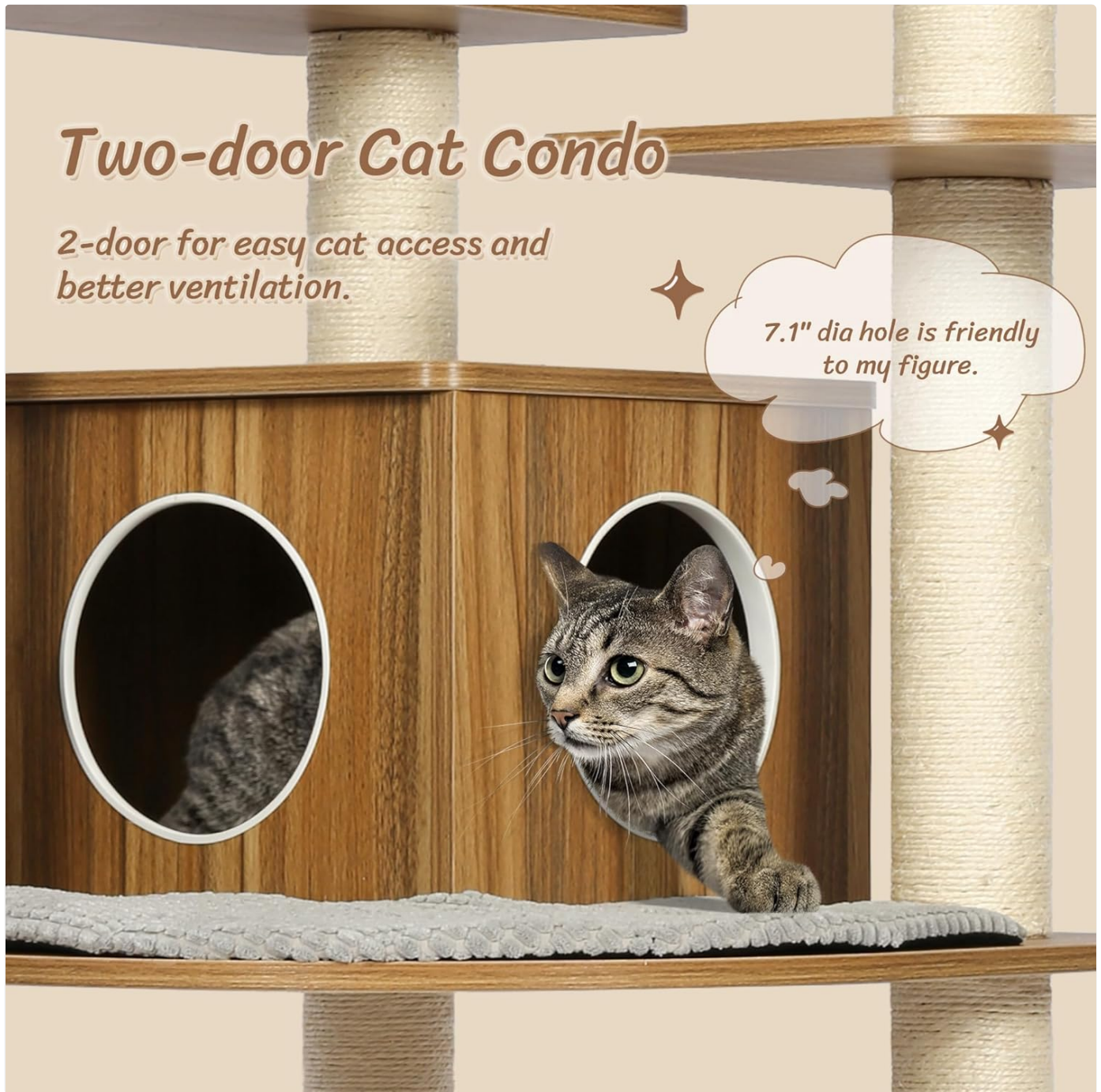
Figure 3: Two-door Cat Condo.

The cat condo features two access points for easy entry and exit, promoting ventilation and providing a cozy hideaway.