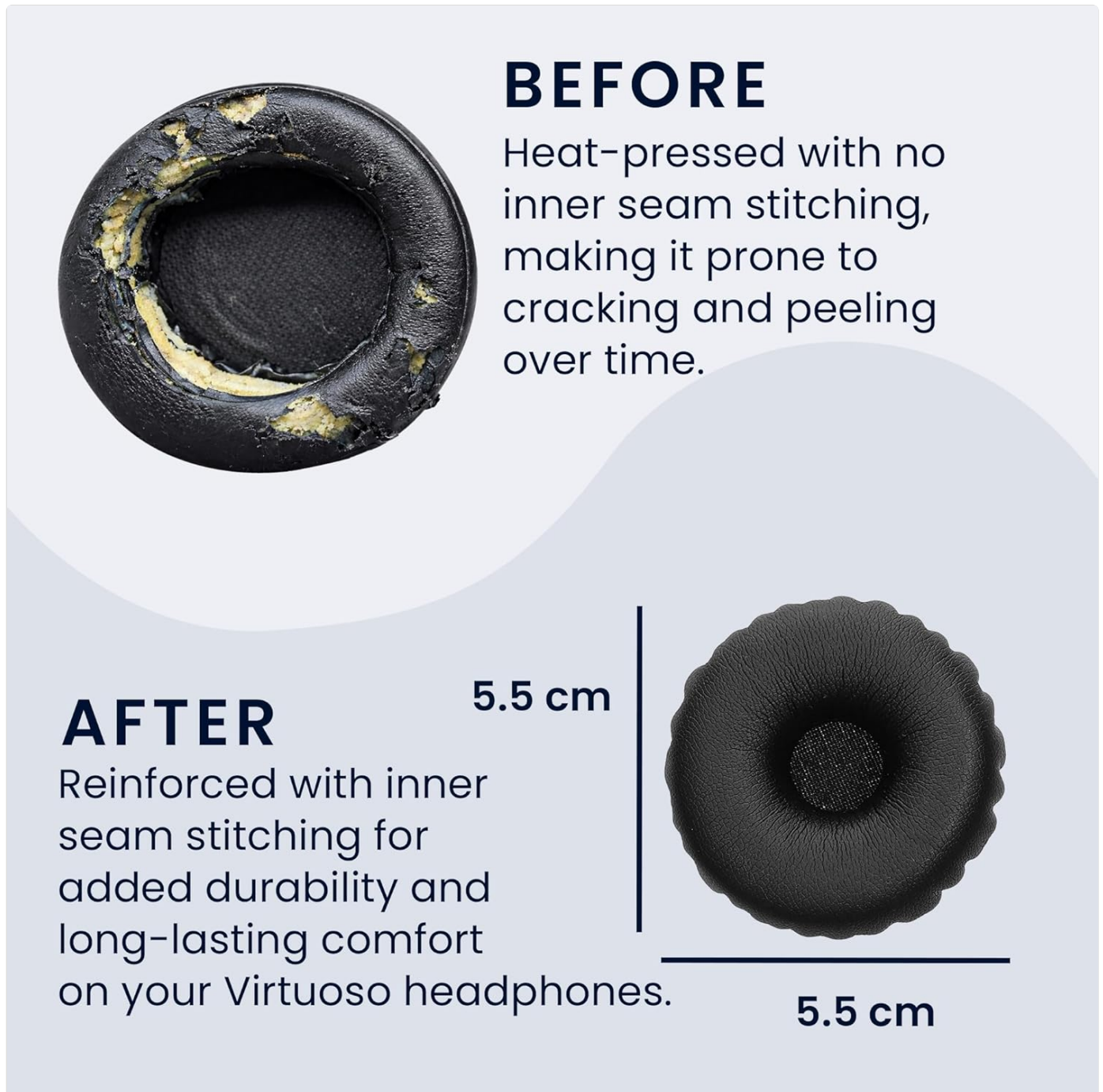
Figure 4.1: Comparison of old and new ear pads, illustrating the replacement.

Note: Pay close attention to the make and condition of your specific headphone model when disassembling the old ear cushions to avoid damage.