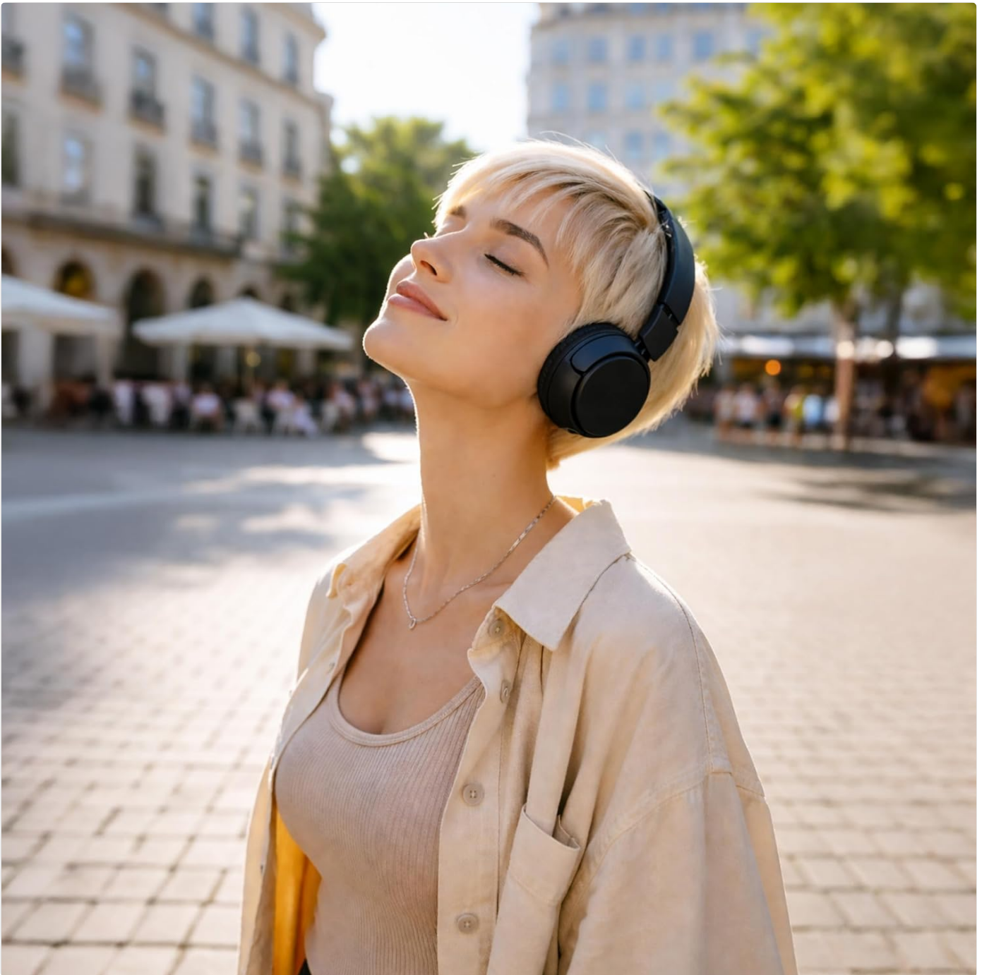
Figure 5.1: Example of comfortable headphone usage with ear pads.