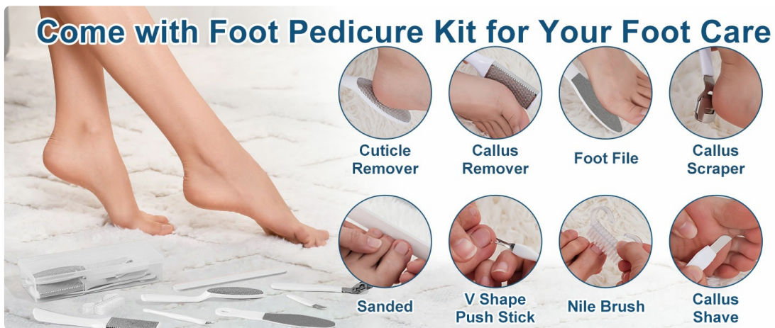
Image: A close-up view of the comprehensive pedicure kit included with the foot spa, showing various tools for foot care.