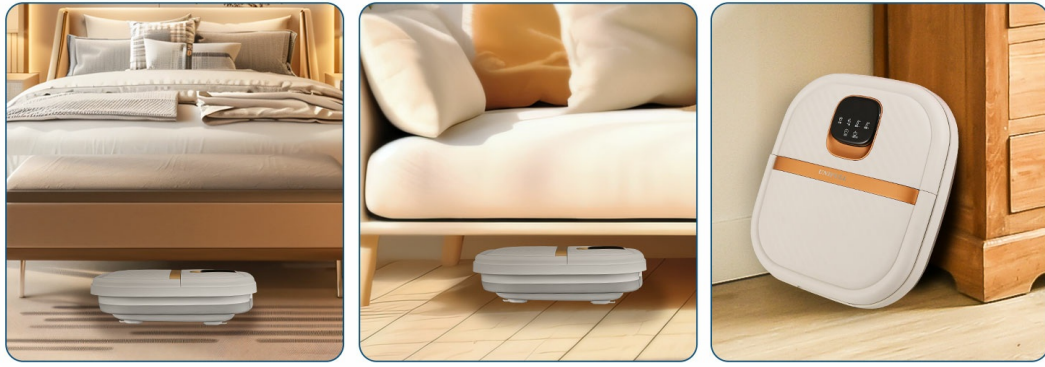
Image: The collapsible foot spa shown stored compactly under a bed, under a sofa, and upright against a wall, demonstrating its space-saving design.