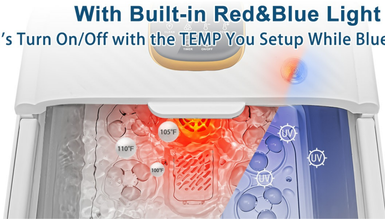
Image: An internal view of the foot spa showing the red light function active with temperature settings, and a blue light function for cleaning.