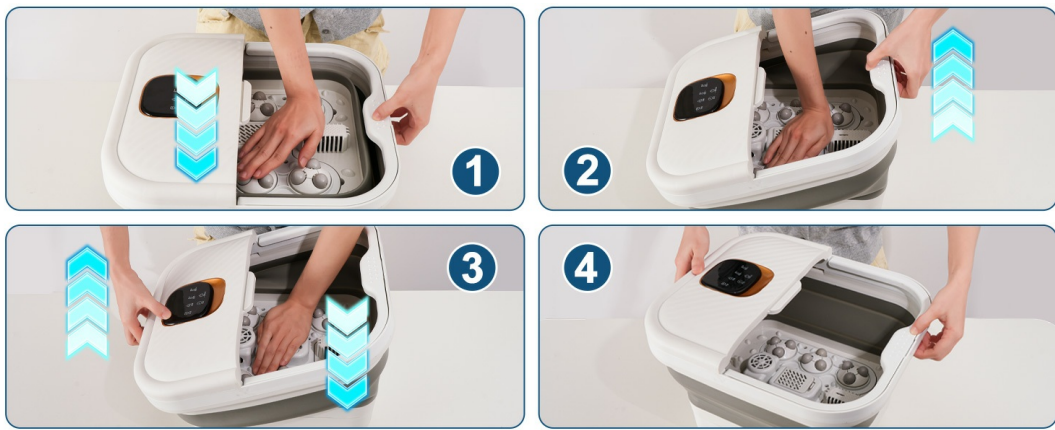
Image: A four-step visual guide demonstrating how to expand the collapsible foot spa from its compact state to its full operational size.