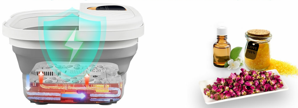
Image: A diagram showing the foot spa's safe hydroelectric separation system alongside images of soaking salt, rose petals, and essential oil, indicating their use for a deep foot spa experience.