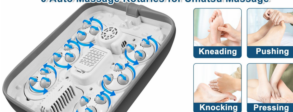
Image: A detailed view of the foot spa's base, highlighting the 6 auto massage rotaries designed for Shiatsu massage, with arrows indicating their rotational movement.