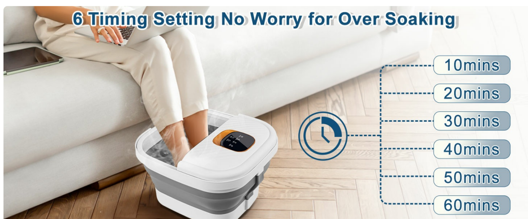
Image: A person using the foot spa, with an overlay showing the available timing settings from 10 to 60