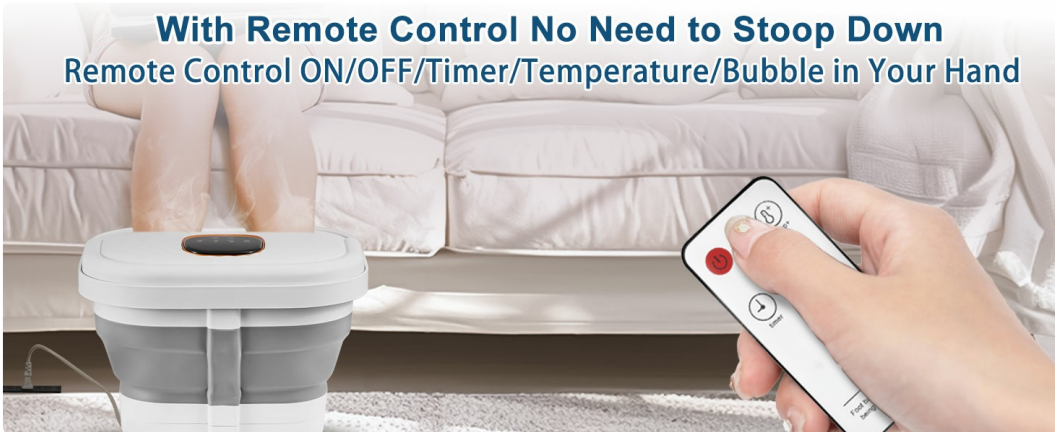
Image: A hand holding the remote control for the foot spa, with a person relaxing on a sofa in the background, demonstrating convenient operation.