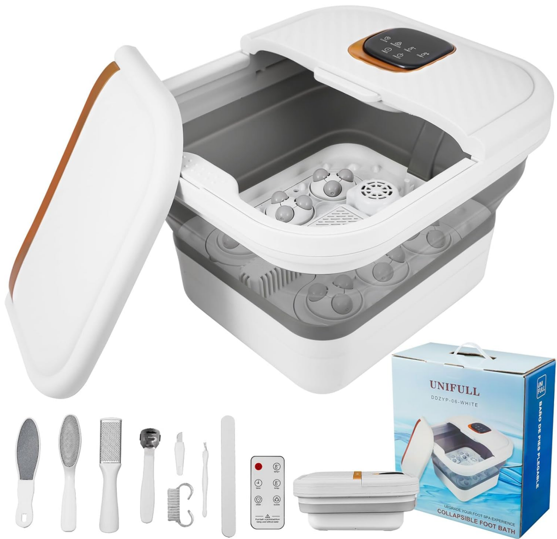
Image: The UNIFULL Collapsible Foot Spa Bath shown with its included remote control and pedicure kit.