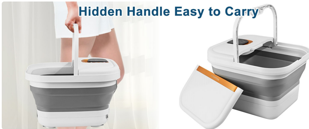
Image: A person carrying the foot spa using its hidden handle, illustrating the ease of transport.