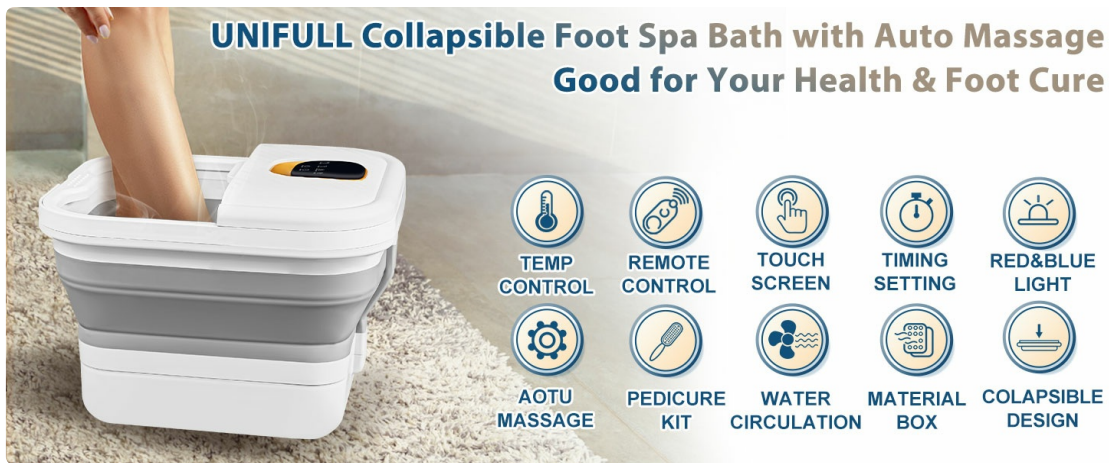
Image: Diagram illustrating the dimensions of the foot spa and icons representing its key features such as touch screen, timing, temperature control, motorized massage, water circulation, material box, red light, collapsible design, remote control, and pedicure kit.