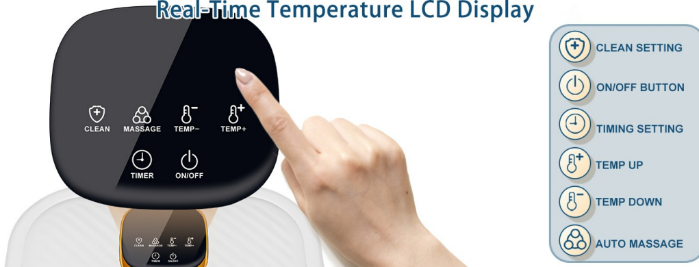
Image: Close-up of the foot spa's touch screen control panel, showing buttons for Clean, Massage, Temperature adjustment, Timer, and On/Off.