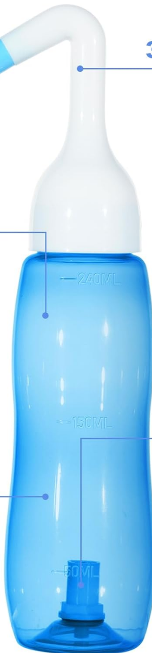
Image: Bottle features including clear volume marks and valve button.

which can easily control the water flow Please make sure the water temperature is around 37°C