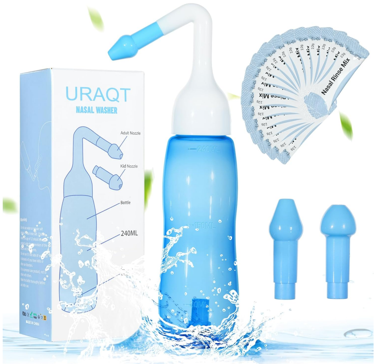
Image: Overview of the URAQT Nasal Washer Kit components.