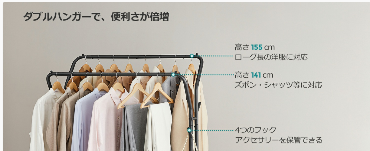
Image 4.1: The double-rod design allows for hanging garments of varying lengths, with side hooks for accessories. The front rod offers 141 cm height, and the back rod offers 155 cm height.