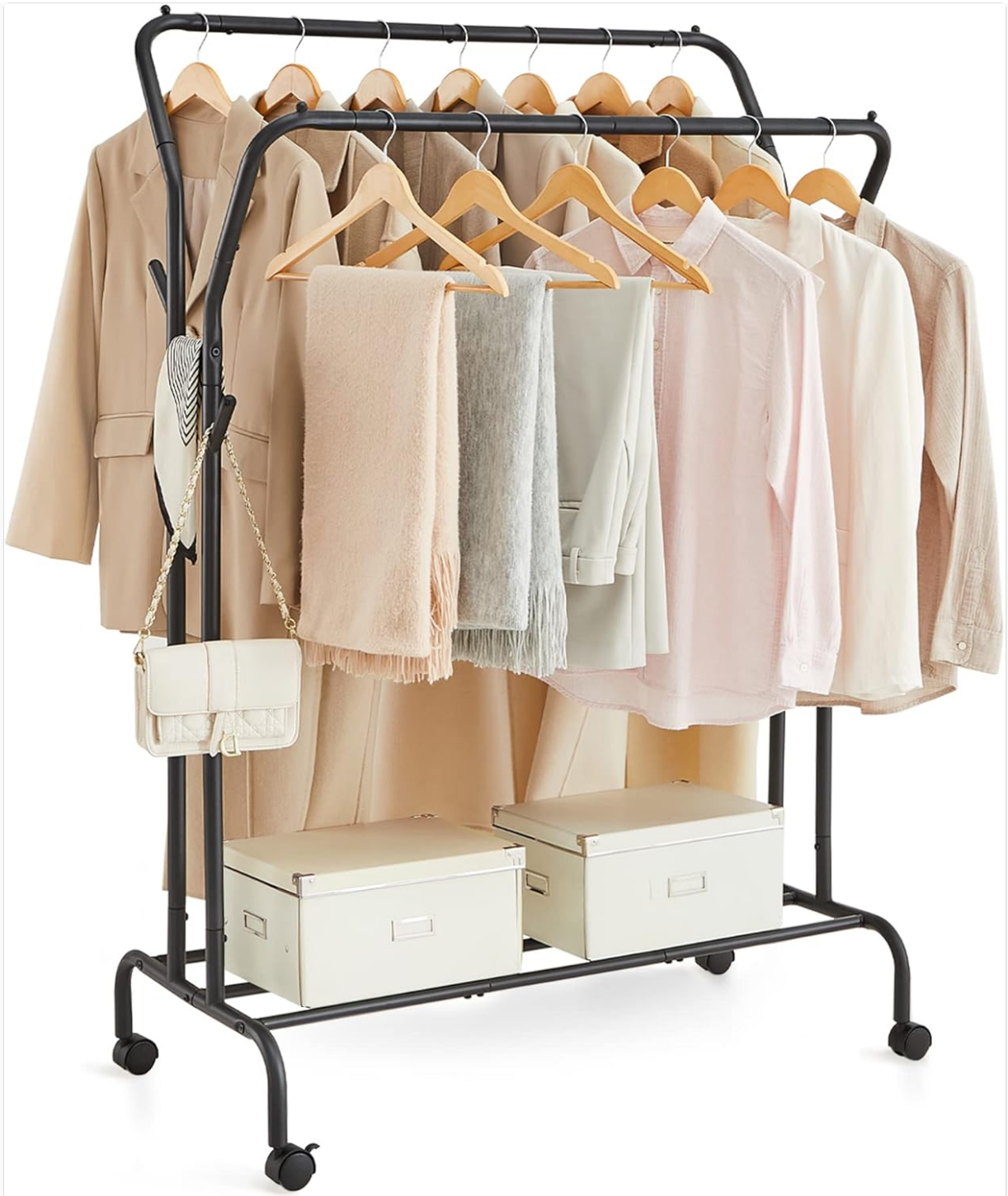
Image 1.1: Fully assembled SONGMICS HSR107B01V1 Double-Rod Garment Rack, showcasing its storage capacity with various garments, bags, and storage boxes.