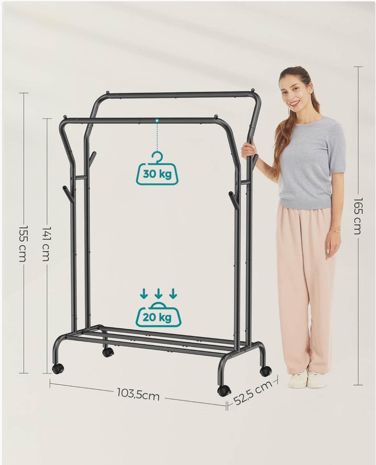
Image 7.1: Detailed diagram illustrating the dimensions (width 103.5cm, depth 52.5cm, height 141-155cm) and weight capacities (30kg for top rods, 20kg for bottom shelf) of the garment rack.