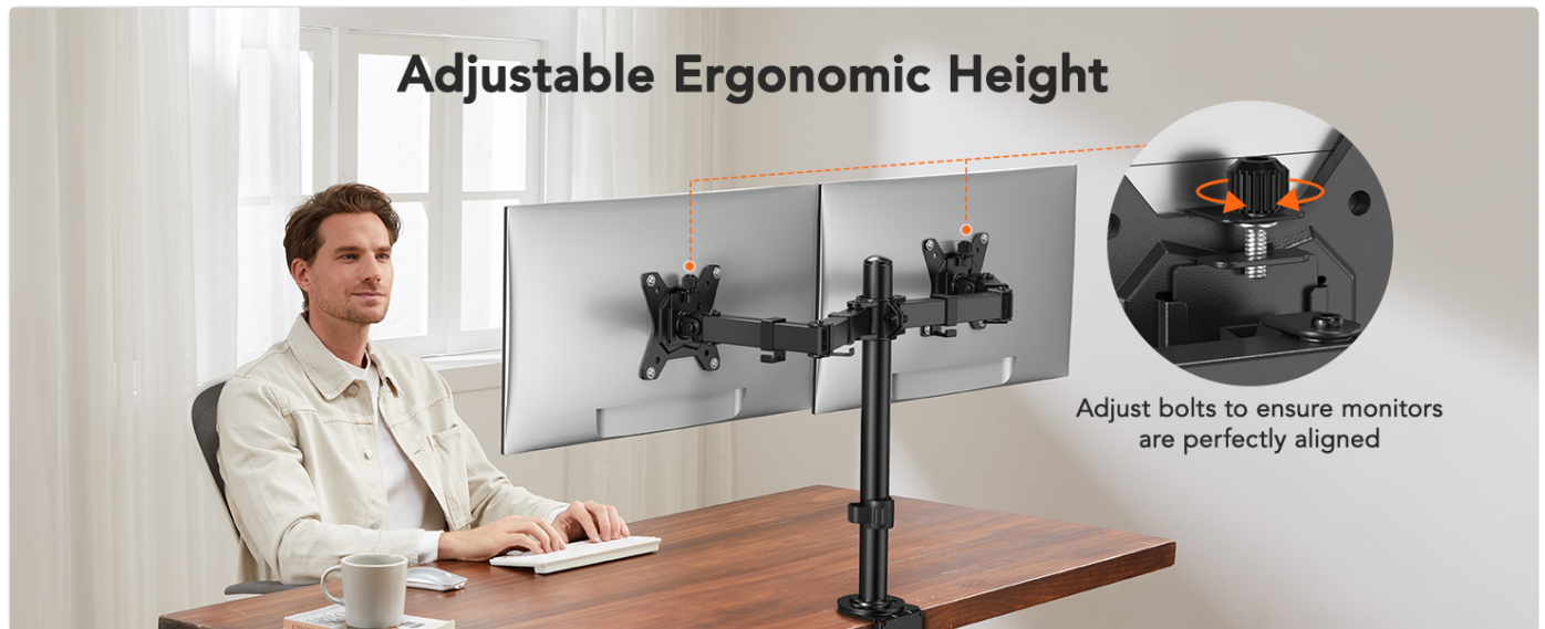
Image: Two monitors securely mounted on the ErGear Dual Monitor Desk Mount, demonstrating a clean and organized workspace.

Carefully slide the monitor (with the attached VESA plate) onto the swivel arm. Secure it by tightening the locking screw. Adjust the screw with the Allen key to adjust the height of the VESA panel as needed (clockwise to lower, counter-clockwise to raise).