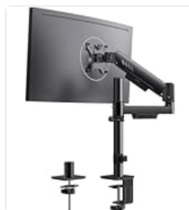
Image: Visual representation of the monitor's flexible adjustments, including \pm 45^\circ tilt, \pm 90^\circ swivel, and 360° rotation, allowing for ergonomic positioning.