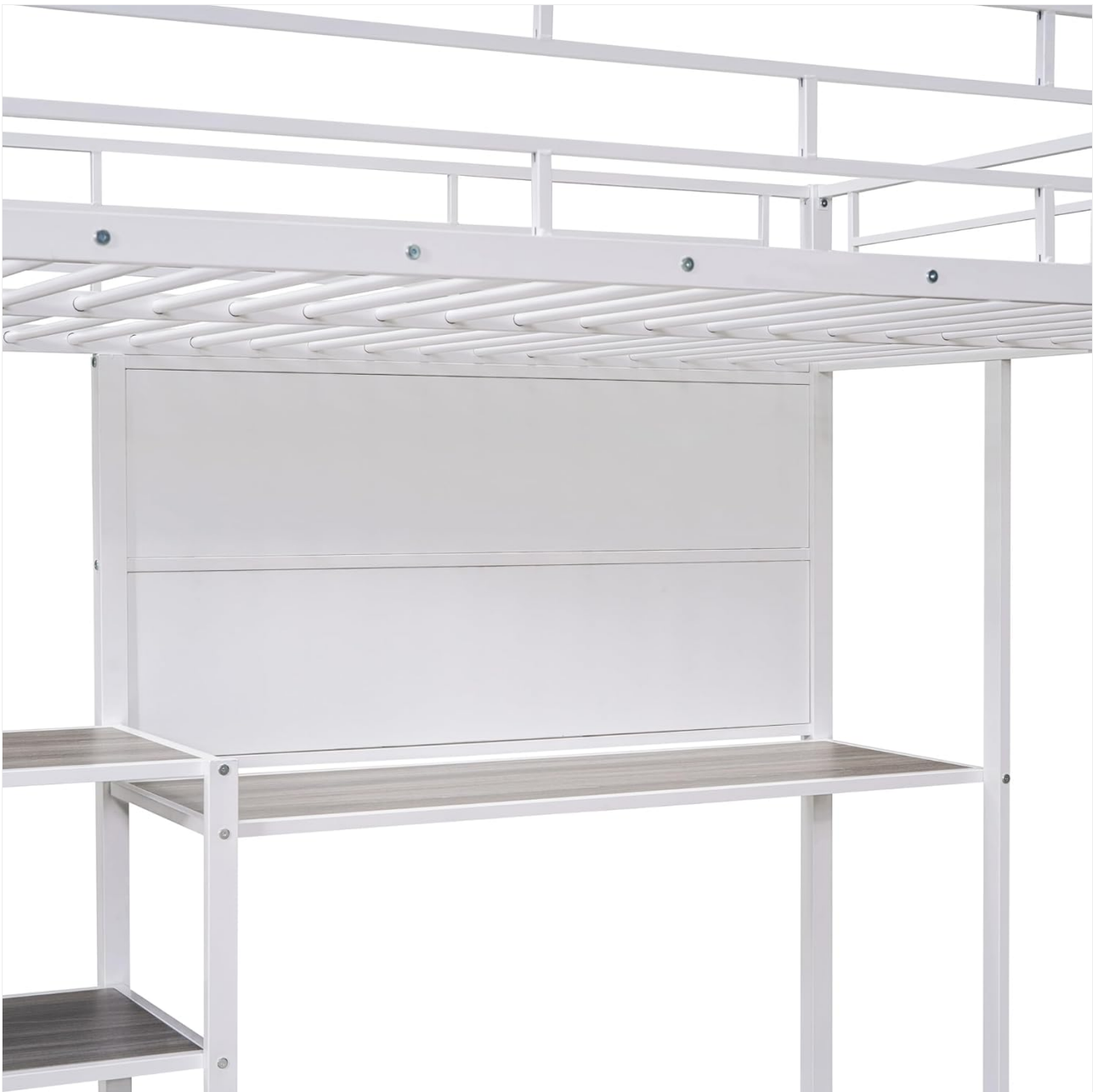
Detailed view of the integrated whiteboard and desk area, showing the surface for writing and the workspace below.