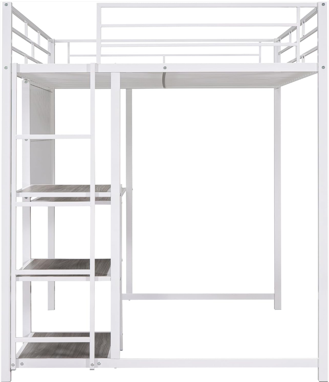
Side view of the Bellemave Full Size Metal Loft Bed, illustrating the integrated ladder and the tiered shelving unit.