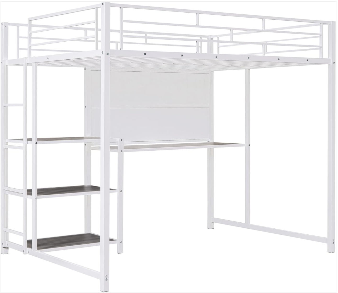
Front view of the Bellemave Full Size Metal Loft Bed, clearly showing the arrangement of the bed, desk, and storage shelves.