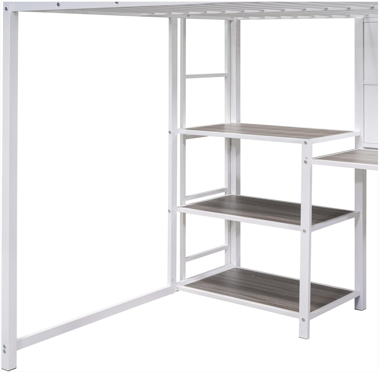
Close-up of the 3-tier storage shelves, demonstrating their capacity and design for organizing items.