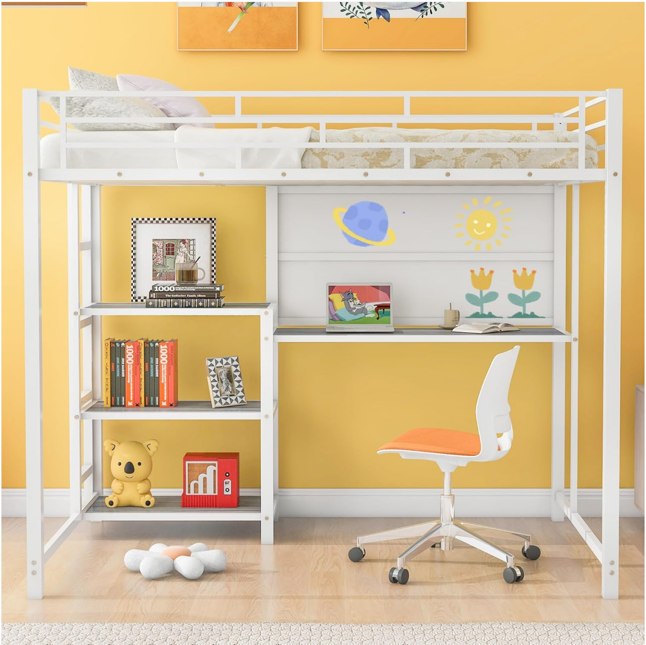
An illustrative image of the assembled Bellemave Full Size Metal Loft Bed in a room setting, showcasing the integrated desk, whiteboard, and 3-tier shelves.