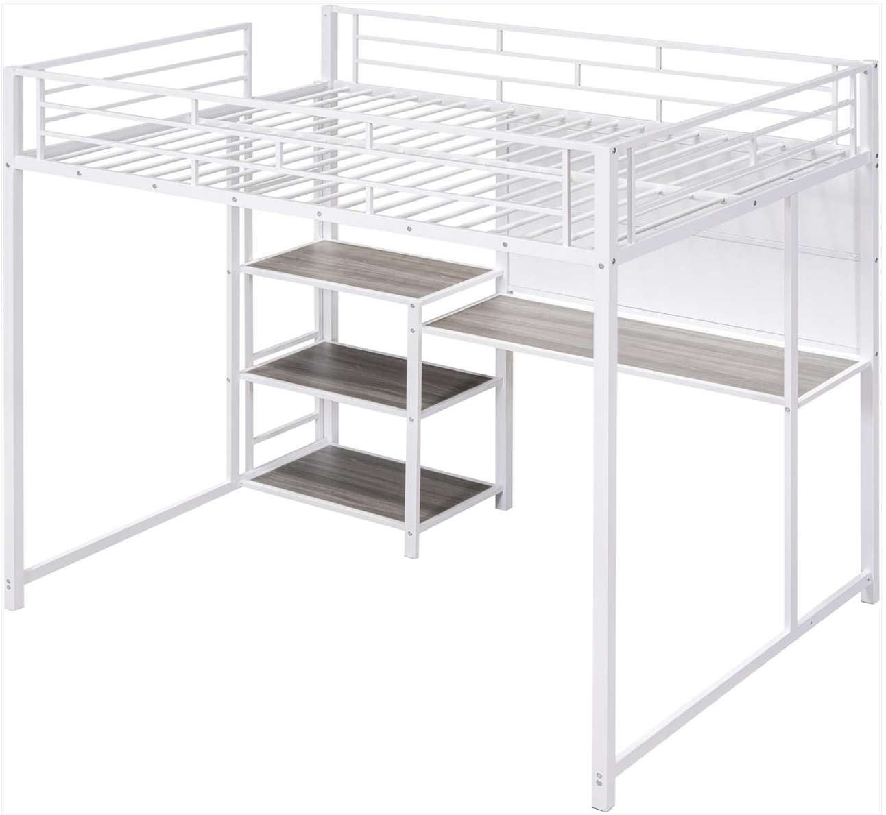
Angled view of the Bellemave Full Size Metal Loft Bed, providing a comprehensive look at its structure, including the bed, desk, and shelves.