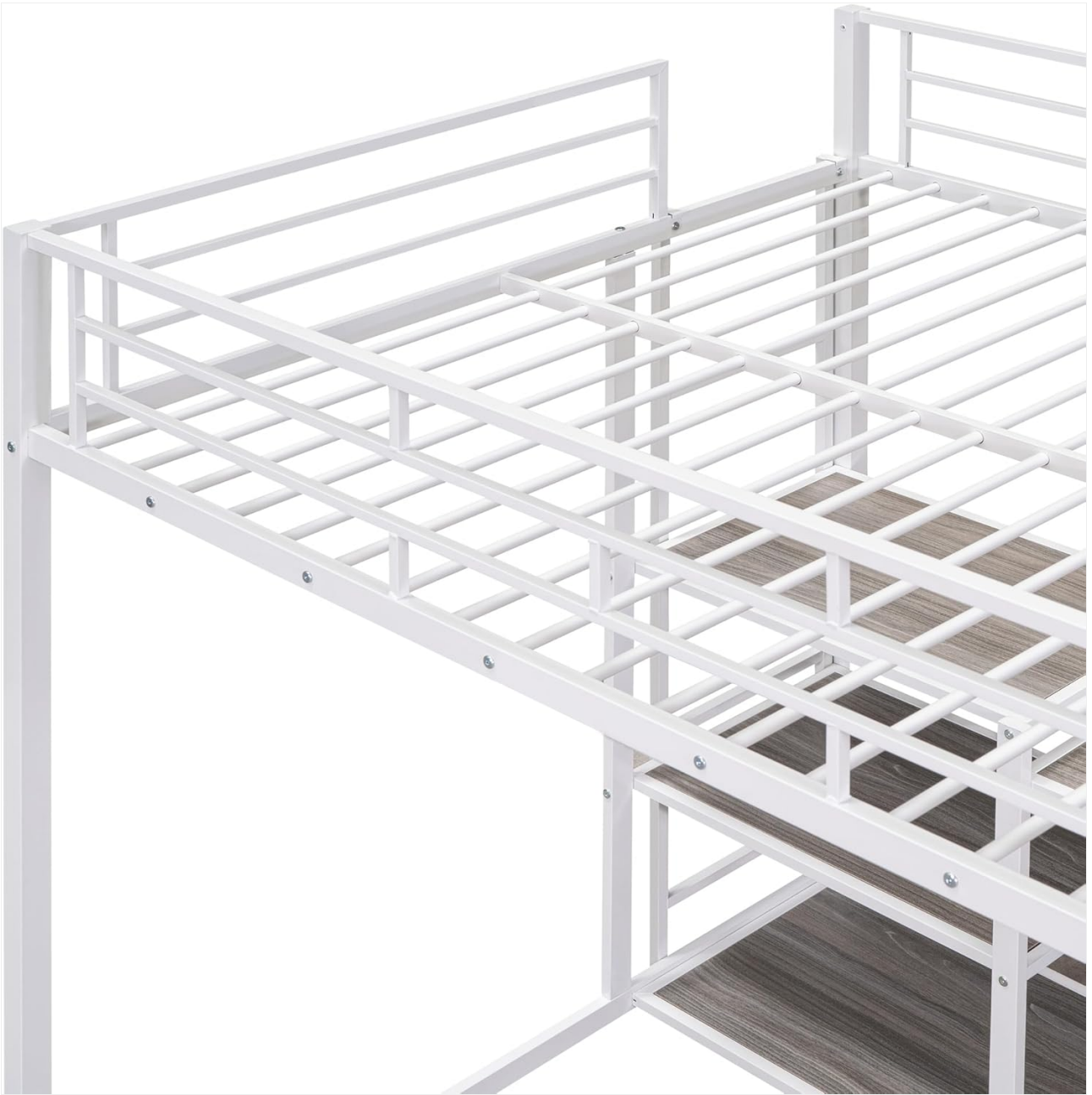
Close-up view of the metal slat support system for the mattress, highlighting the sturdy construction of the bed frame.