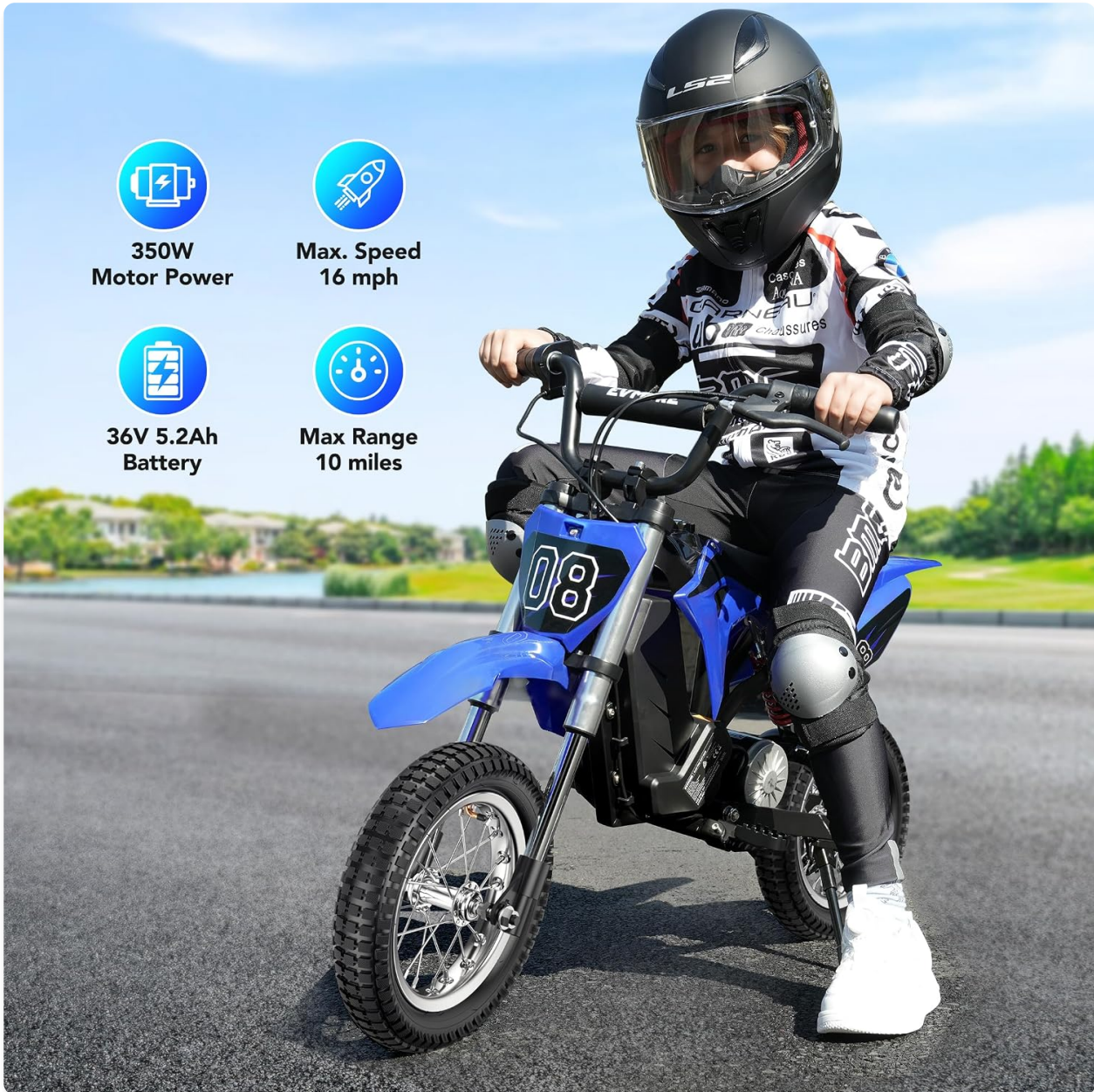
Key performance specifications of the Evmore Electric Dirt Bike.