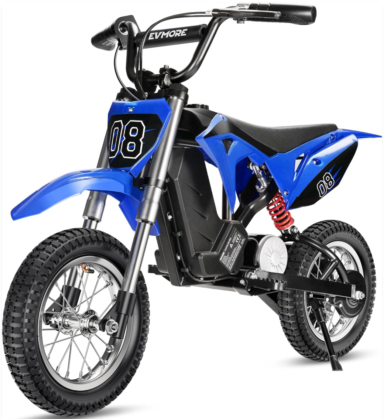
The Evmore Kids Electric Dirt Bike, designed for young riders.