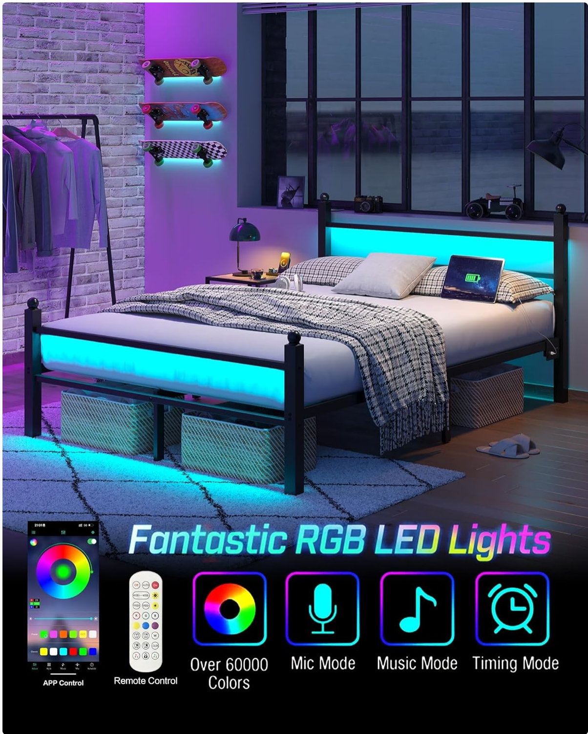
Image: The bed frame illuminated by RGB LED lights, showing the remote and app control options.

Once all steps are completed, double-check all connections to ensure they are secure before placing your mattress on the frame.