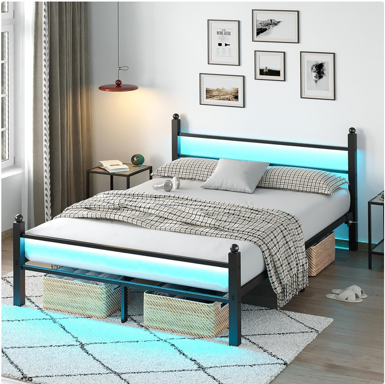
Image: CollaredEagle Queen Bed Frame, showcasing the complete product with LED lights and under-bed storage.