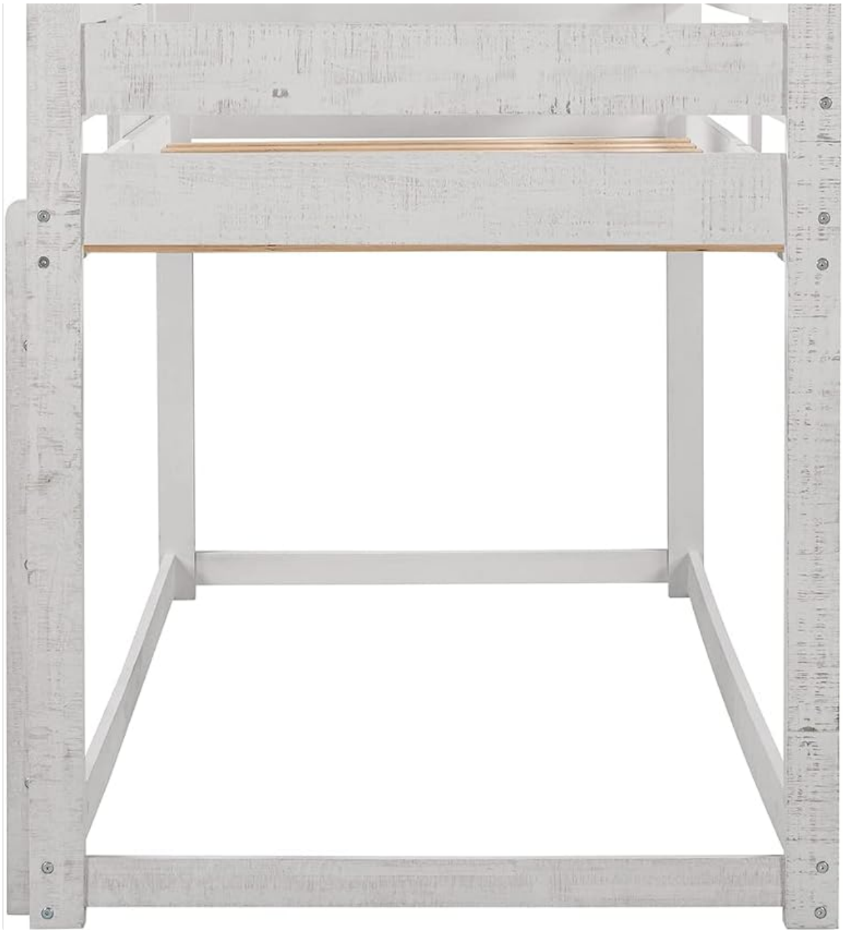
Figure 1: The Generic Twin Over Twin Bunk Bed Wood Loft Bed.