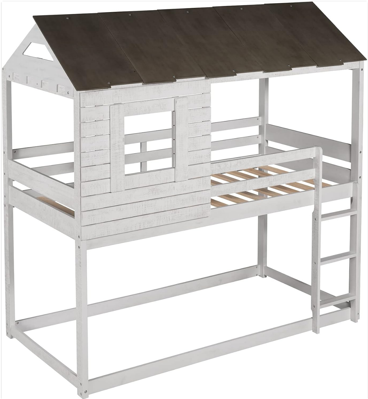
Figure 5: Angled view of the bunk bed, showing the roof and guardrails.