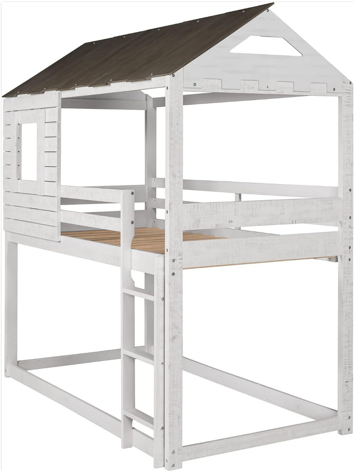
Figure 7: View showing the slat base for mattress support.