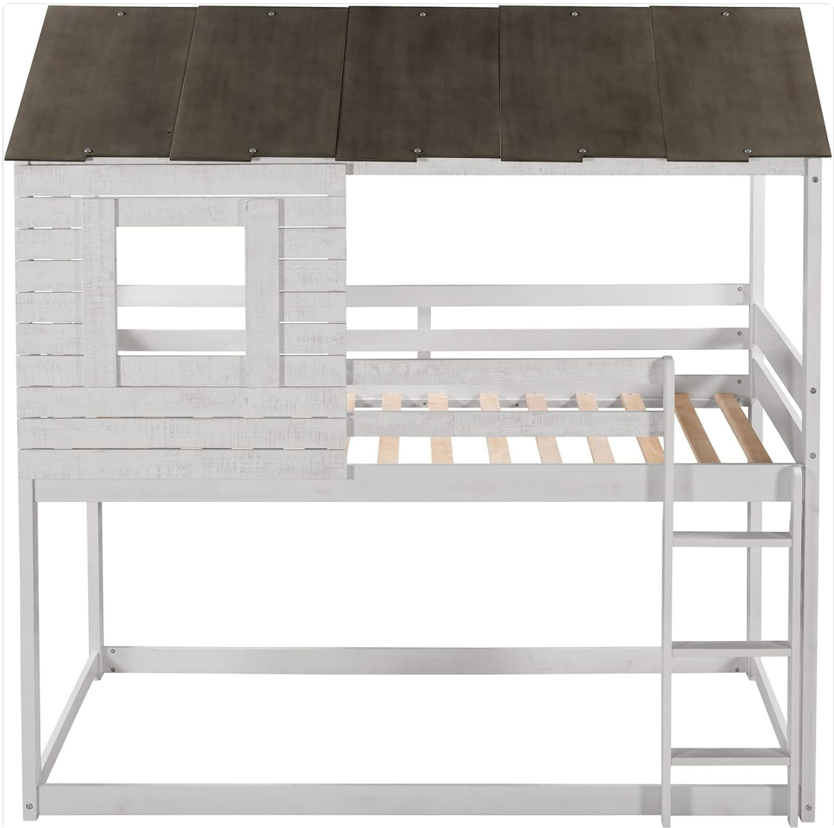
Figure 4: Side view of the bunk bed, highlighting the window and ladder placement.