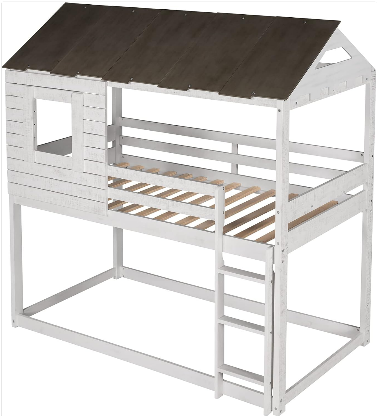
Figure 6: Close-up of the roof and window panel installation area.