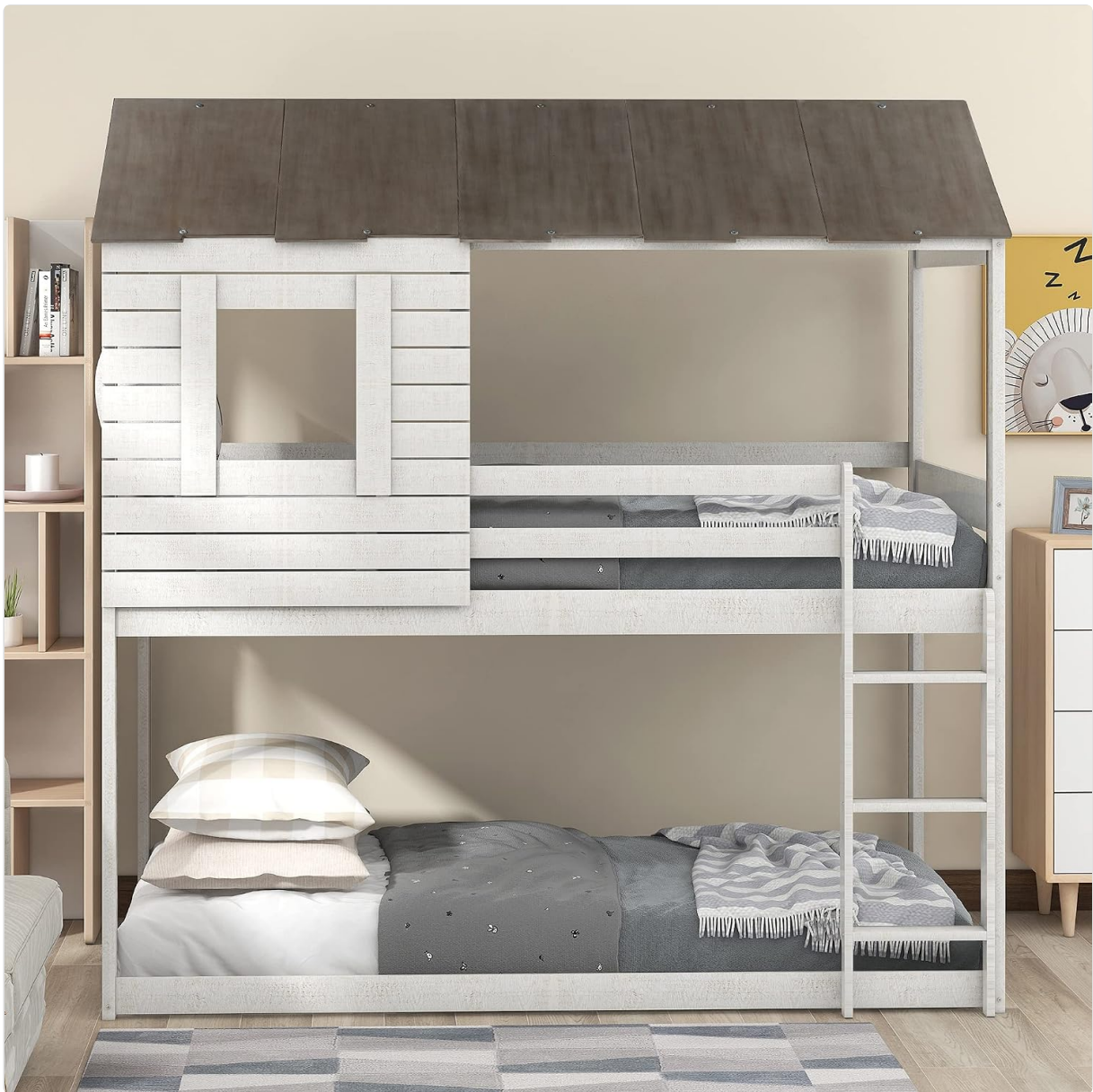
Figure 3: Assembled bunk bed, illustrating the overall structure.