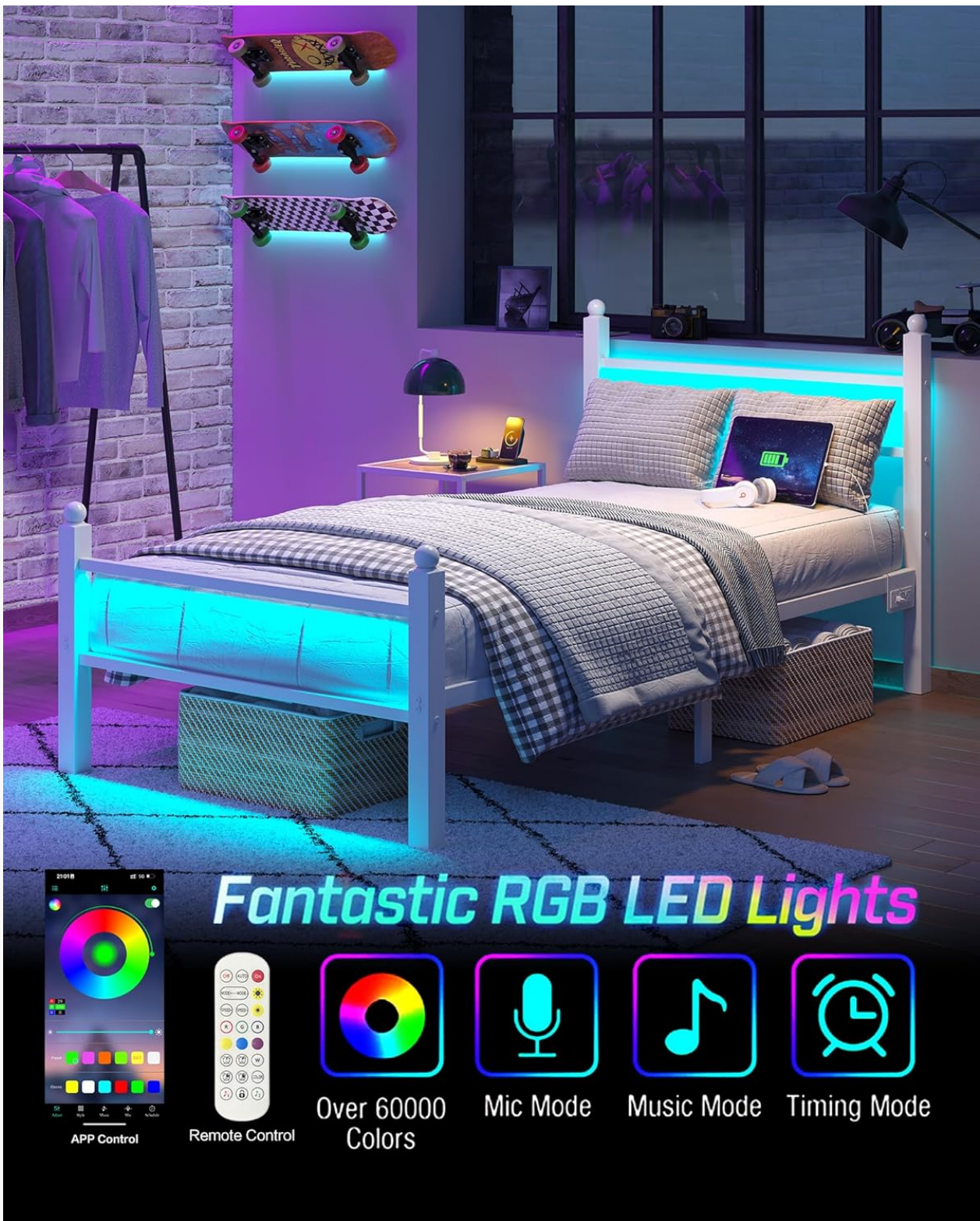
Image 5.2: Overview of the LED lighting system's capabilities, including remote and app control for various colors and modes.