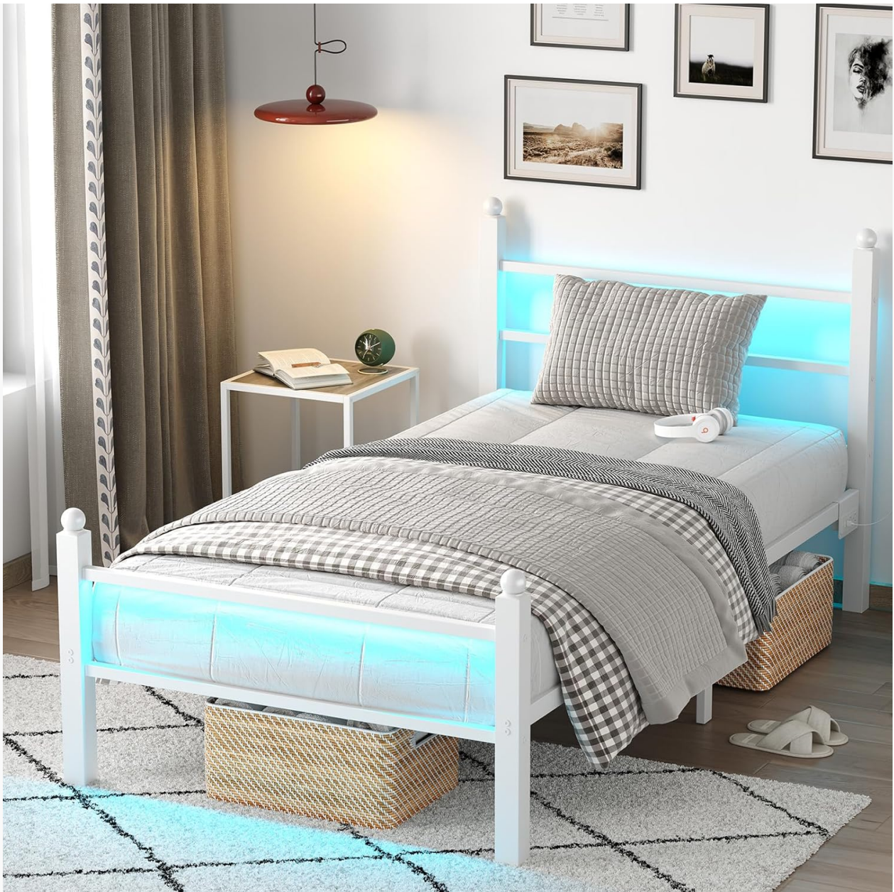
Image 1.1: The CollaredEagle Twin Bed Frame, showcasing its integrated LED lighting and modern design.