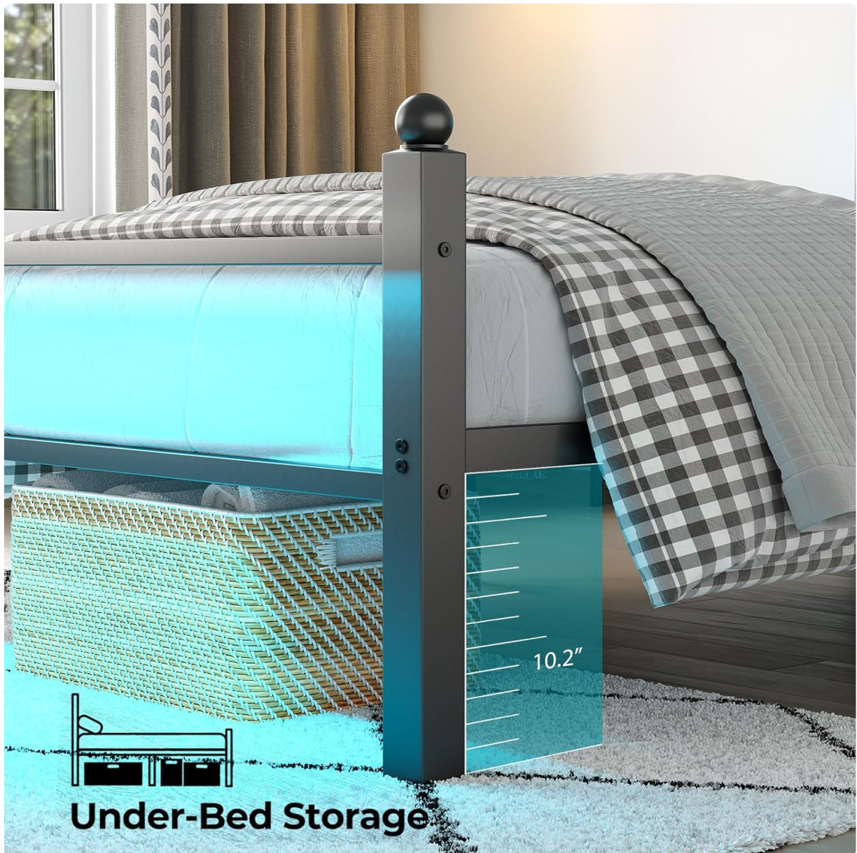
Image 5.1: Under-bed storage clearance for organization and cleaning.