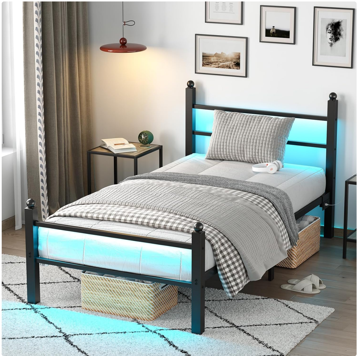
Image 1.1: The CollaredEagle Twin Bed Frame with integrated LED lighting and charging station.