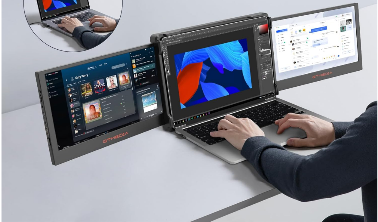
Image: An efficient laptop screen extender setup, demonstrating increased productivity.