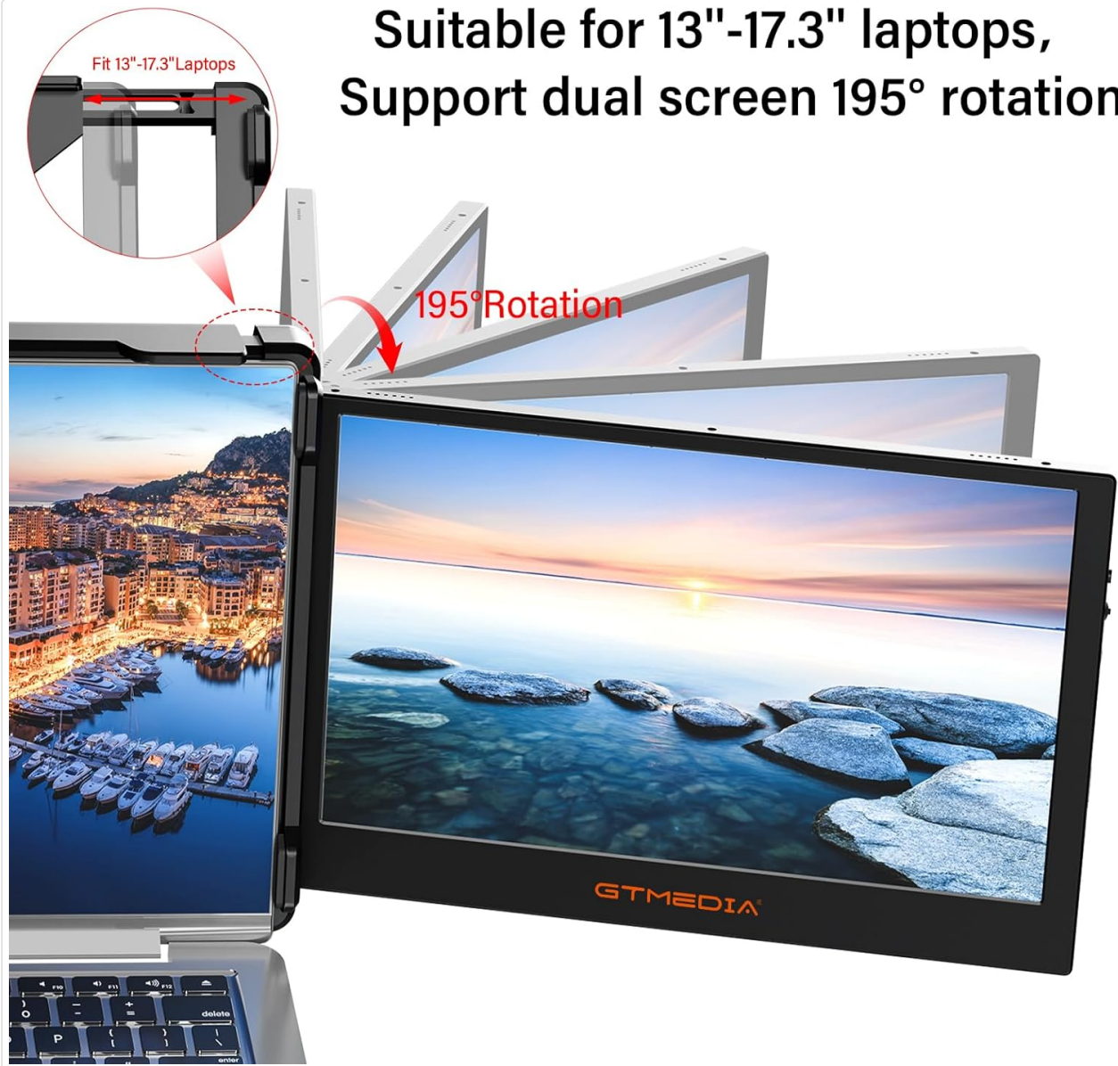
Image: Retractable stand for 13" to 17.3" laptops, showing how it attaches and rotates.

Suitable for 13"-17.3" laptops, Support dual screen 195° rotation