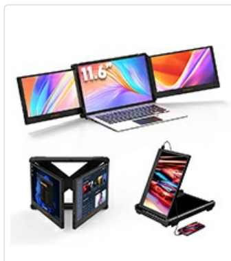
Image: Portable design of the GTMEDIA monitor.