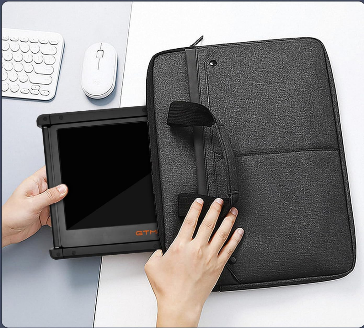
Image: The GTMEDIA triple screen extender being easily carried in a bag.