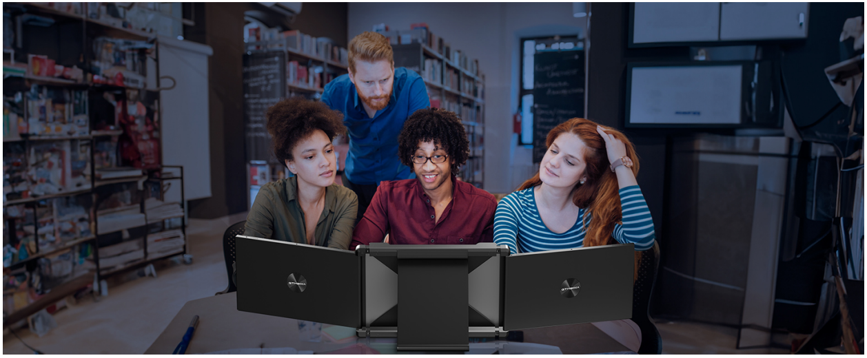
Image: Triple screen setup optimized for gaming, showing immersive visuals.