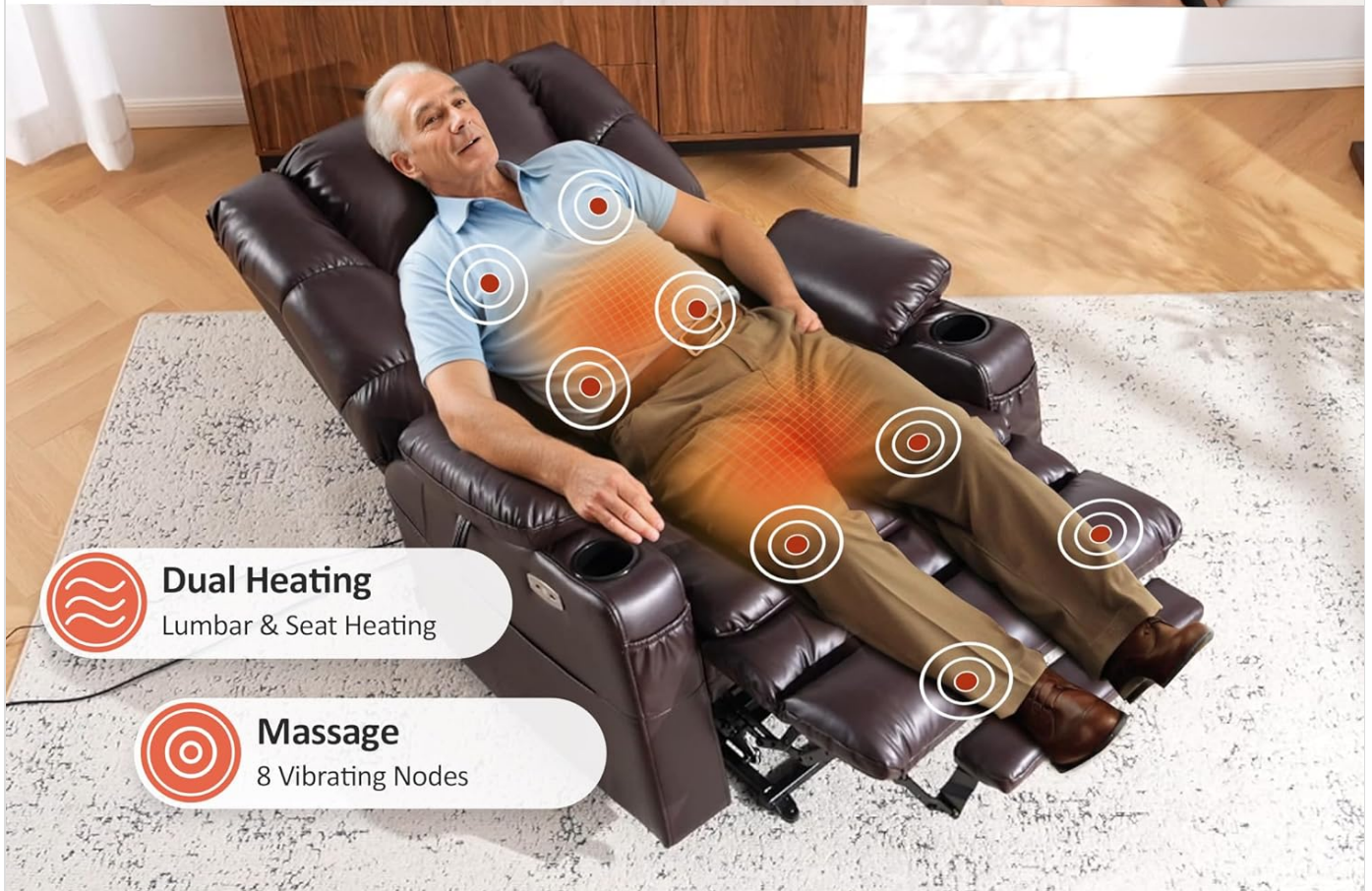
Image: Massage & Lumbar and Seat Heating

A man is shown relaxing in the recliner with illuminated circles indicating the 8 vibrating massage nodes and dual heating zones in the lumbar and seat areas.