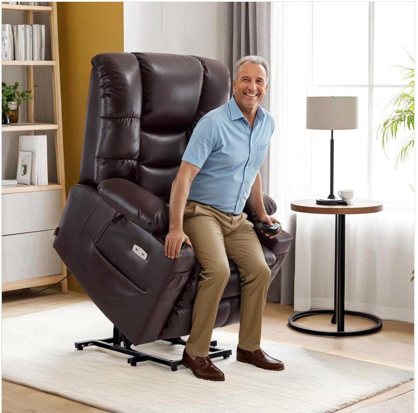
Image: Power Lift Assistance

An elderly man is shown effortlessly standing up from the MCombo recliner using its power lift assistance feature, demonstrating the chair's ability to tilt forward and upward.