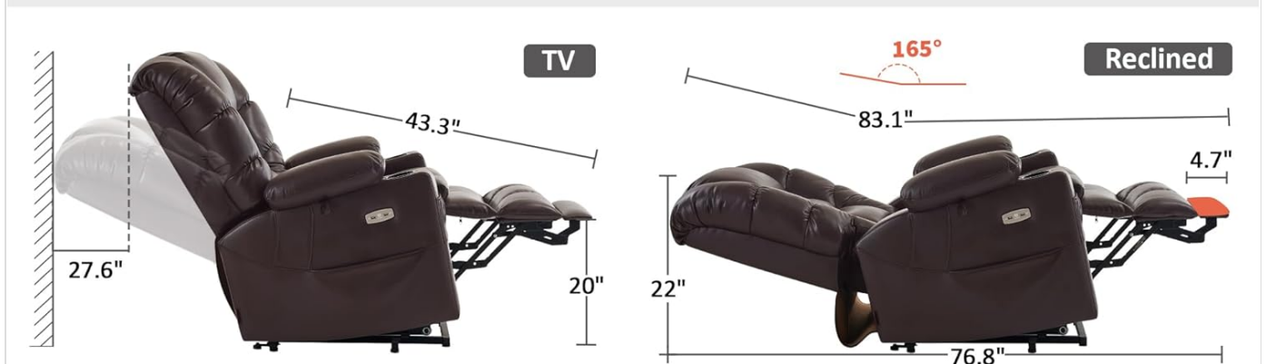
Image: Product Dimensions

An illustration detailing the dimensions of the MCombo recliner, including height, width, depth, seat height, and backrest height, along with the maximum load capacity (350 lbs) and recommended user height (5'7"-6'2").