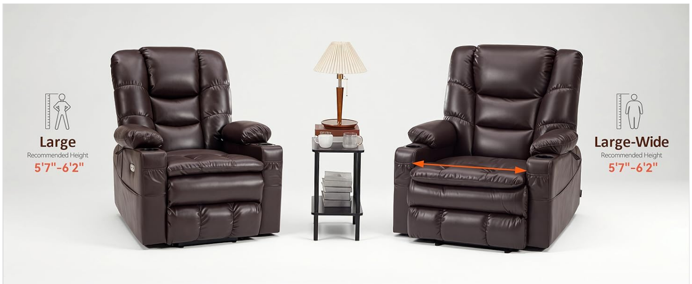
Image: Large Size Recliner

A visual comparison showing the 'Large' size MCombo recliner, recommended for individuals between 5'7" and 6'2" tall, providing context for its dimensions and suitability.