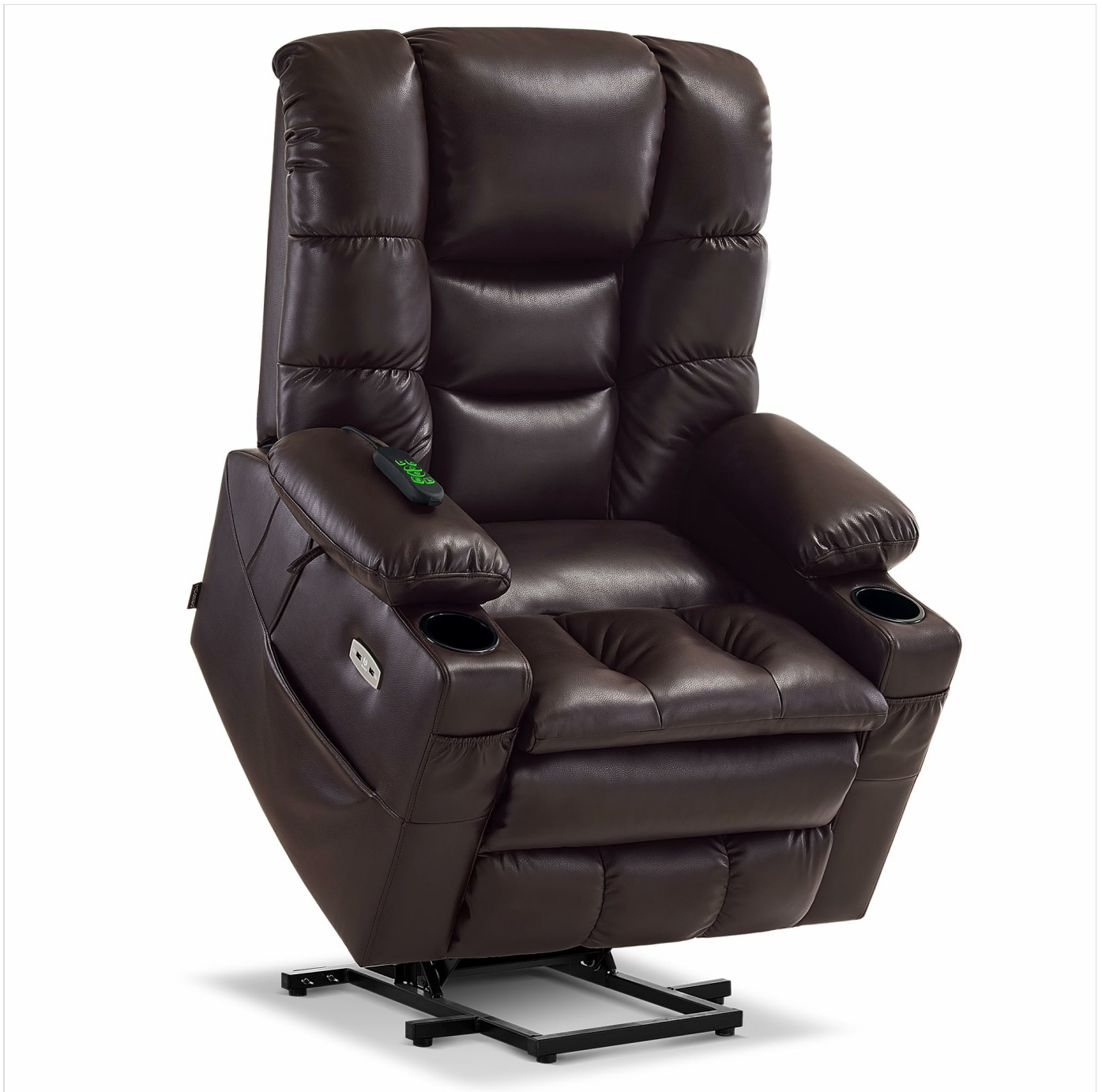
Image: Assembled MCombo Power Lift Recliner

A fully assembled MCombo Large Triple Motor Power Lift Recliner Chair in dark brown faux leather, showcasing its plush design and integrated cup holders.