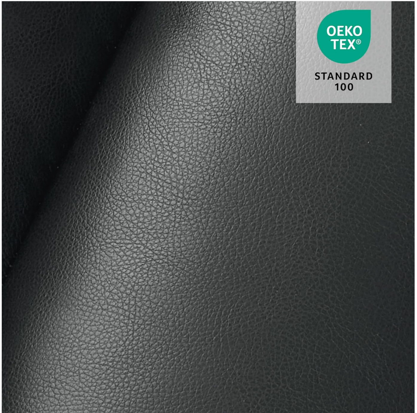
The faux leather material is durable and easy to clean, certified by OEKO-TEX Standard 100.