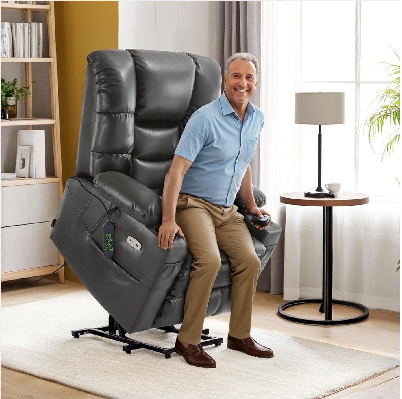
The power lift mechanism assists users in standing up from the chair.