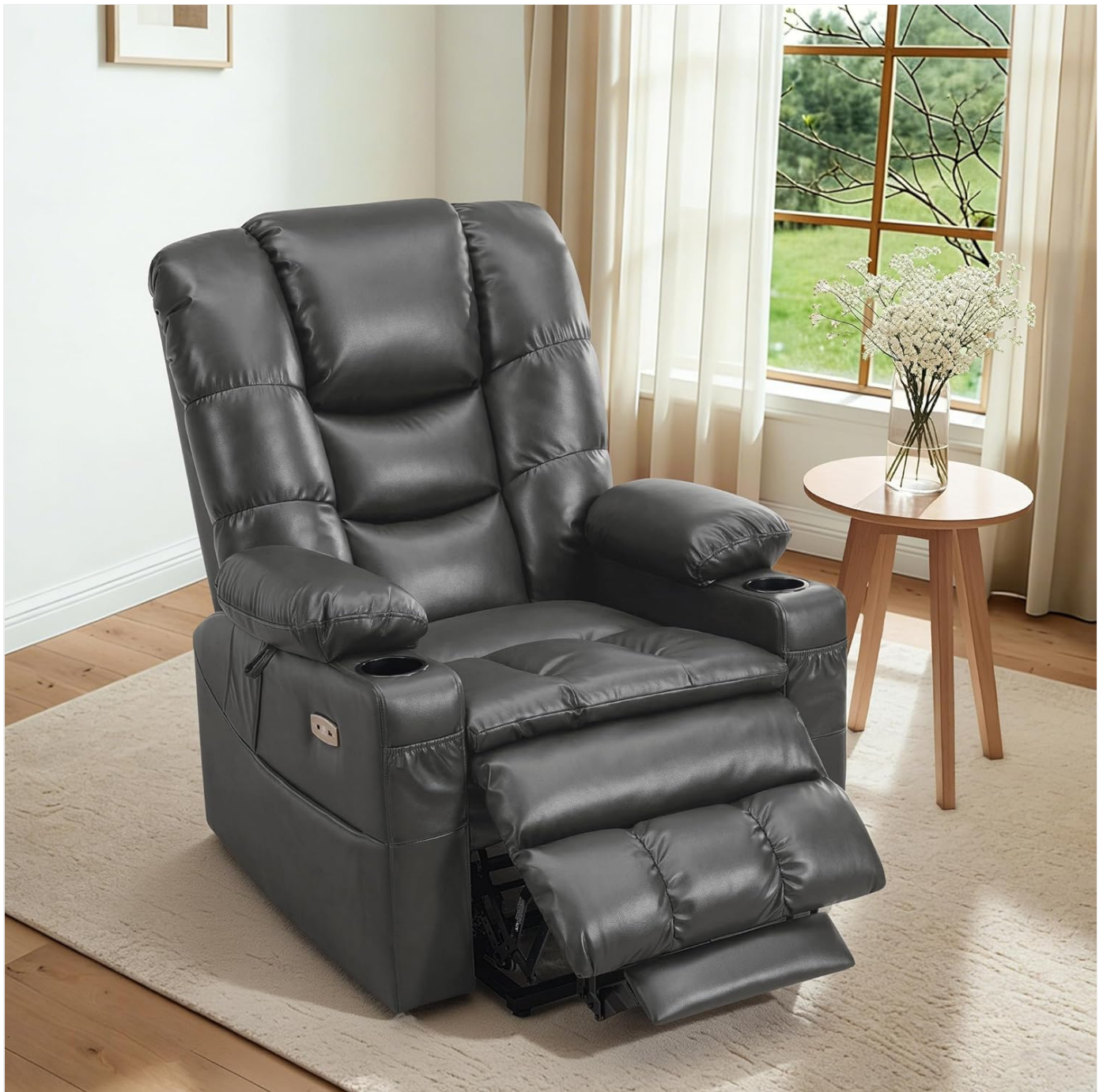
The MCombo Dual Motor Power Lift Recliner Chair, featuring a dark grey faux leather finish and integrated cup holders.