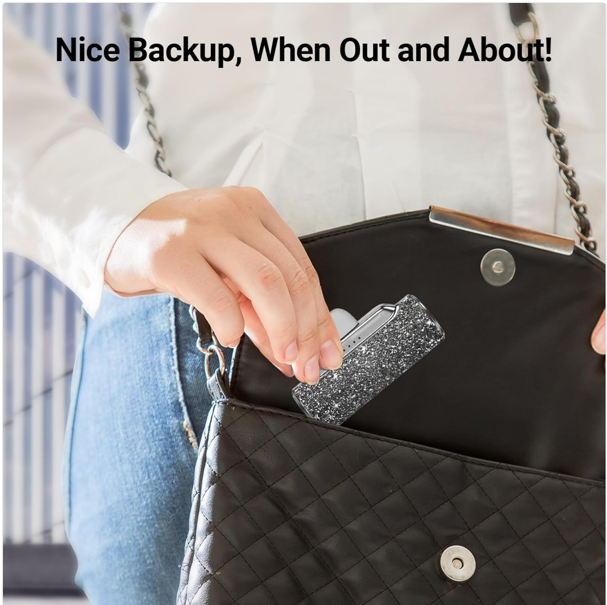
Figure 7: The compact charger fits easily into a handbag for convenient storage.