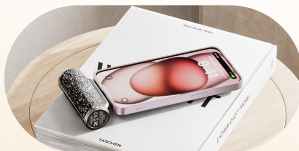
Figure 6: The charger is designed to fit with most phone cases.

Support your phone case keep on while charging