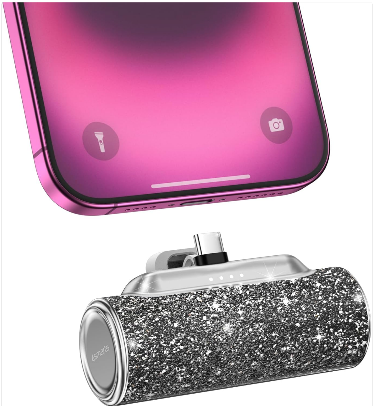
Figure 4: Direct plug-in charging of a smartphone using the built-in USB-C connector.