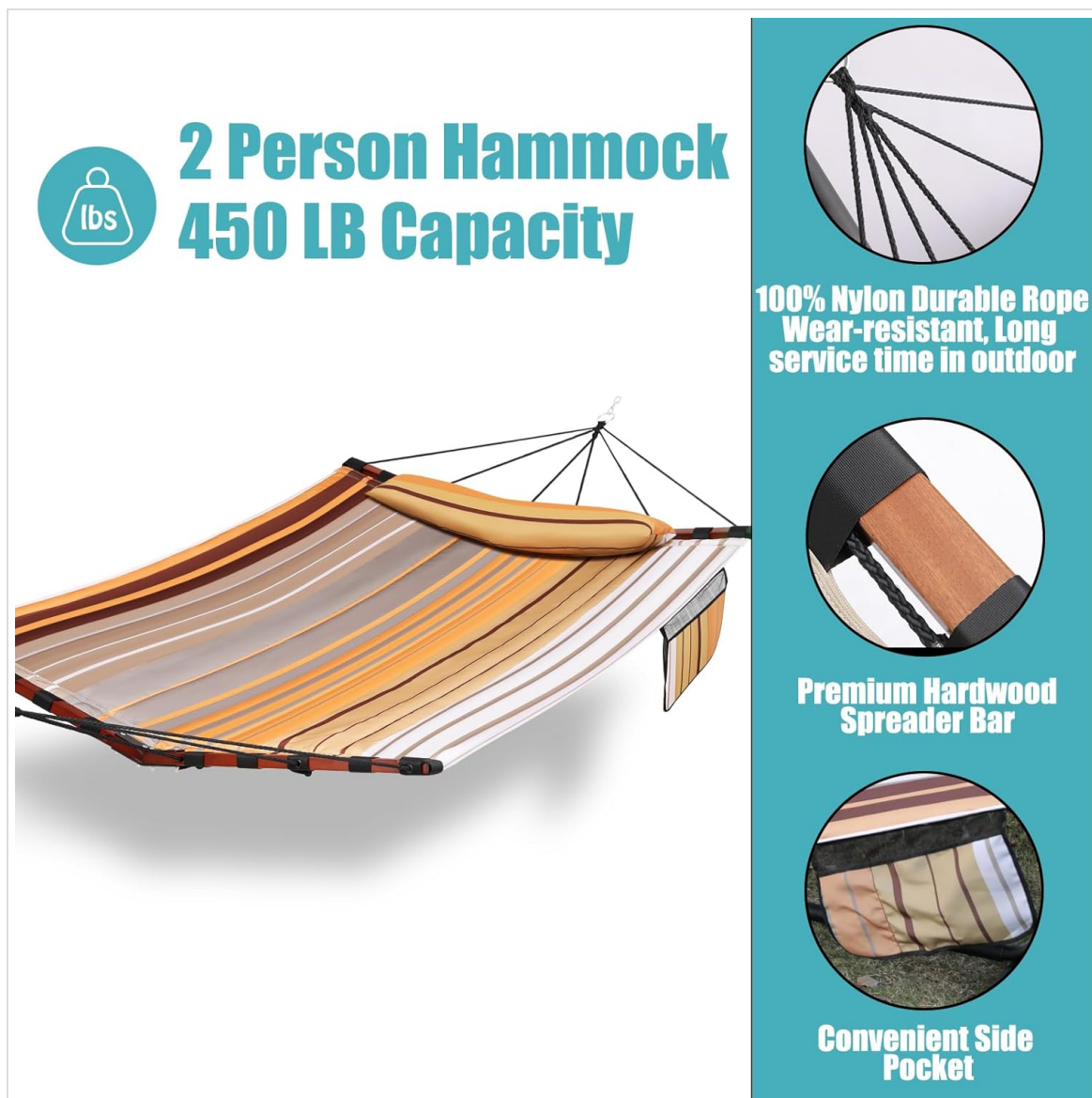
Image: Detailed view of the two-layer quilted polyester fabric, highlighting its soft padding.