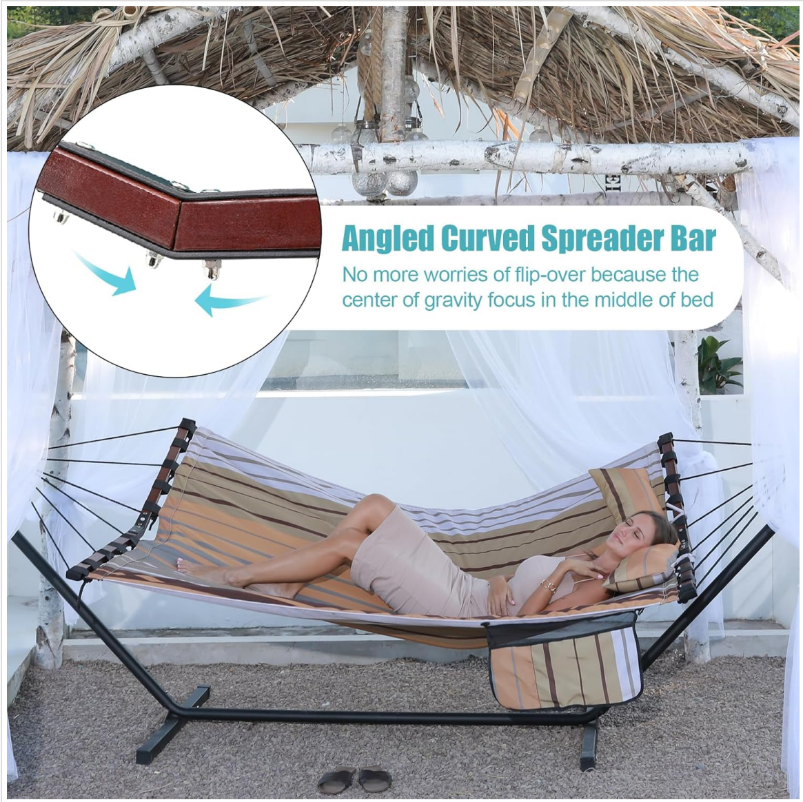
Image: Close-up of the V-shaped hardwood spreader bar, showing its angled design for stability.