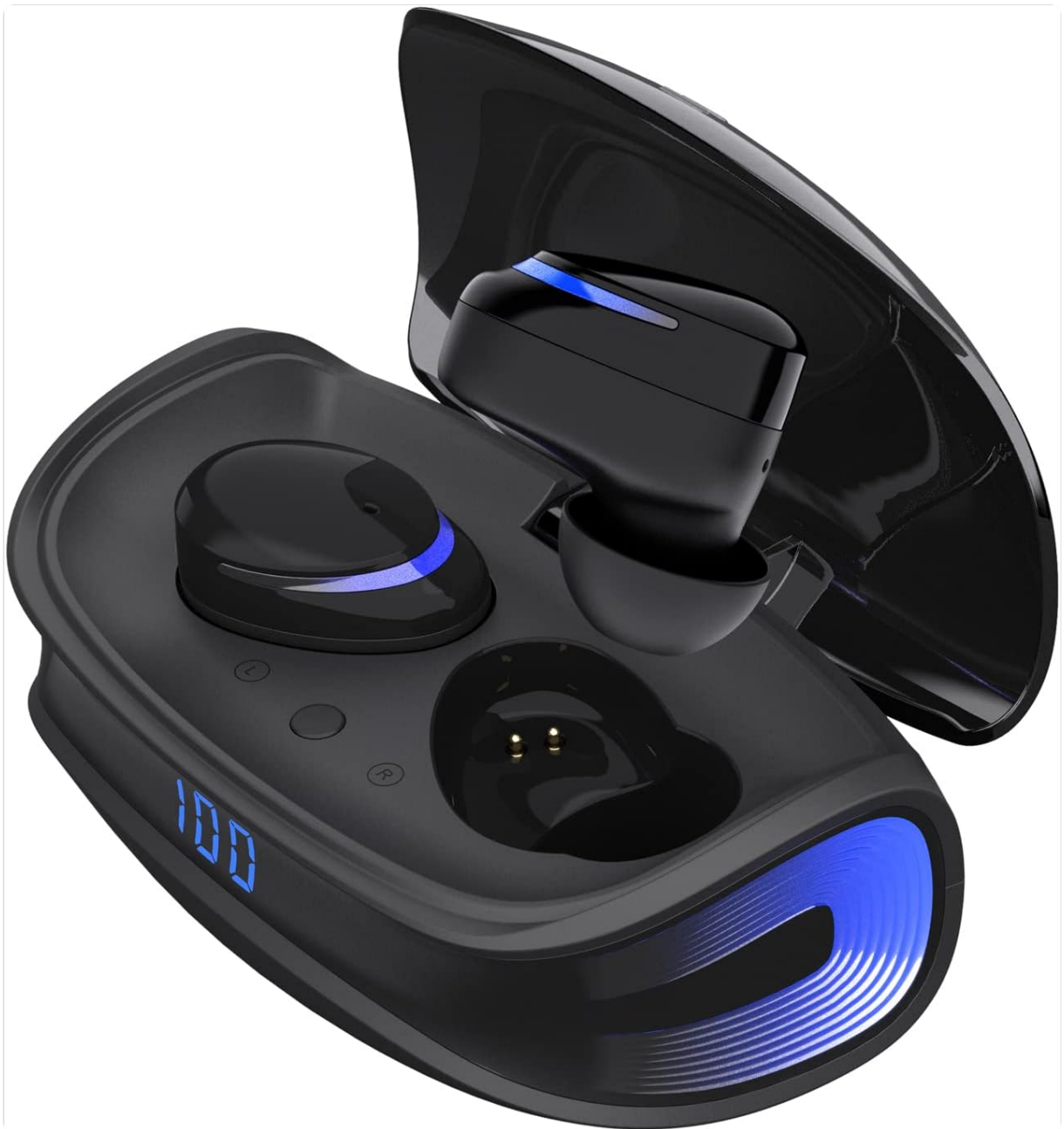
Image: The Cshidworld Wireless Earbuds securely placed within their charging case, illustrating the compact design and charging indicators.