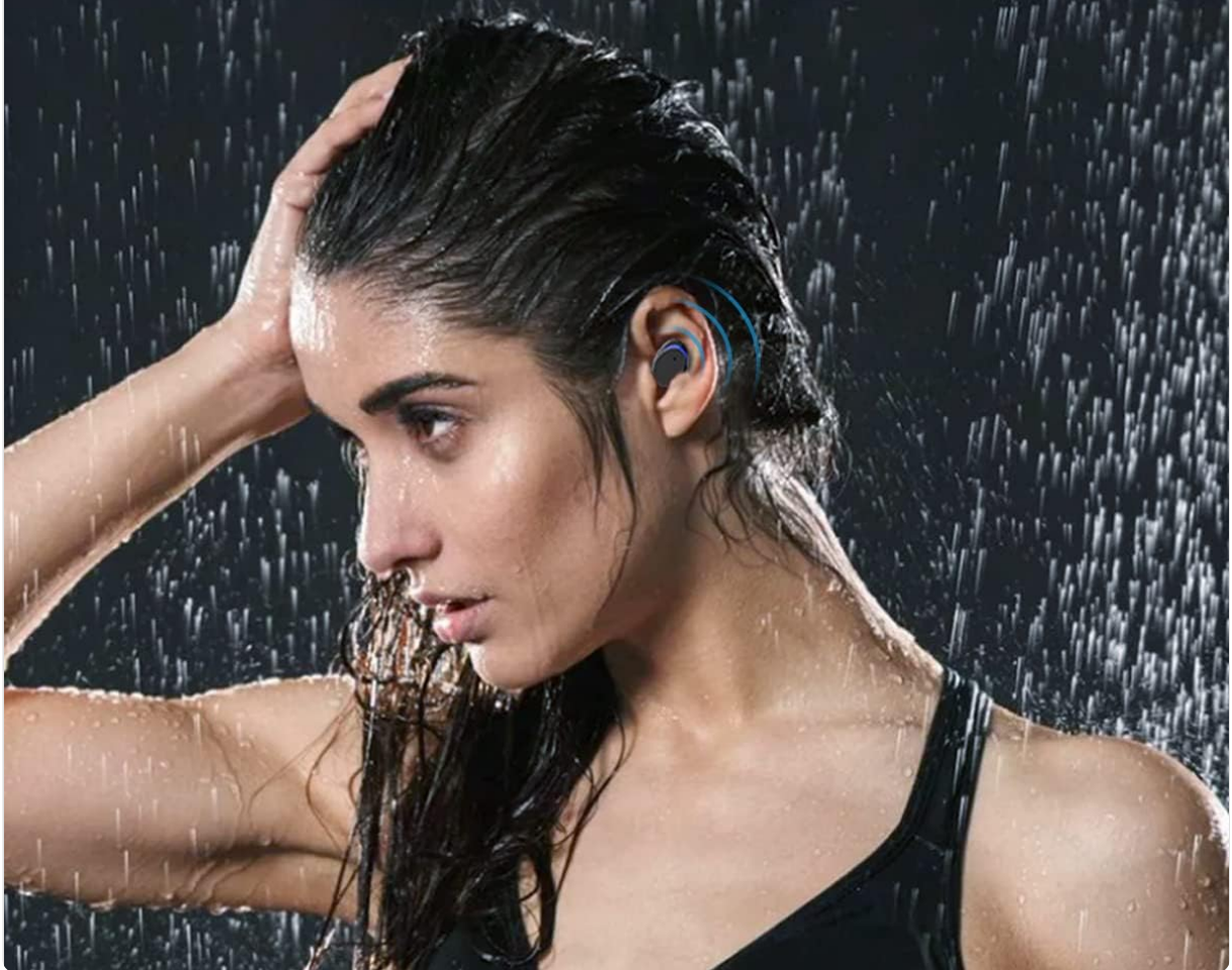
Image: A person exercising in the rain, demonstrating the IPX8 waterproof rating of the earbuds, which are resistant to sweat, water, and rain.

The earbuds incorporate CVC 8.0 advanced call noise reduction technology, which helps filter ambient sound and echo, enhancing the clarity of your calls. This ensures that your voice is captured clearly even in noisy environments.