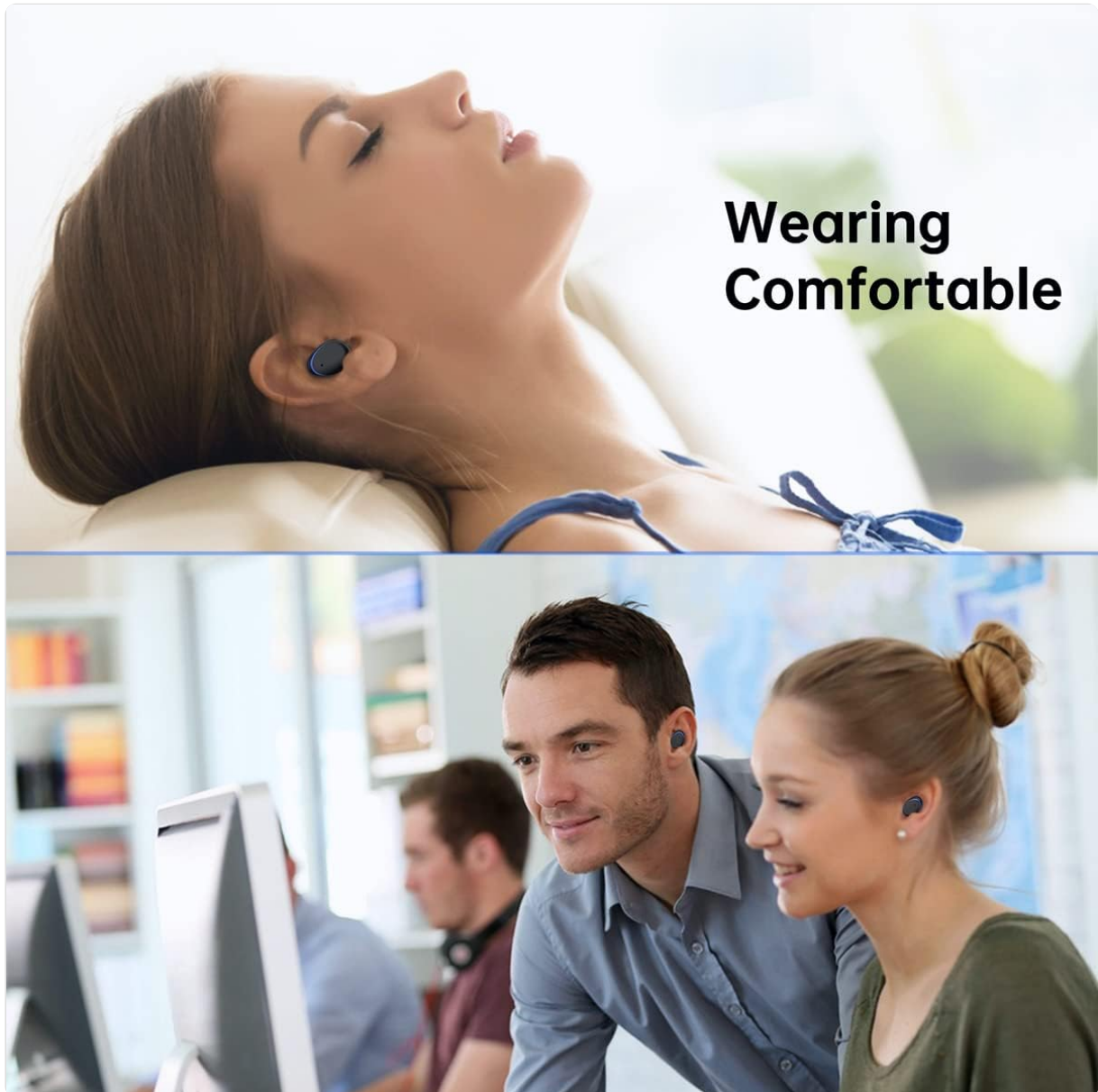
Image: Two scenarios showing individuals comfortably wearing the Cshidworld Wireless Earbuds, emphasizing their ergonomic design suitable for extended use.