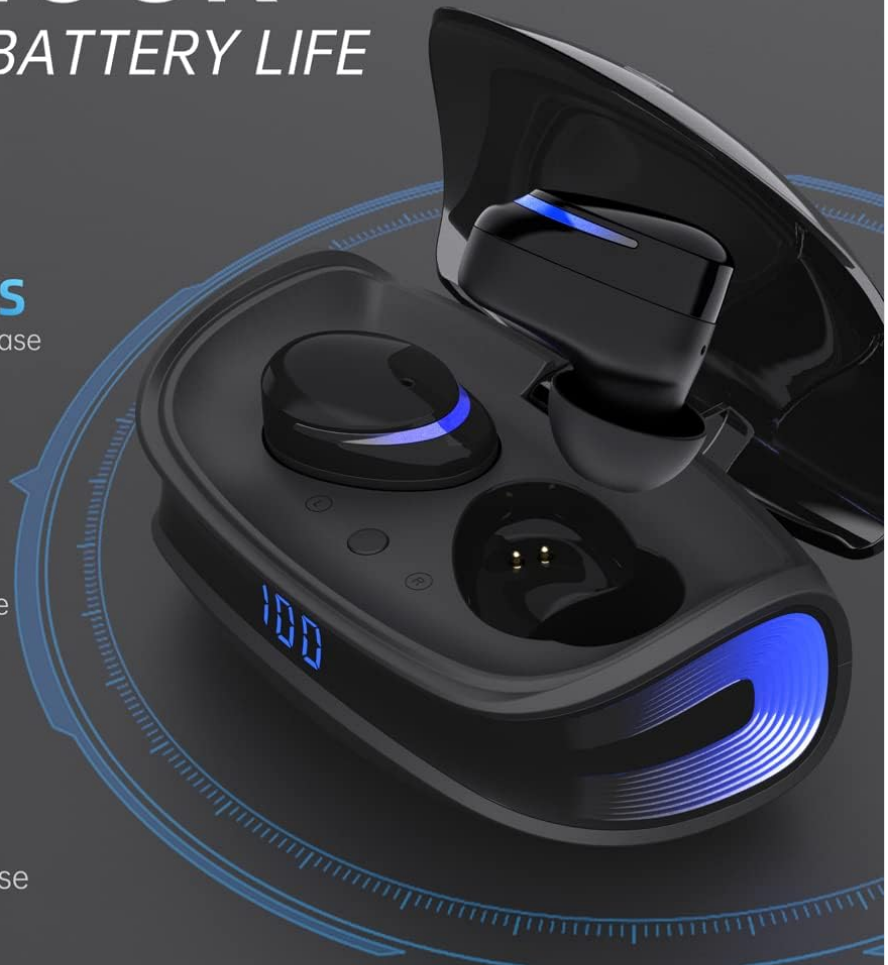
Image: An infographic detailing the battery life: 21 hours total with the charging case, 4.5 hours of playtime per single earbud charge, and 1 hour for the case to fully charge.