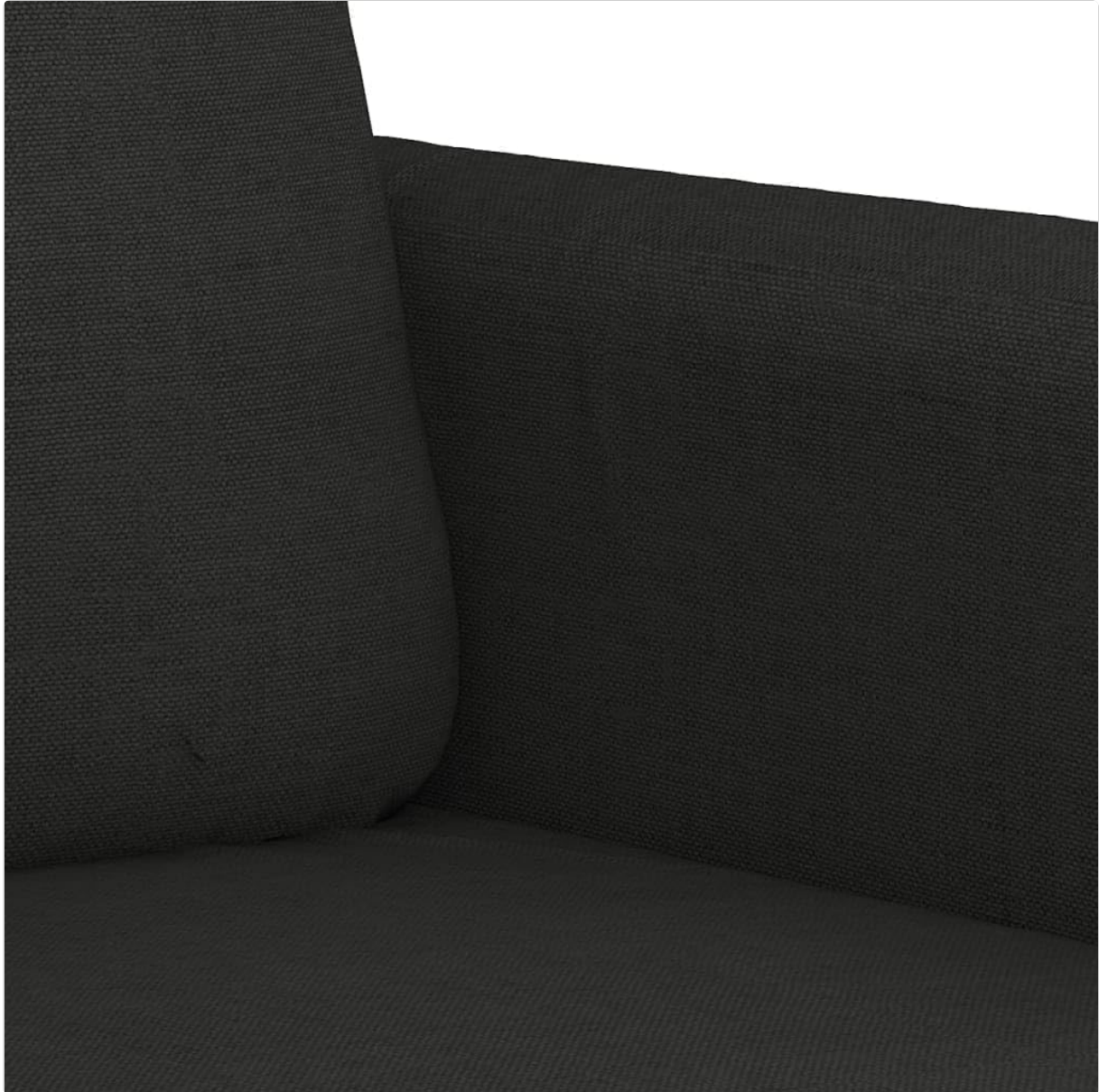
Image 4.1: The sofa set arranged in a typical living room environment.