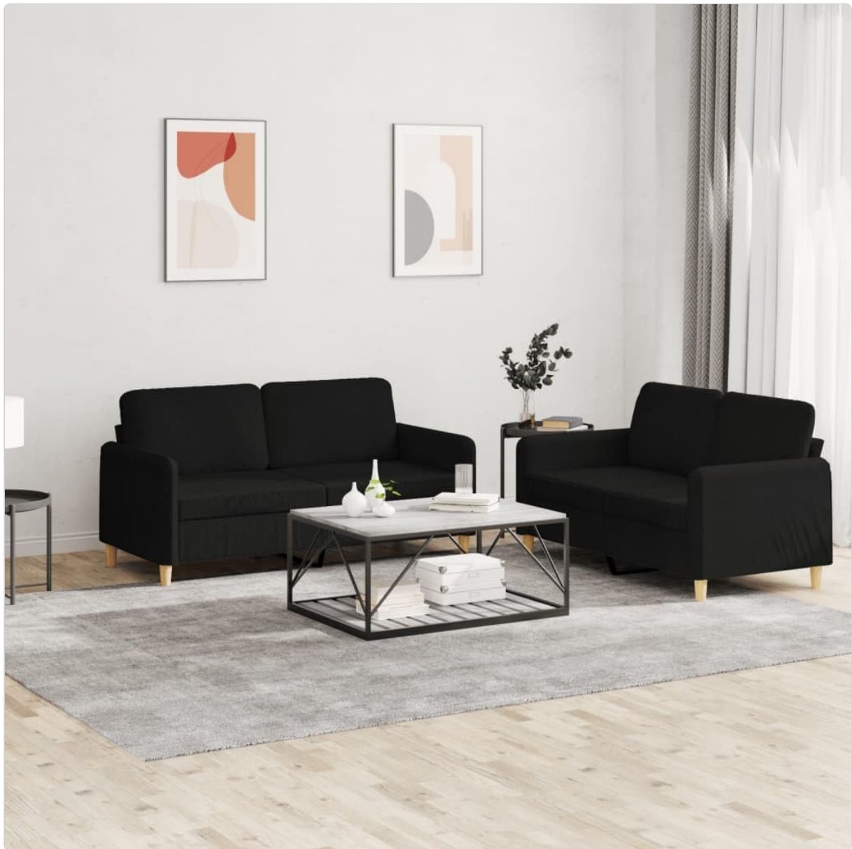
Image 1.1: Front view of the vidaXL 2-Piece Sofa Set, showcasing both sofas.