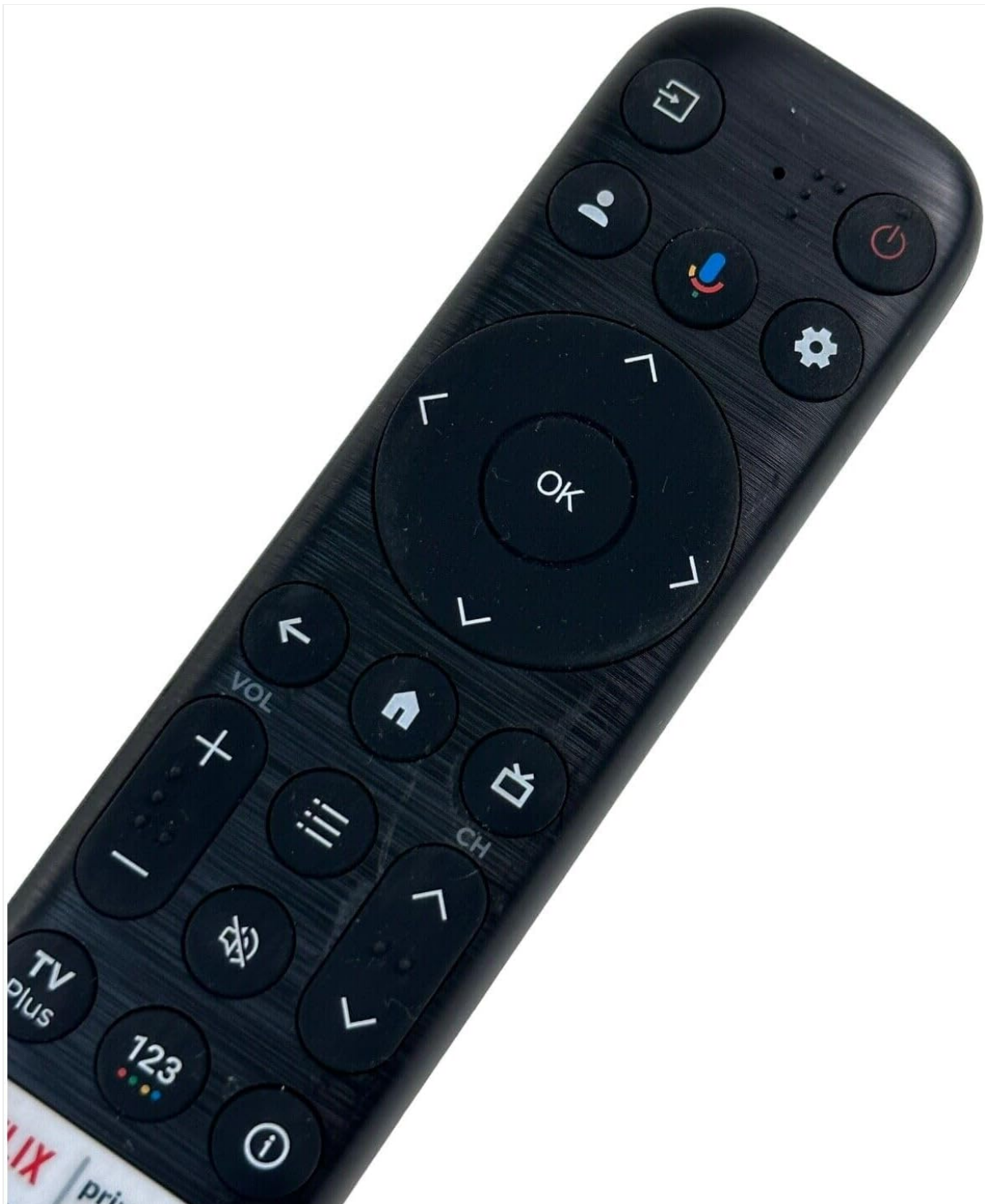
Figure 2.3: Detailed view of the upper section of the remote, highlighting the power, settings, user profile, and microphone buttons, along with the central OK button and directional pad.