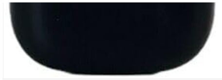
Figure 2.2: Back view of the Voice Remote Control, showcasing its smooth, curved design and battery compartment cover.