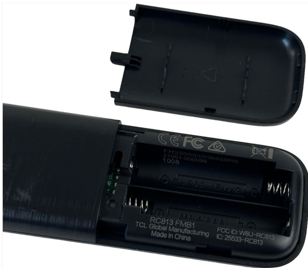
Figure 3.1: View of the open battery compartment, showing the slots for two AAA batteries and the FCC ID information.