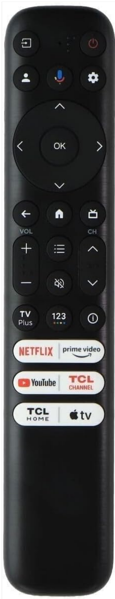
Figure 2.1: Front view of the Voice Remote Control, showing all buttons including the voice microphone, navigation pad, volume, channel, and dedicated app buttons for Netflix, Prime Video, YouTube, TCL Channel, TCL Home, and Apple TV.