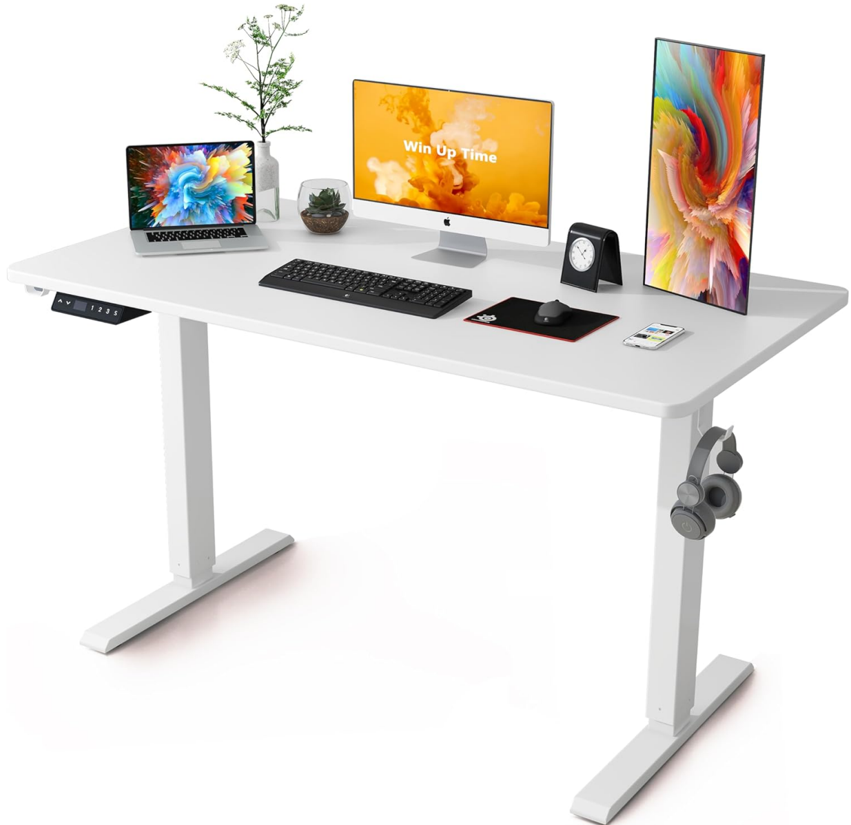
Image: The Win Up Time Electric Standing Desk, fully assembled and ready for use, showcasing its clean design and spacious tabletop.