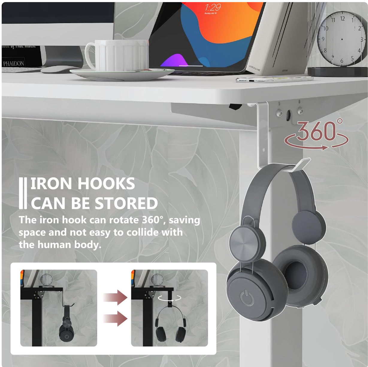
Image: Detail of the iron headphone hook, illustrating its ability to rotate 360 degrees for convenient storage and to prevent collisions.