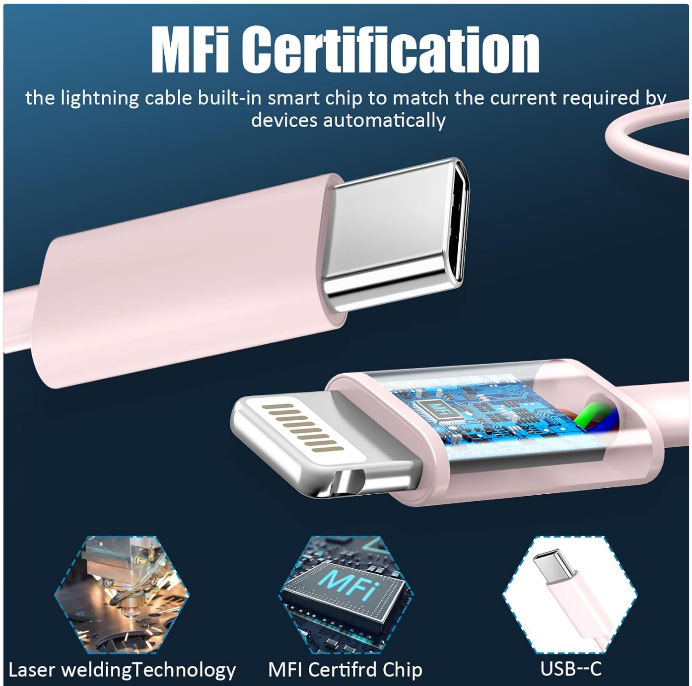
Image: Close-up of the MFi certified Lightning cable and USB C connector, highlighting the internal smart chip and laser welding technology for durability and compatibility.

The included 3FT Lightning Cable is MFi (Made for iPhone/iPad/iPod) certified, ensuring full compatibility and safe charging with your Apple devices. It features a smart chip for automatic current recognition, preventing error messages and ensuring stable power delivery.