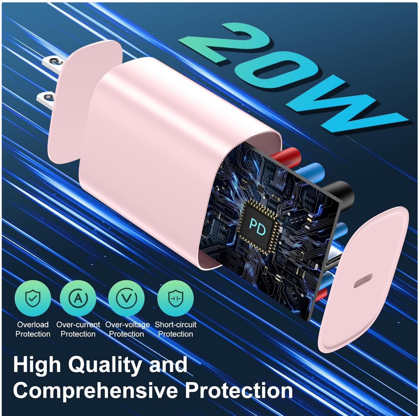
Image: An illustration of the DiHines 20W charger block's internal components, highlighting its multi-protection system against overload, over-current, over-voltage, and short-circuit.