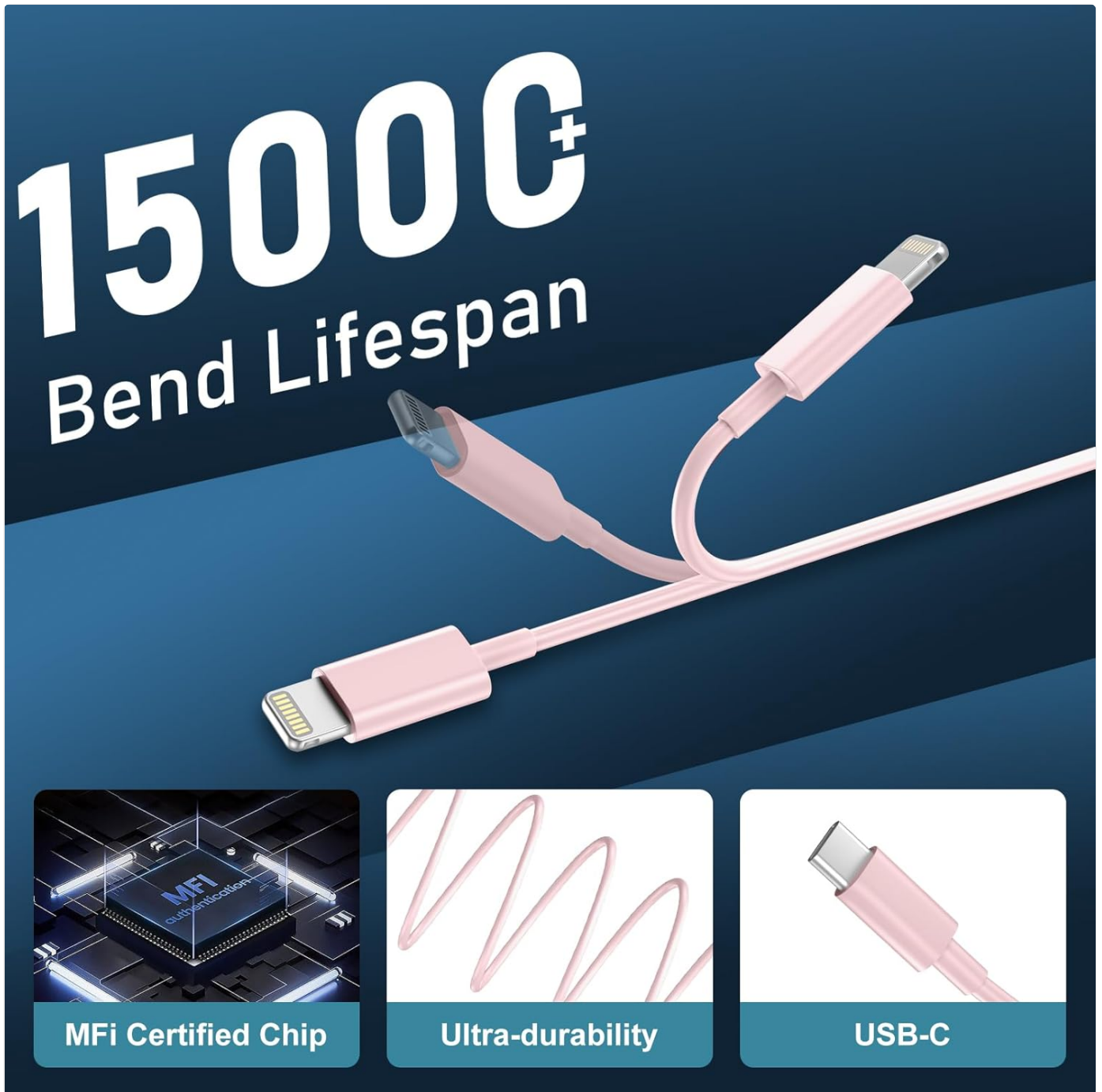
Image: Visual representation of the DiHines Lightning cable's durability, highlighting its 15000+ bend lifespan, MFi certified chip, ultra-durability, and USB-C connector.