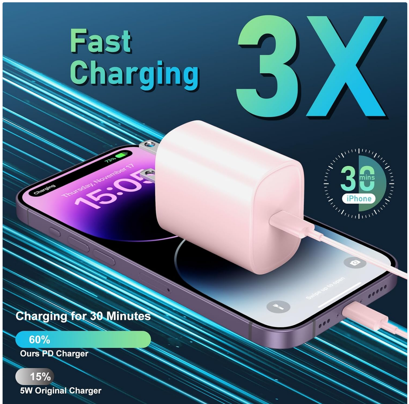
Image: A DiHines 20W USB C charger block with a 3FT Lightning cable connected, ready for use. The charger and cable are pink.