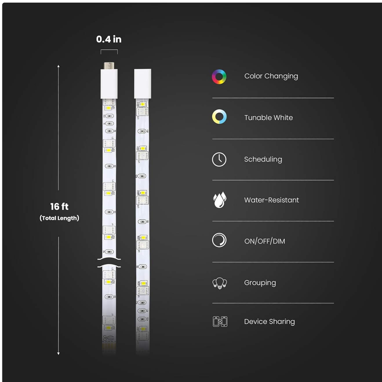
Image: Diagram illustrating the dimensions of the light strip and key features like color changing, scheduling, and water resistance.