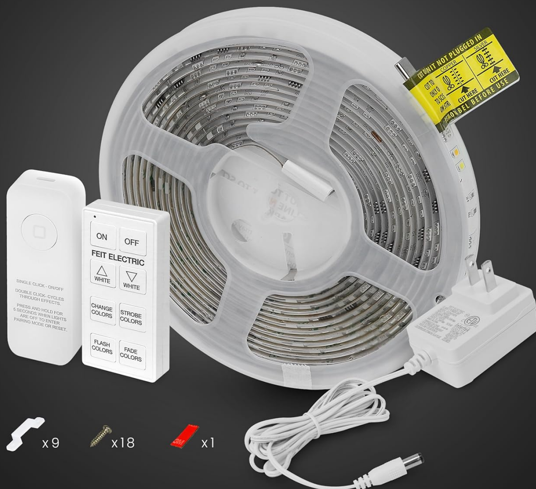
Image: All components included in the Feit Electric Smart Light Strip package.