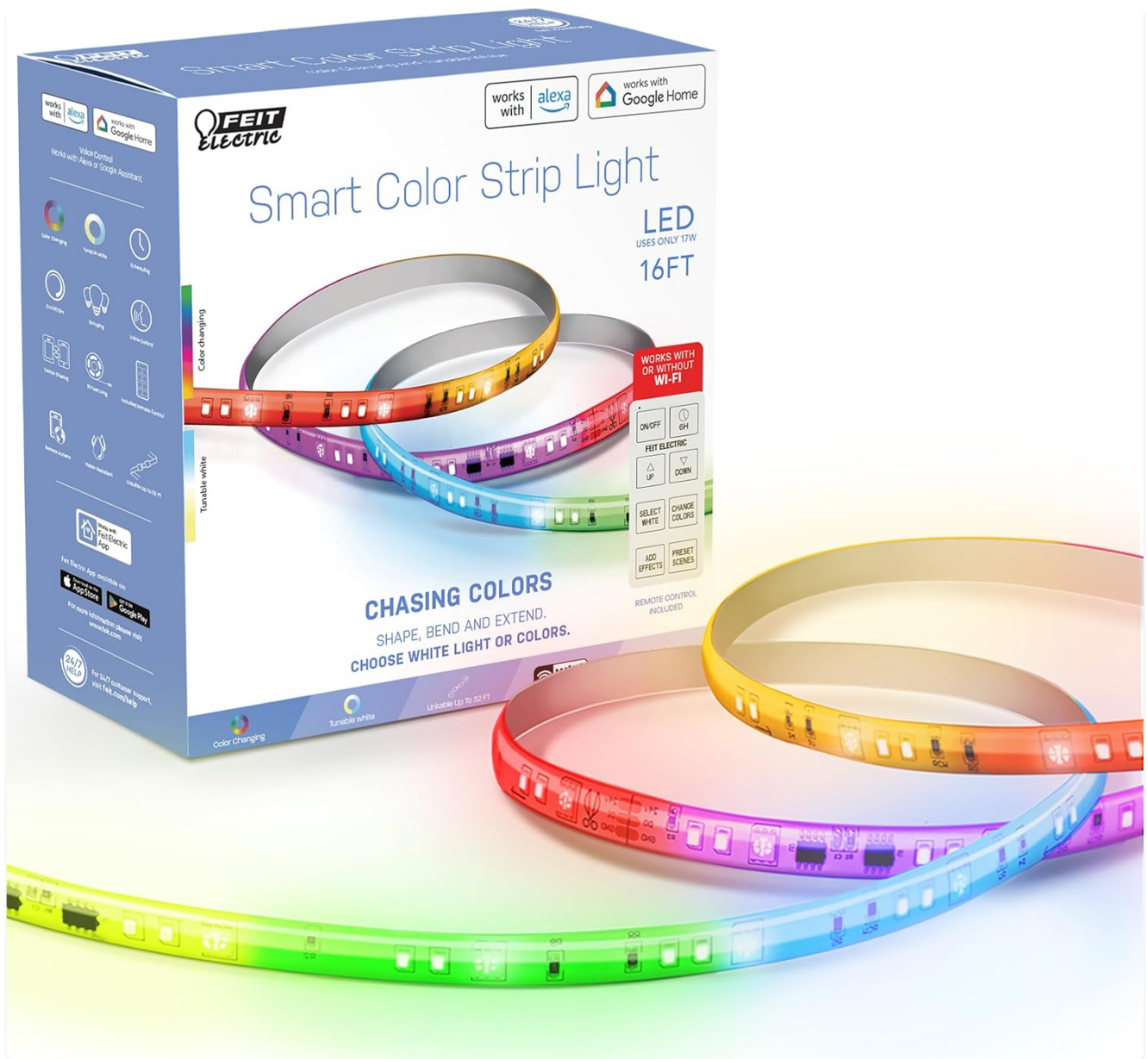
Image: Feit Electric Smart Light Strip, showcasing its packaging and the coiled light strip with various colors.