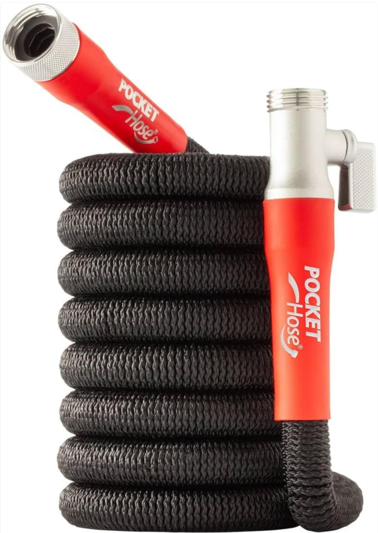
Image: The Pocket Hose Silver Bullet 2.0 in its compact, coiled state, with the included Turbo Shot Nozzle.