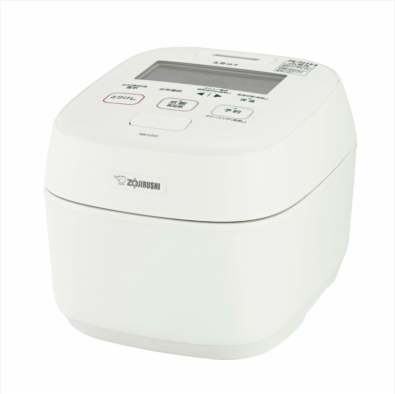
Figure 1: Zojirushi NW-UT07-WZ Flame Dance IH Rice Cooker (White model).

minimize areas where dirt can accumulate.