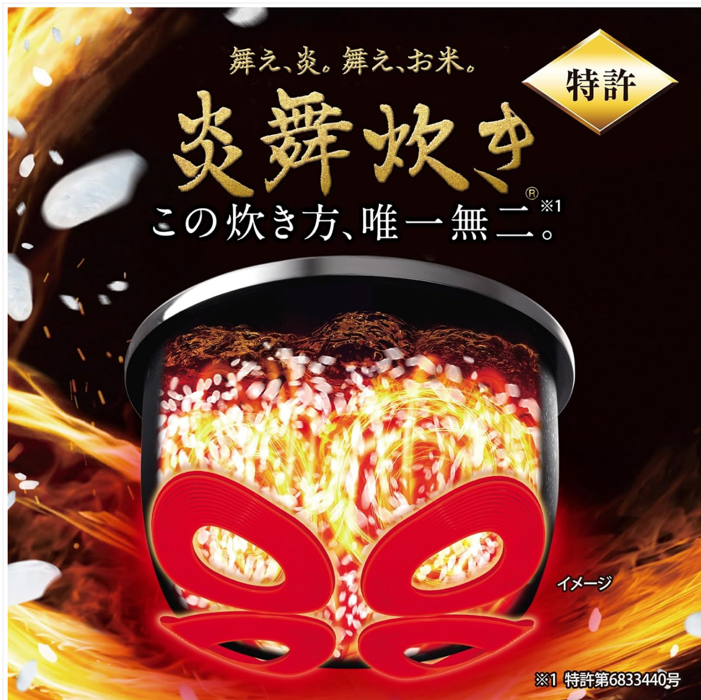
Figure 2: Illustration of the Flame Dance Cooking technology, showing concentrated heating zones within the inner pot.