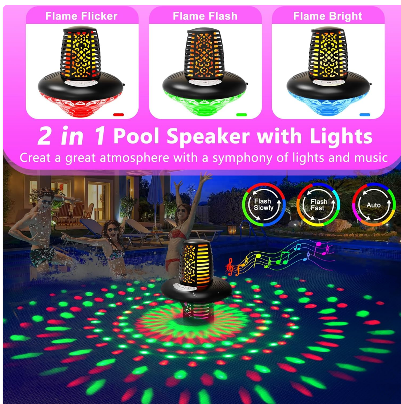
Figure 4: Visual representation of the speaker's flame light modes.