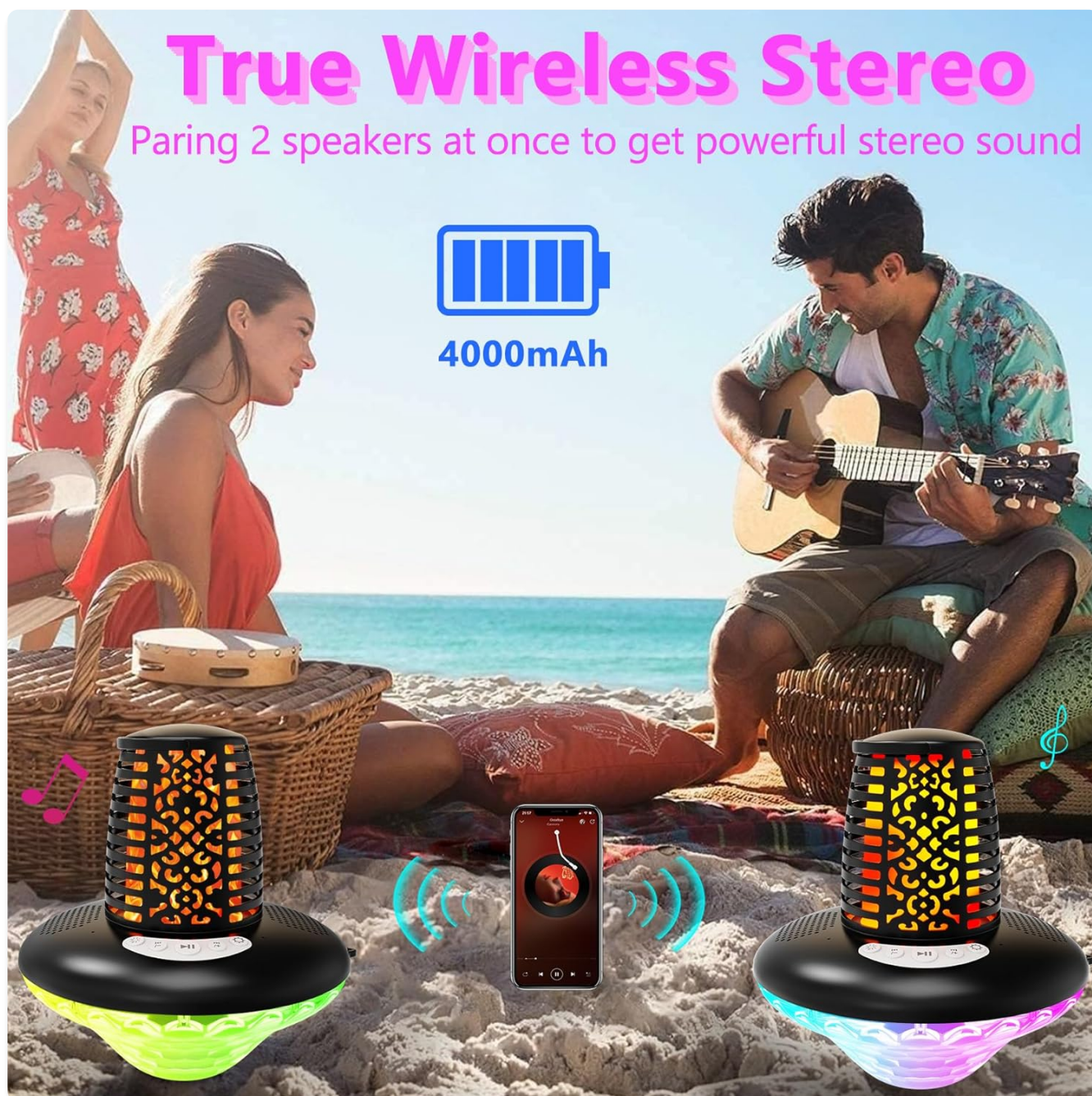
Figure 3: Two speakers connected via TWS technology for enhanced stereo audio.