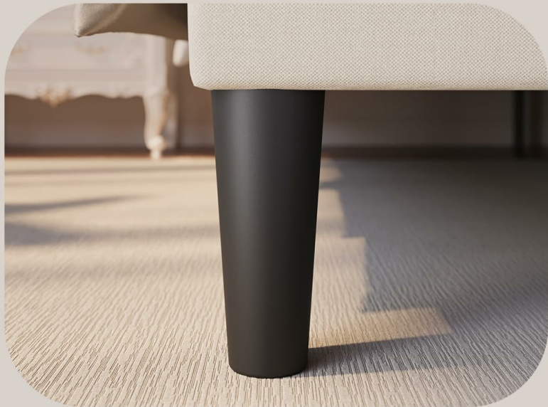
Image: View of the robust steel frame construction and the heavy-duty support feet, highlighting the bed frame's stability and durability.

Creates stability and ample under bed space