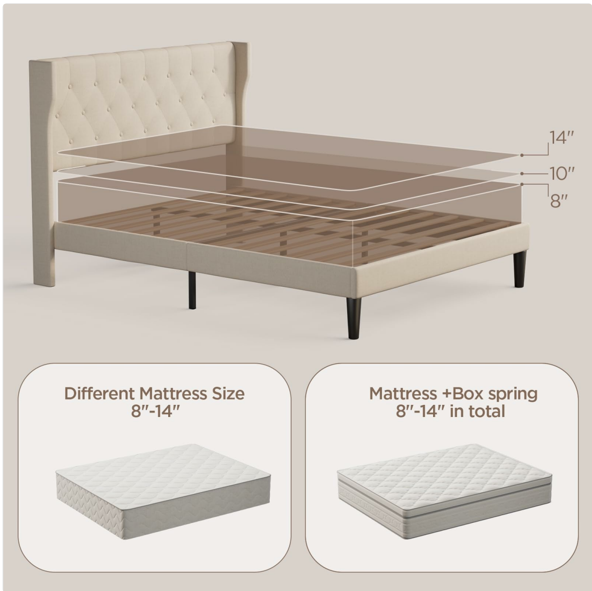
Image: An illustrative diagram indicating the recommended mattress thickness range of 8 to 14 inches for optimal fit and support on the bed frame.