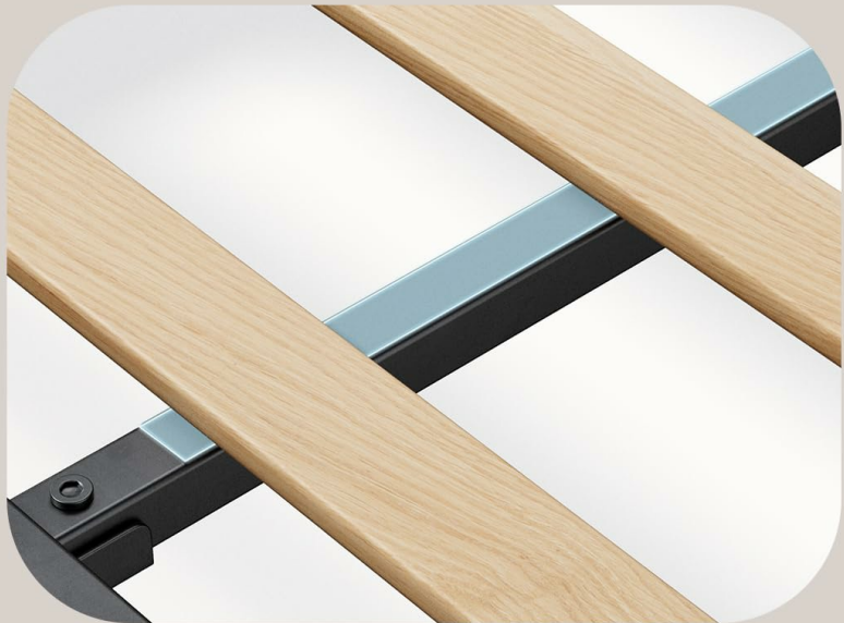
Image: Detail of the solid wooden slats, showing the integrated Velcro strips designed for secure and noise-free mattress support.