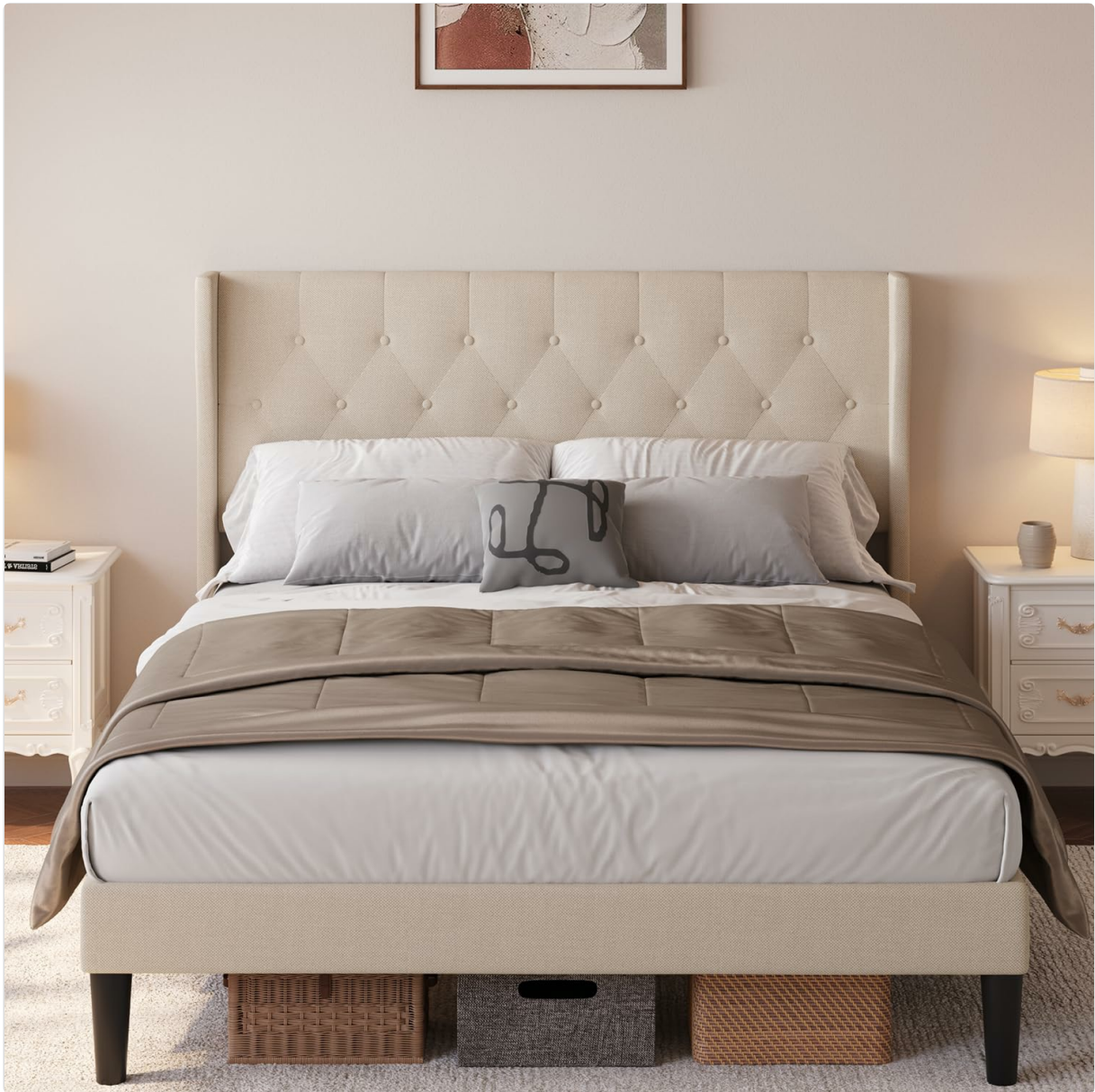
Image: The fully assembled Aiho Queen Size Upholstered Bed Frame with its beige headboard and mattress, showcasing its design in a bedroom environment.