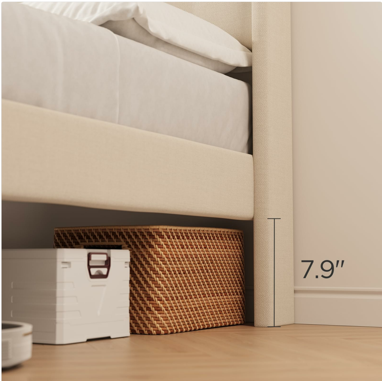
Image: A detailed shot showing the 7.9-inch clearance beneath the bed frame, demonstrating how storage bins can be utilized for organization.