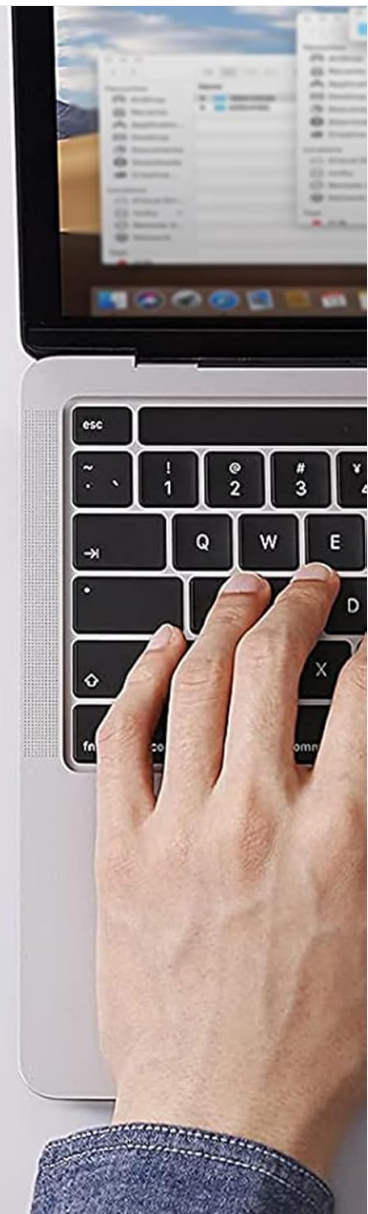
Figure 4.1: Various USB power sources compatible with the fan, including power adaptors, power banks, car chargers, and laptops.