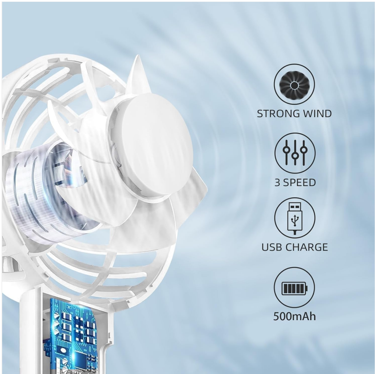
Figure 3.2: Diagram illustrating key features such as strong wind output, three-speed control, USB charging capability, and 500mAh battery capacity.