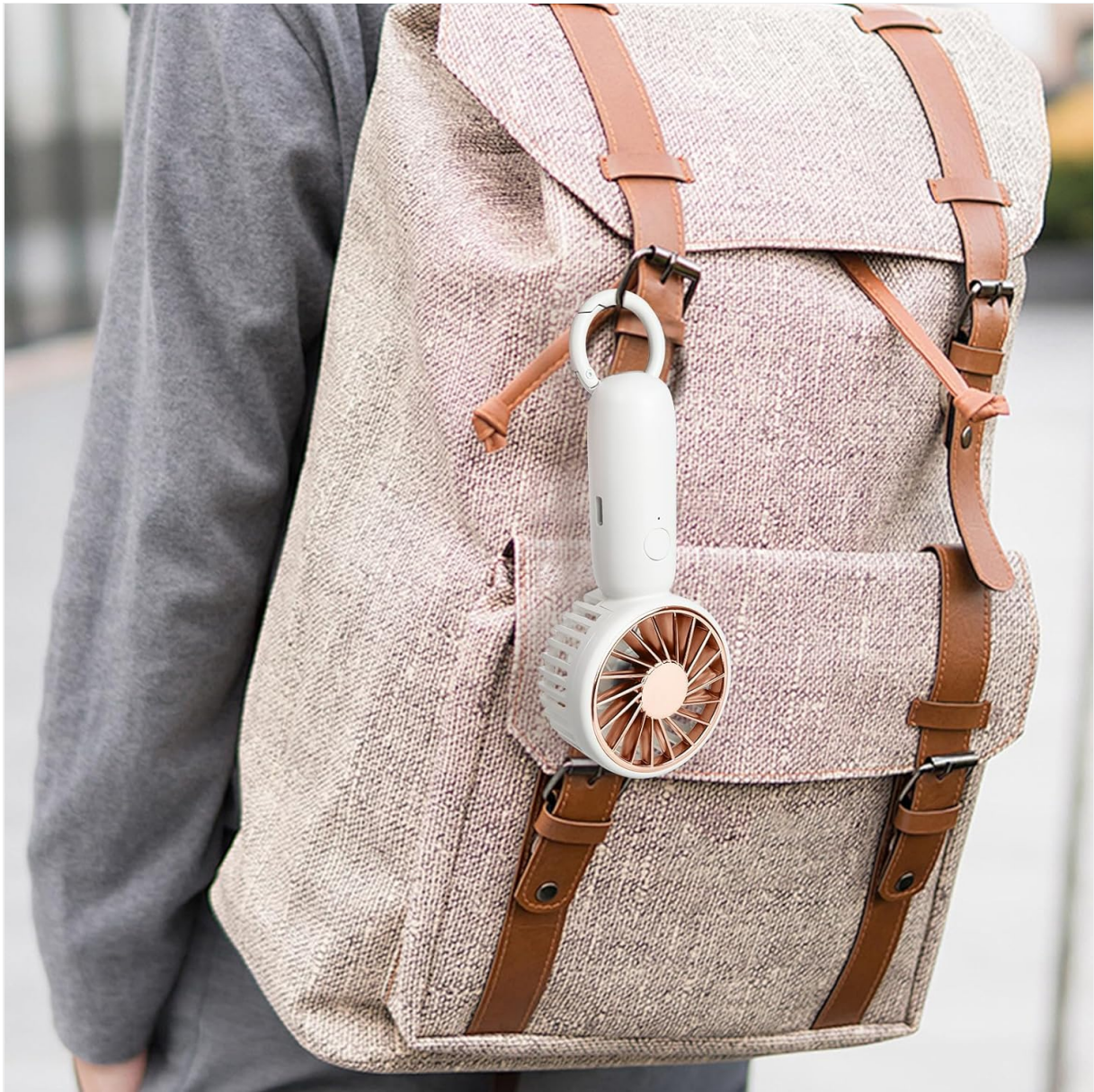
Figure 5.1: The fan's integrated buckle allows it to be easily attached to bags or other items for convenient carrying.