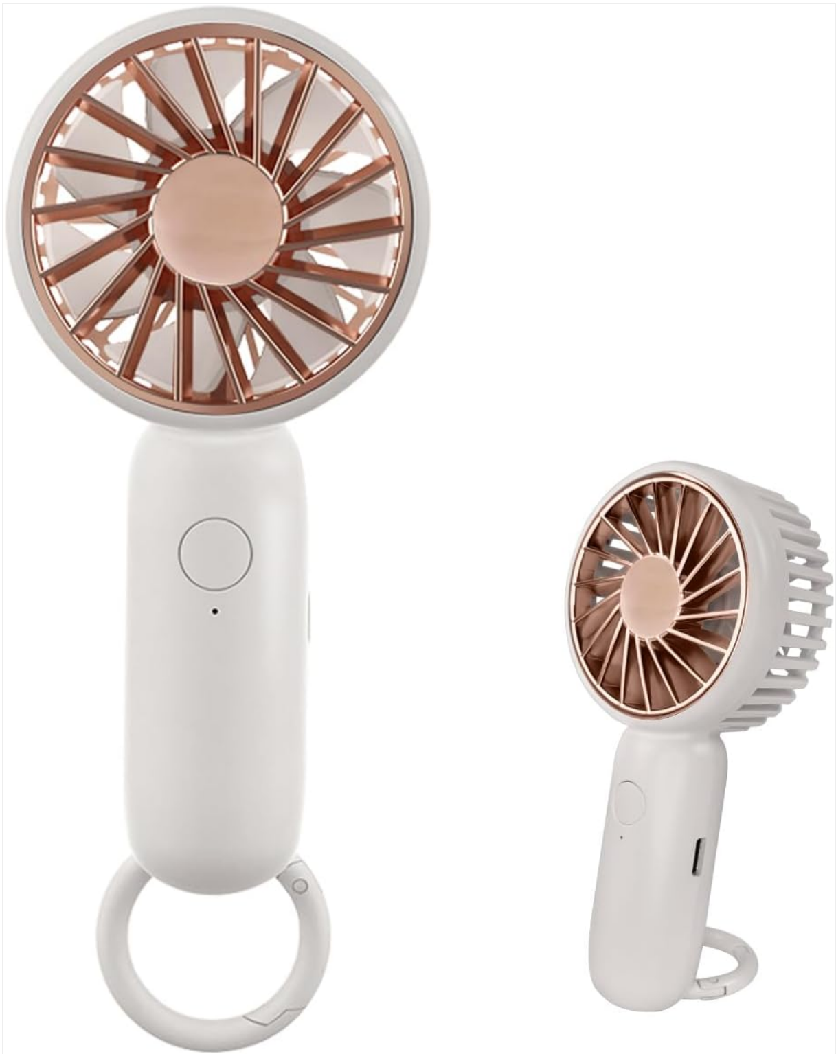
Figure 3.1: Front and side view of the Jsdojin Mini Handheld Fan, showcasing its compact design and integrated buckle.