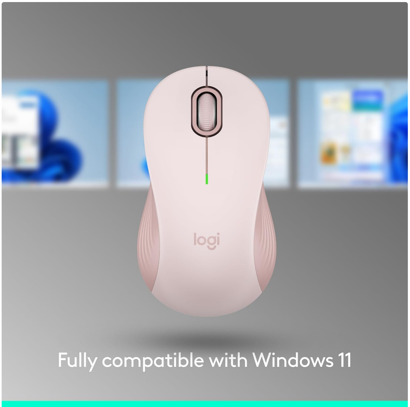
Image: The Logitech Signature M550 mouse displayed with a message confirming its full compatibility with Windows 11.