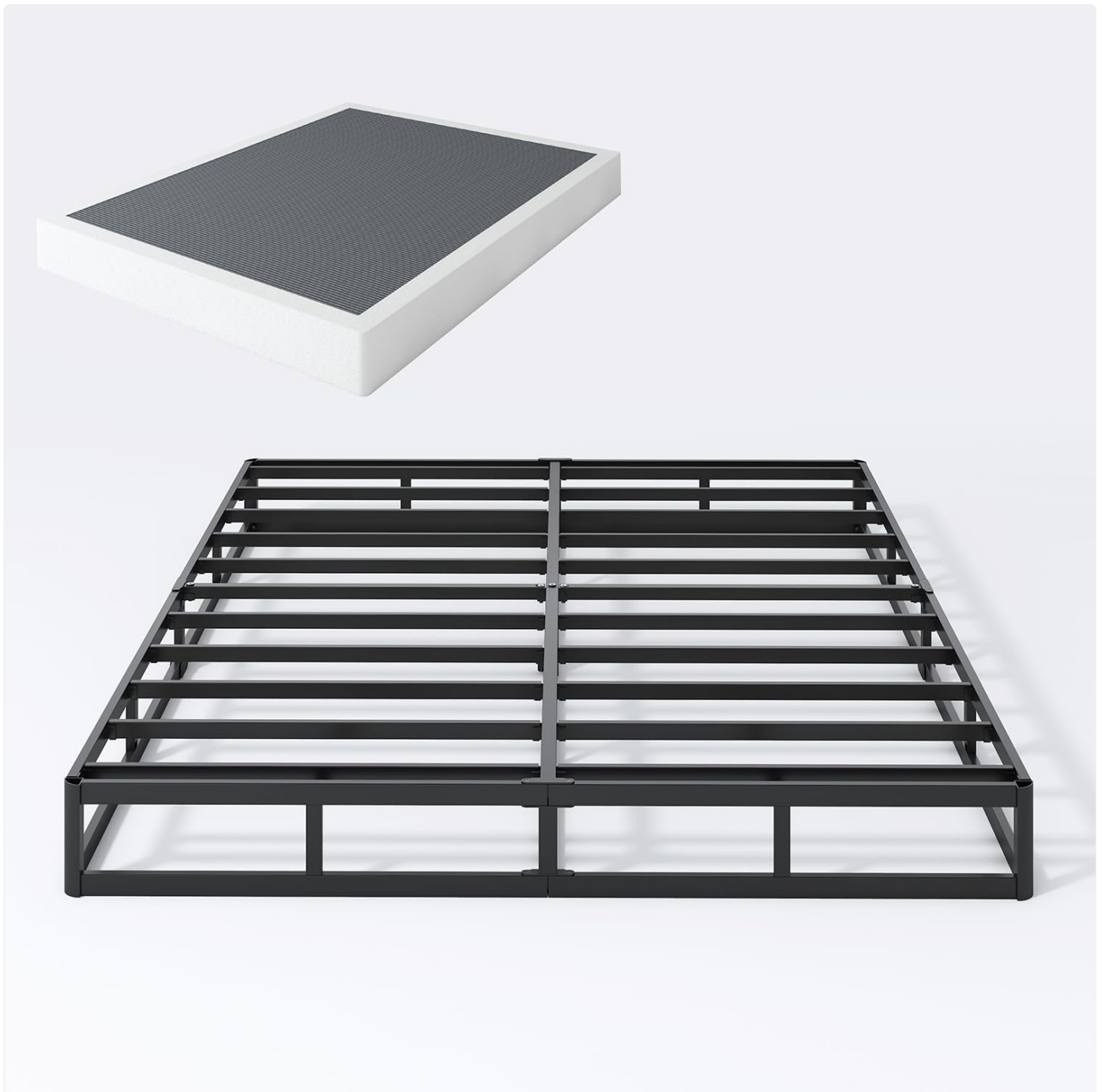
Image: The SHLAND Queen Box Spring, illustrating both the metal frame and the fabric cover.