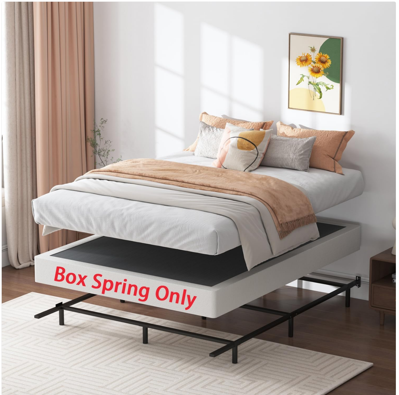
Image: The box spring positioned on a bed frame, supporting a mattress.