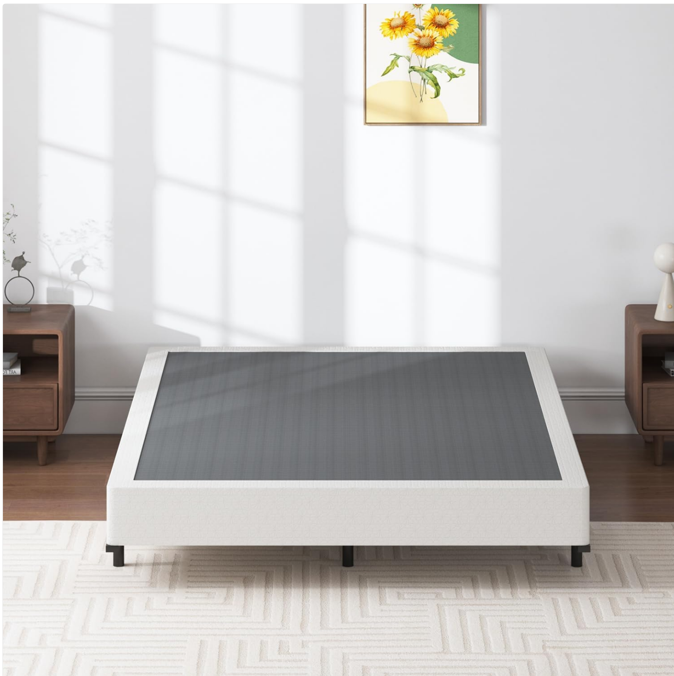
Image: The assembled box spring with its fabric cover.