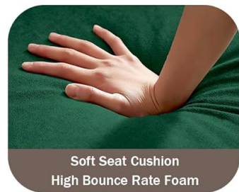
Soft Seat Cushion High Bounce Rate Foam

Image: Sofa Features. This image details additional features like the convenient storage bag, unique armrest design for comfort, and soft seat cushions made with high bounce rate foam for superior comfort.