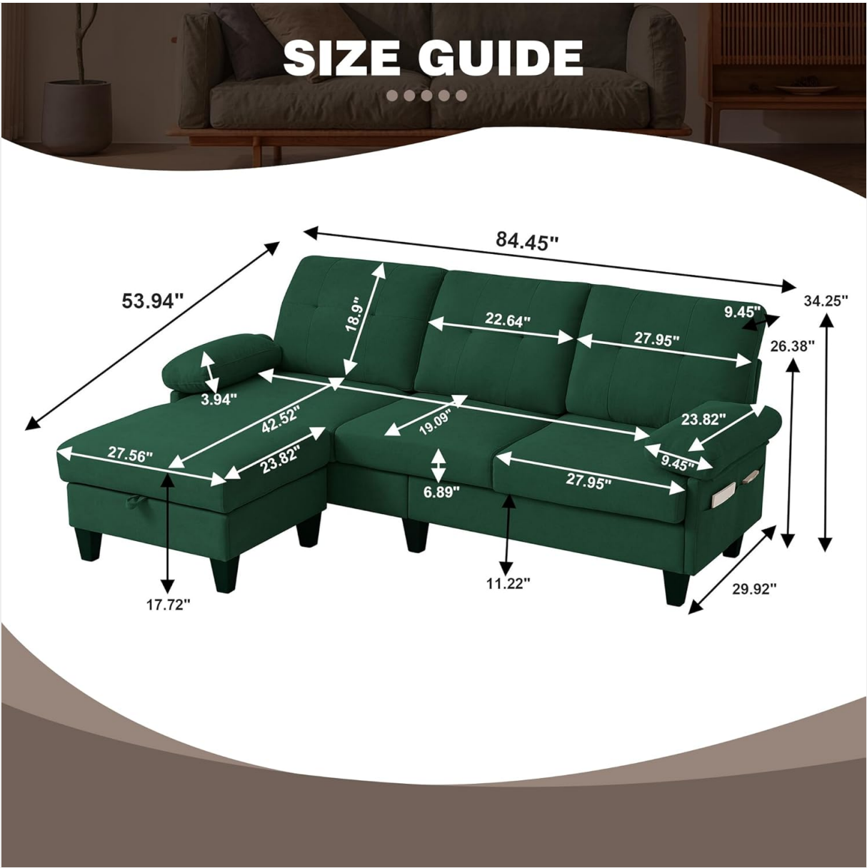
Image: Sofa Dimensions and Size Guide. This image illustrates the overall dimensions of the sectional sofa, including seat depth, width, and height, to help with placement and understanding its scale.