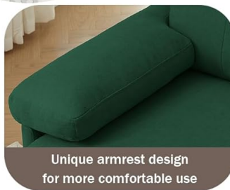
Unique armrest design for more comfortable use