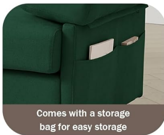
Comes with a storage bag for easy storage