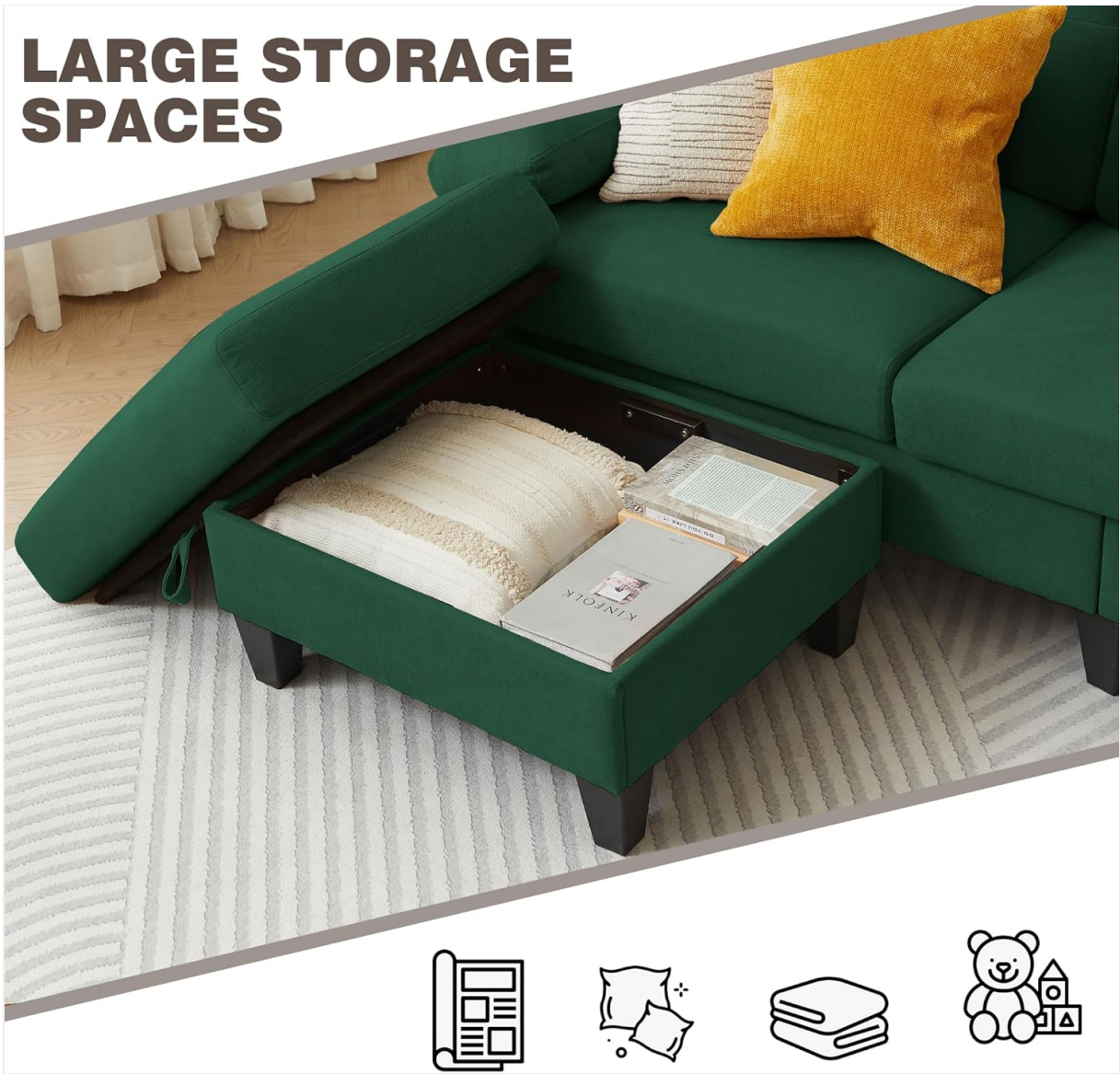
Image: Large Storage Spaces. This image illustrates the spacious storage compartment within the ottoman, perfect for decluttering your living area by storing various items like books, clothes, or toys.