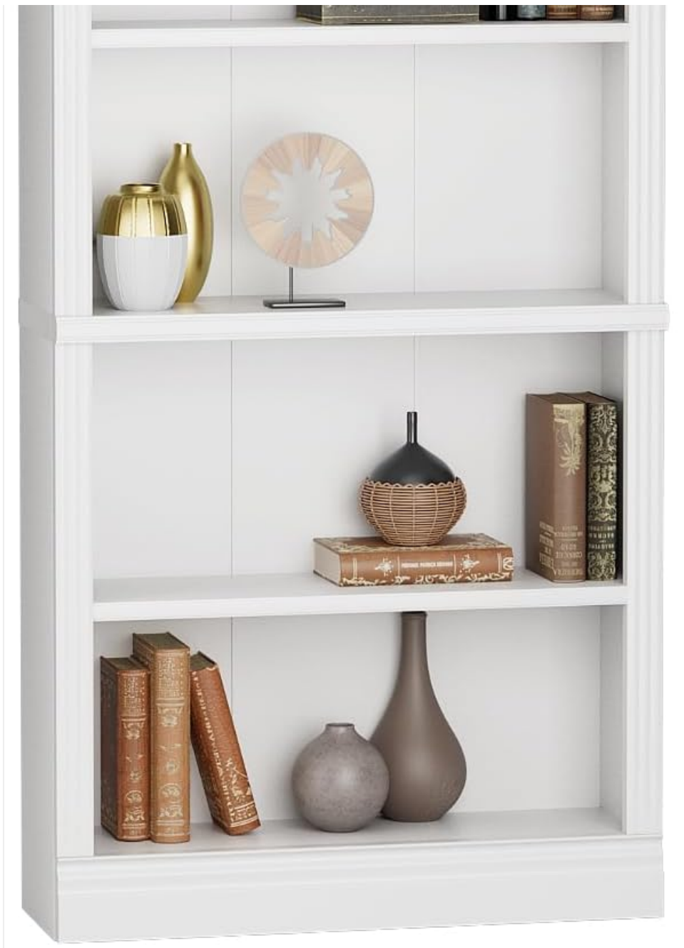
Figure 5.3: A detailed view of the shelves, illustrating how various items can be arranged for both utility and visual appeal.