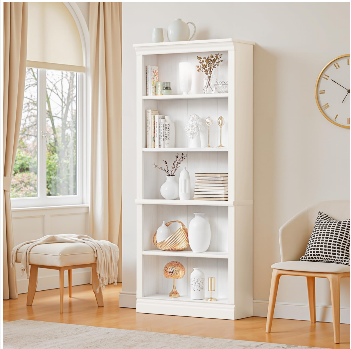
Figure 5.1: The bookshelf integrated into a living space, demonstrating its capacity for both books and decorative elements.