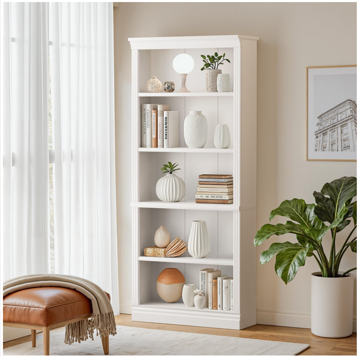
Figure 1.1: The Furniwell 5-Tier Bookshelf, Model BC0025-2, showcasing its design and storage capacity in a typical home environment.