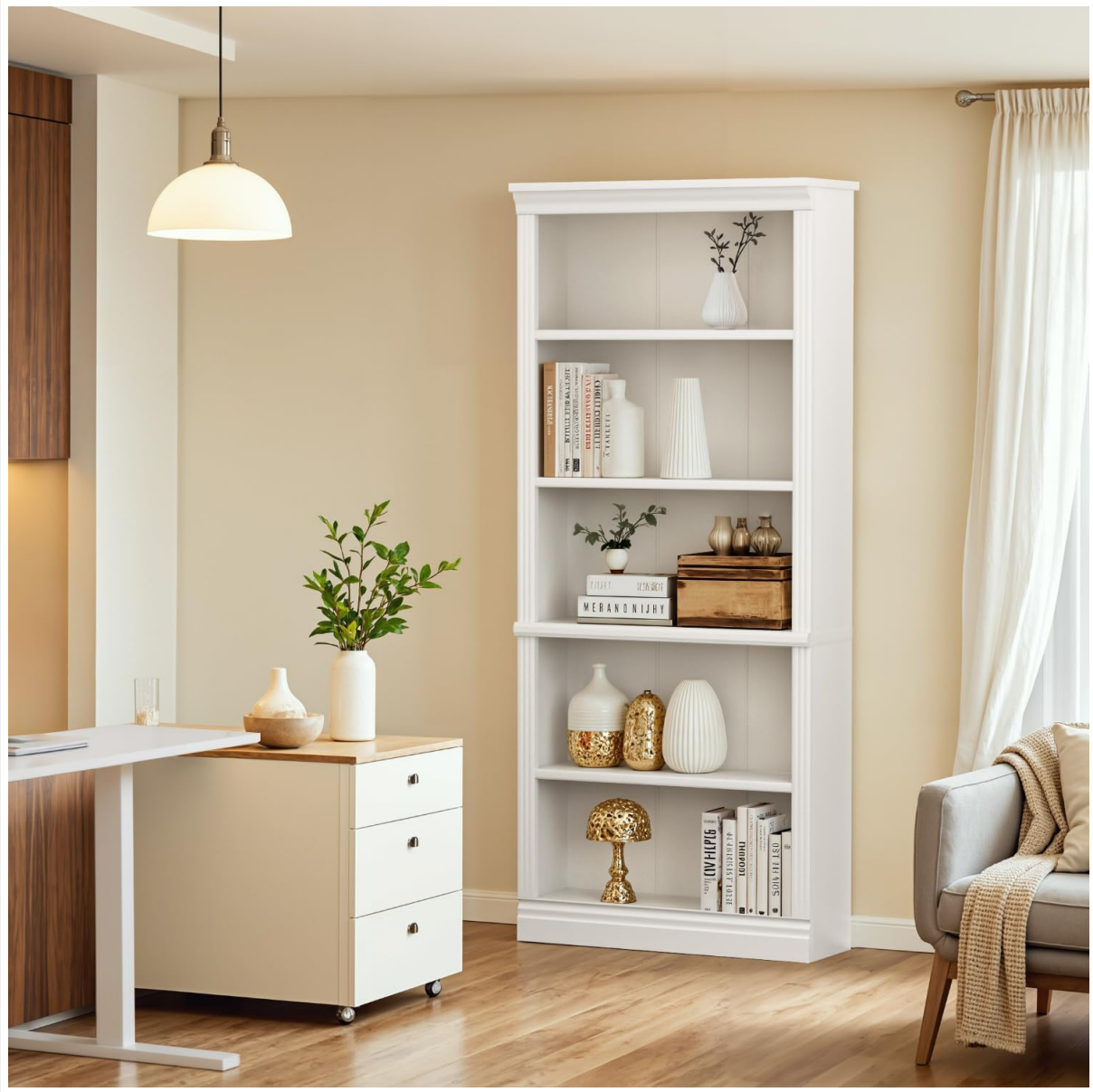
Figure 5.2: The bookshelf providing organized storage in an office setting, highlighting its functional versatility.