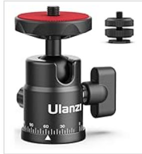
Figure 5.1: Wide compatibility with action cameras and mobile phones.

The phone clamp width is adjustable from 57-90mm. The maximum load capacity for the mount is 800g.