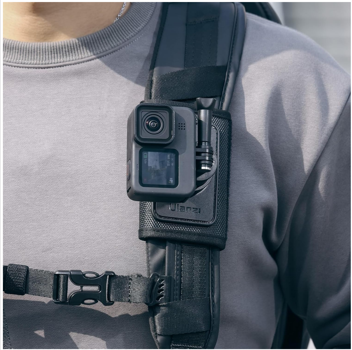
Figure 3.2: Magnetic quick-release system for attachment and detachment.