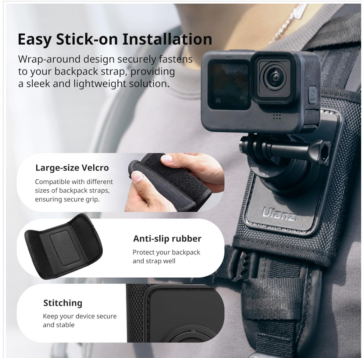
Figure 3.1: Easy stick-on installation with large Velcro and anti-slip features.