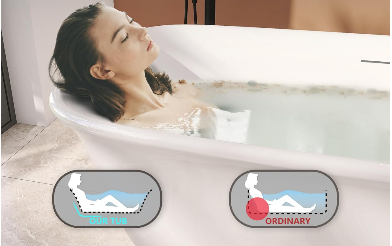
Image: A visual representation of the bathtub's ergonomic design, demonstrating how it comfortably supports the body for a relaxing soak.

ERGONOMIC AND COMFY DLIVERING UNPARALLELED BATHING FITS YOUR BODY, LUXURY SOAK