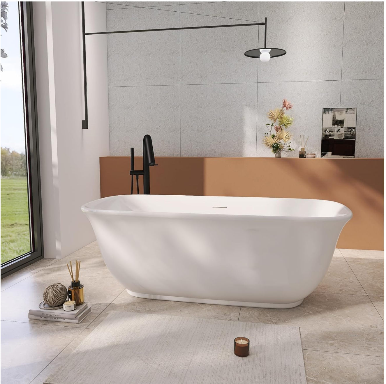
Image: The ADECAB 59-inch freestanding bathtub, showcasing its elegant design and gloss white finish within a contemporary bathroom environment.