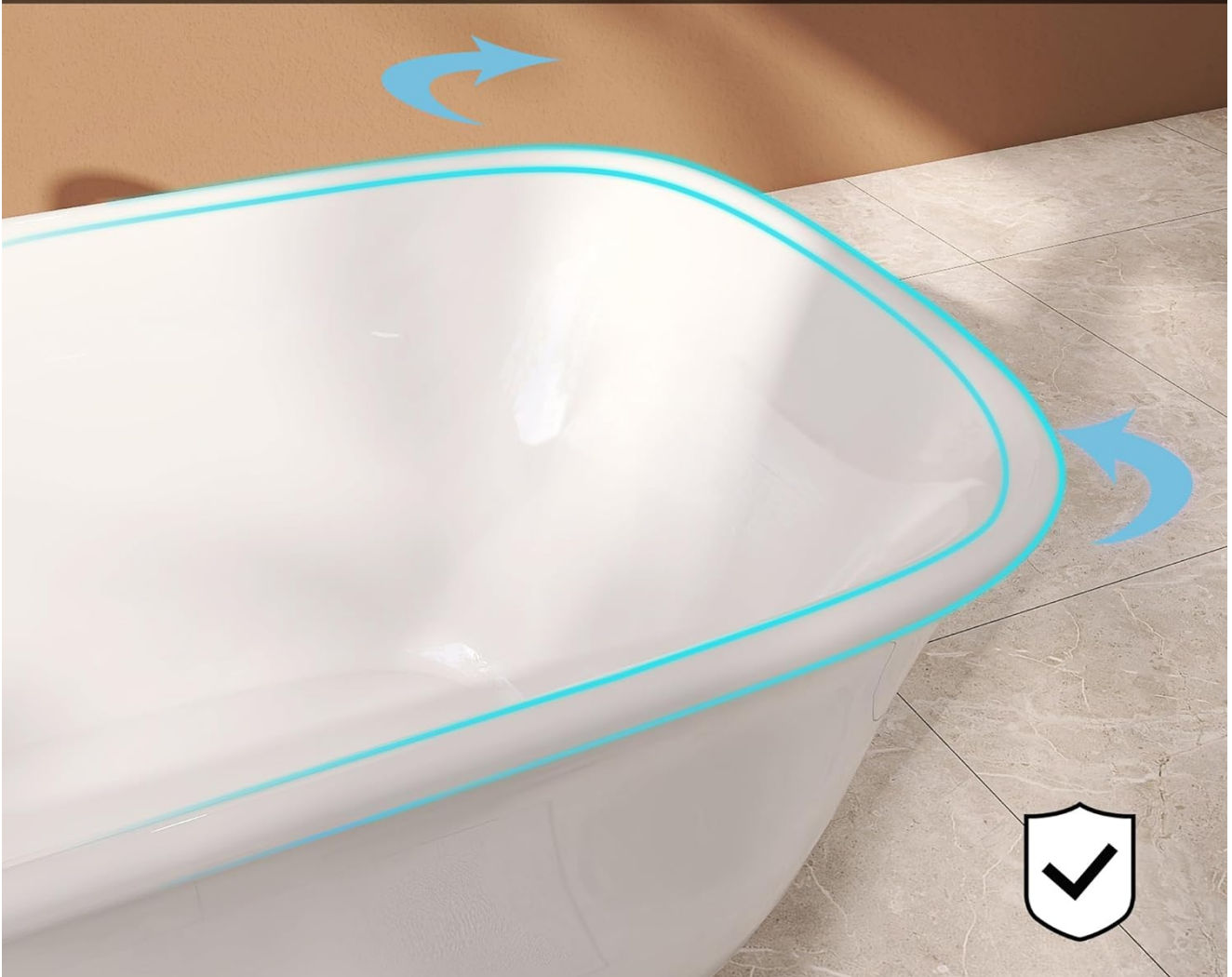
Image: A diagram illustrating the bathtub's advanced thermal insulation, which helps retain water temperature for a longer, more enjoyable bath.