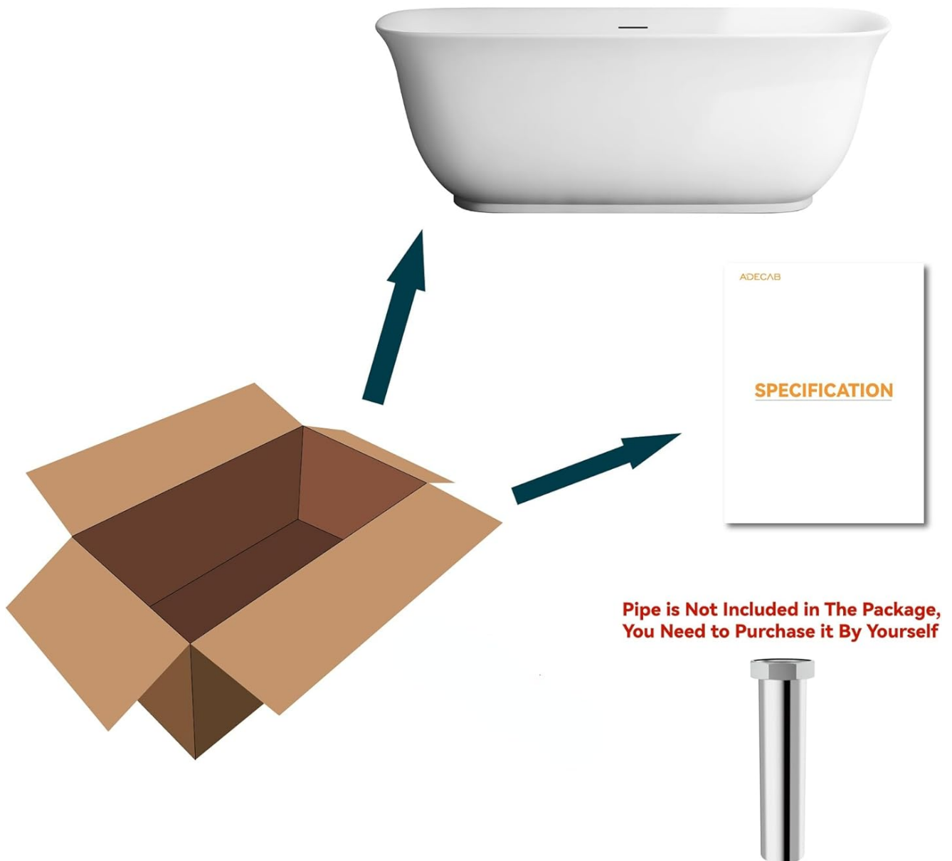
Image: An illustration detailing the contents of the product package, including the bathtub, specification manual, and highlighting that the connecting pipe is not supplied.