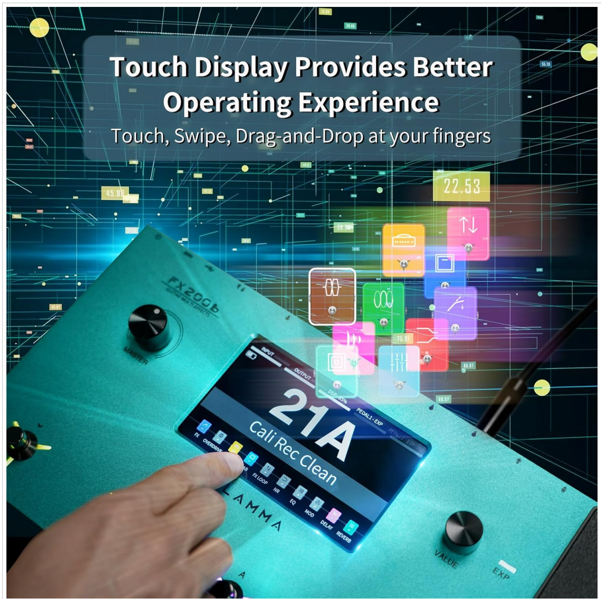
Image: A hand interacting with the touchscreen of the FLAMMA FX200, demonstrating the touch, swipe, drag-and-drop functionality for managing effects.