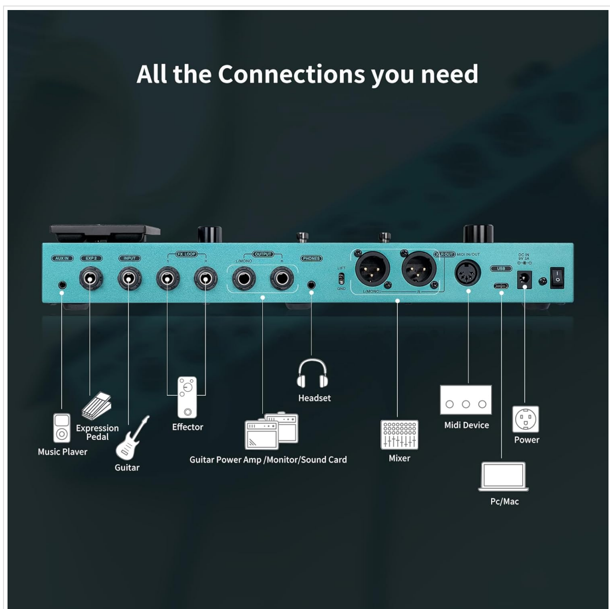
Image: Rear view of the FLAMMA FX200 showing all input and output jacks, including Aux In, EXP 2, Input, FX Loop (Send/Return), Output (L/Mono, R), Phones, XLR Out (L/Mono, R), MIDI In/Out, USB-C, DC In, and Power Switch.

The FX200 offers extensive input/output options to integrate into various setups. Refer to the diagram below for common connection scenarios.