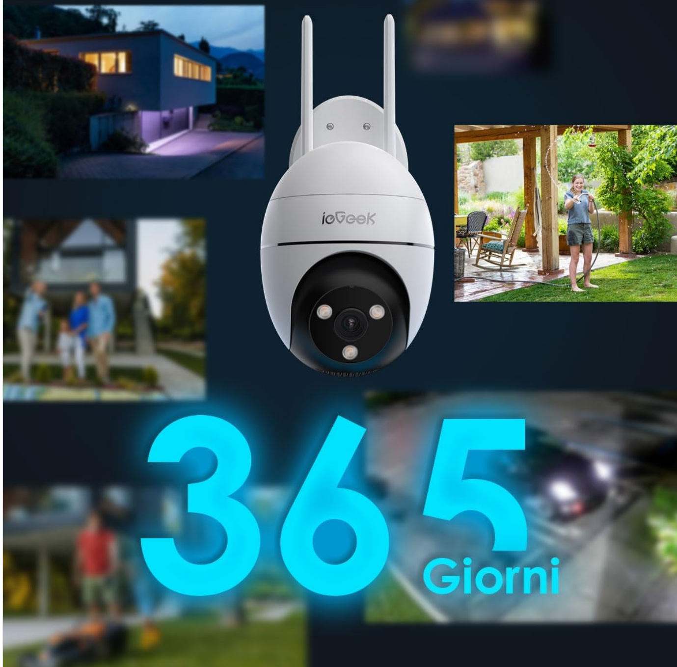
Figure 4.5: The camera supports 24/7 continuous recording, ensuring constant surveillance.