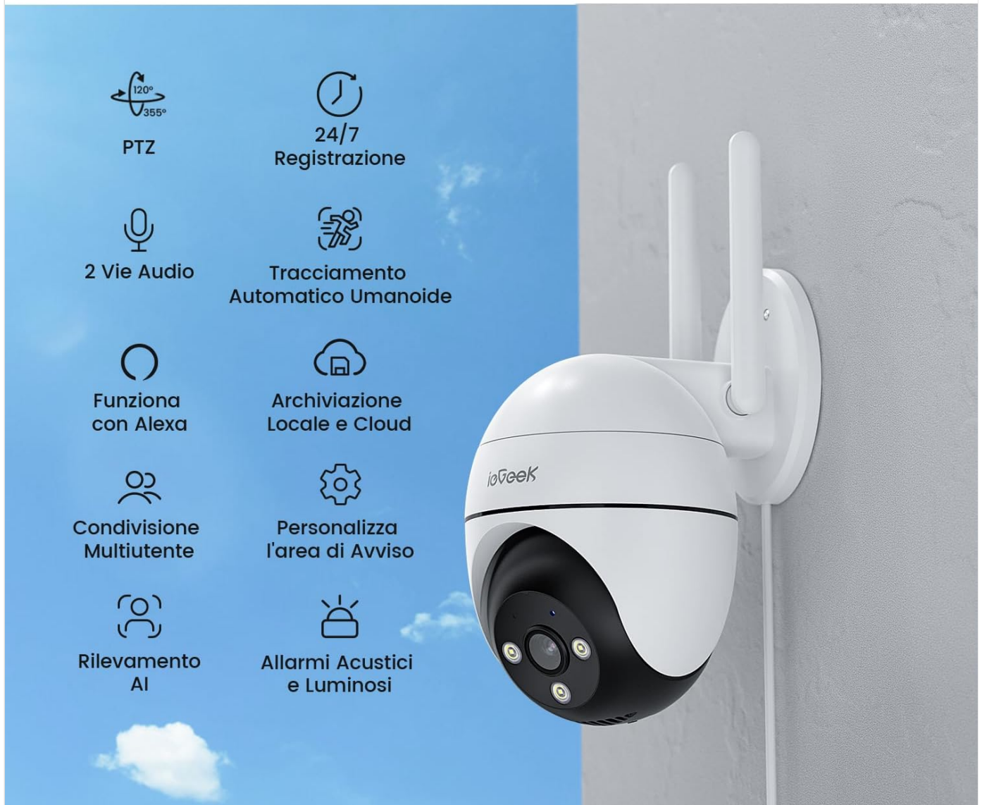
Figure 2.2: Overview of iGeek 5MP Camera Features including PTZ, 24/7 recording, 2-way audio, humanoid tracking, Alexa compatibility, local and cloud storage, multi-user sharing, customizable alert areas, AI detection, and acoustic/light alarms.

5 MP FHD per un Ottimo Monitoraggio dei Dettagli