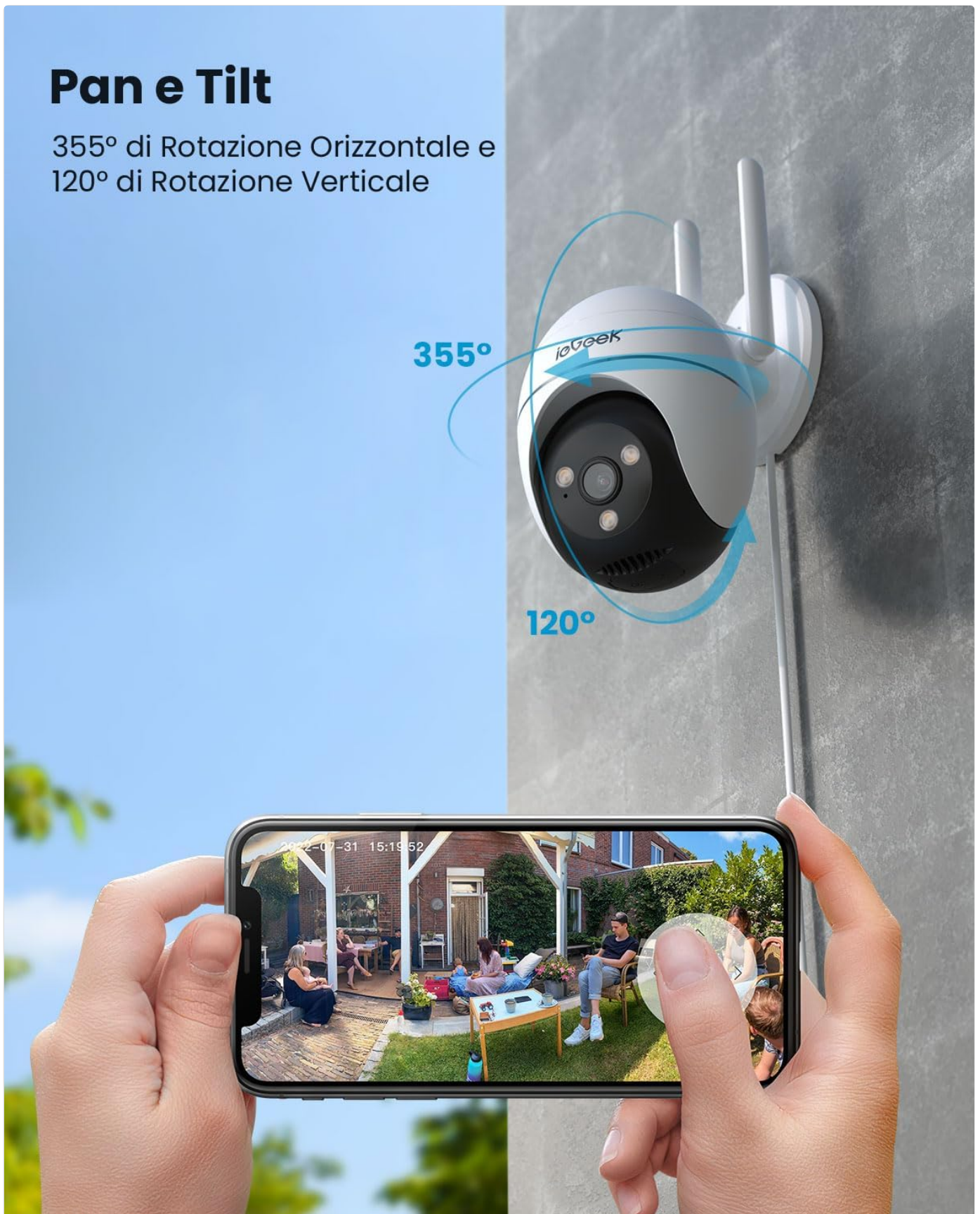
Figure 4.1: Control the camera's 355° horizontal and 120° vertical rotation directly from your smartphone app.

355° di Rotazione Orizzontale e 120° di Rotazione Verticale