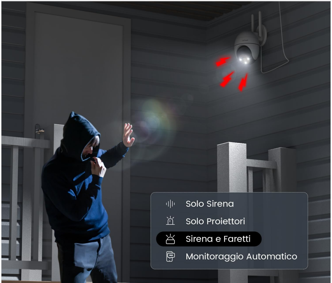
Figure 4.2: Select from silent, spotlight only, siren only, or both siren and spotlight alarm modes to suit your security needs.