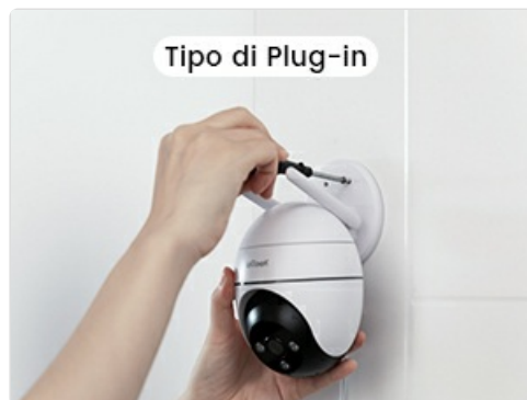
Figure 3.1: Connecting the power adapter to the camera.