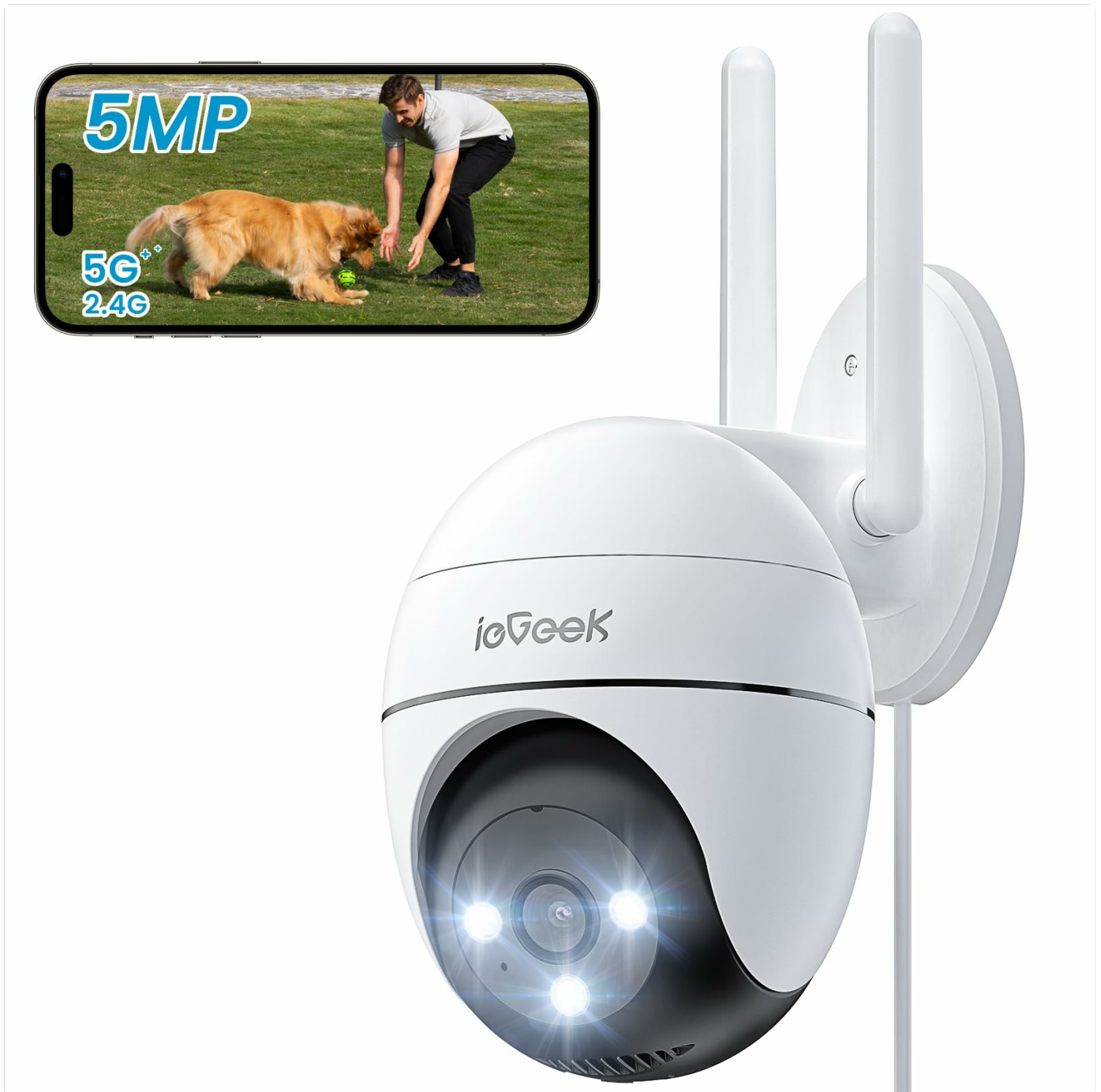
Figure 2.1: ieGeek 5MP Outdoor Wi-Fi Security Camera (Model ZS-GQ4)