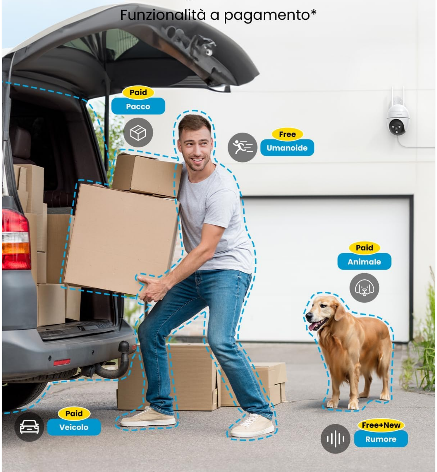
Figure 4.4: AI smart monitoring can differentiate between various detection types such as people, animals, packages, and vehicles (some features may require a subscription).