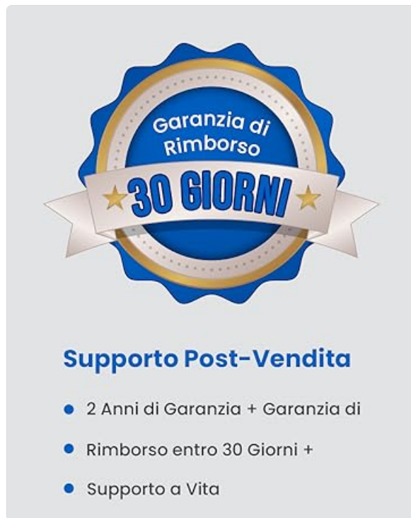
Figure 8.1: ieGeek offers a 2-year warranty and a 30-day money-back guarantee, along with lifetime support.