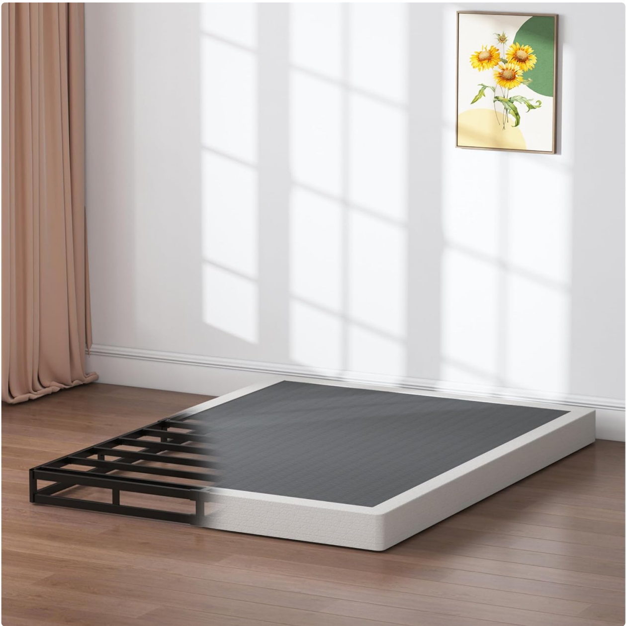
Image: The fully assembled SHLAND King 5 Inch Box Spring with its fabric cover, positioned on a bed frame.