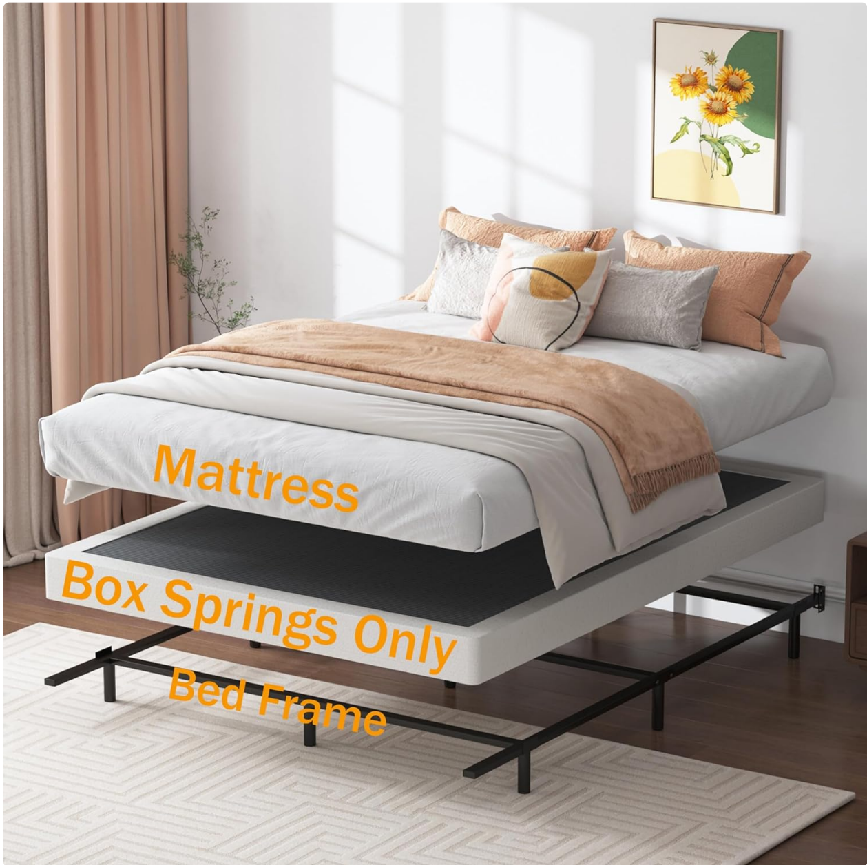
Image: The metal frame of the SHLAND King 5 Inch Box Spring prior to the installation of the fabric cover.

5. Position the Box Spring: Carefully place the assembled box spring onto your bed frame.