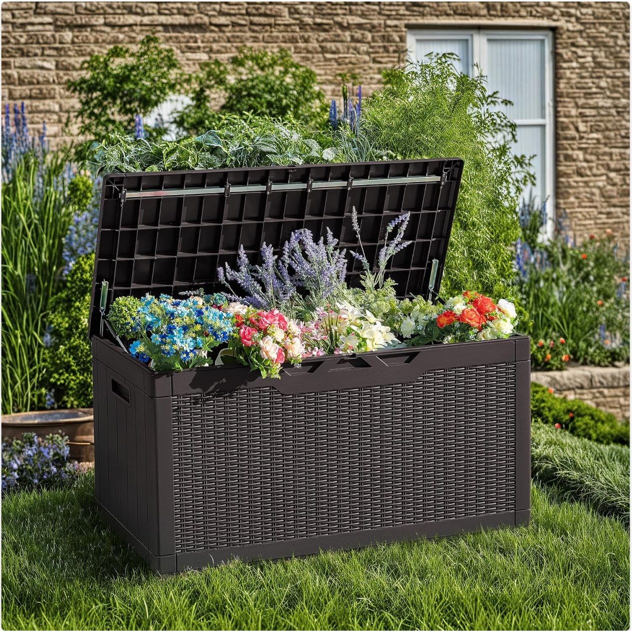
Image: Devoko 97 Gallon Deck Box in a garden setting, showcasing its capacity and aesthetic appeal.