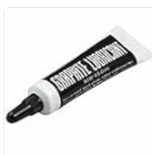
Image: A small tube of graphite lubricant, recommended for maintaining lock mechanisms.

Proper maintenance can extend the life of your lock and key. Periodically, you may apply a small amount of graphite lubricant to the lock cylinder if you notice stiffness or difficulty turning the key.