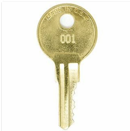
Image: A close-up of the EasyKeys replacement key, showing its brass construction and the key code.

The EasyKeys replacement key is a custom-cut brass key designed for file cabinets, desks, and cubicles equipped with Sentry Safe or Schwab 313 series locks. It is also compatible with locks from manufacturers such as CompX Fort and Meilink that use the 313 code. This key is engineered for durability and a precise fit, ensuring reliable operation for securing your storage units.