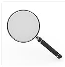
Image: A magnifying glass, useful for closely inspecting the keyway or lock code for any obstructions or details.