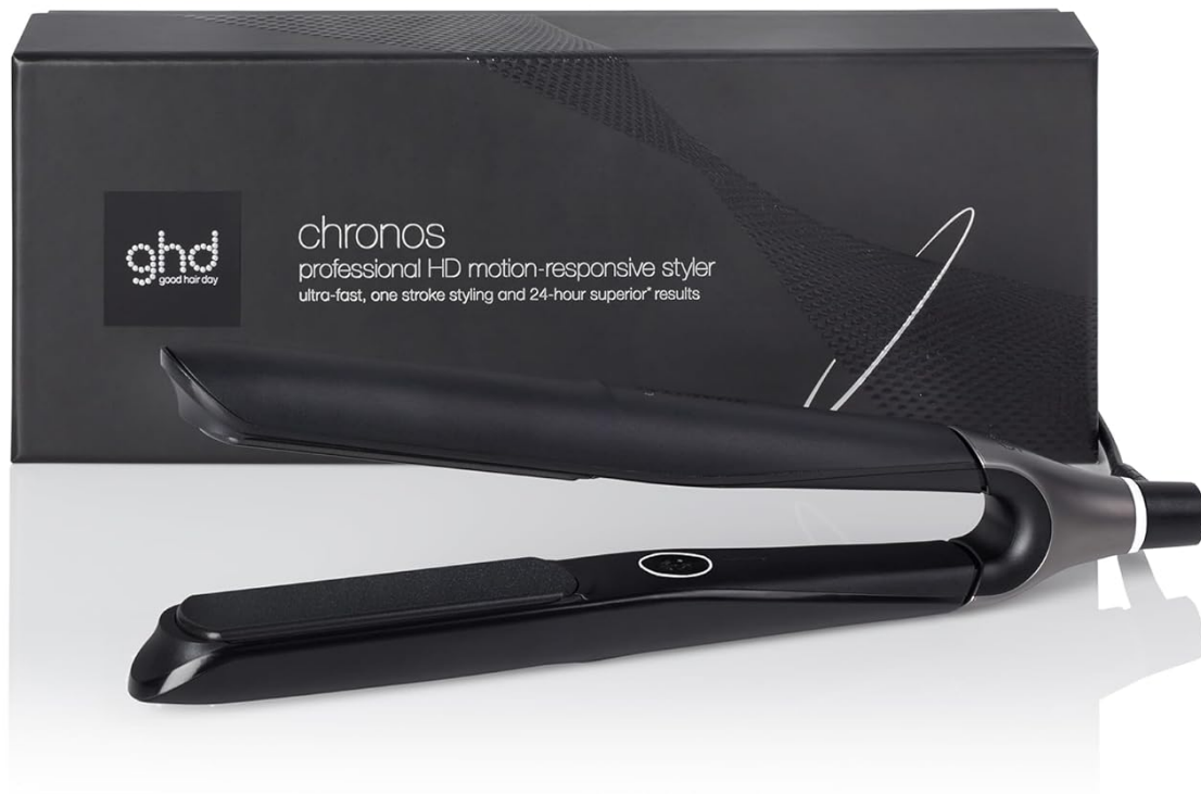
The ghd Chronos Styler, presented alongside its sleek black packaging.