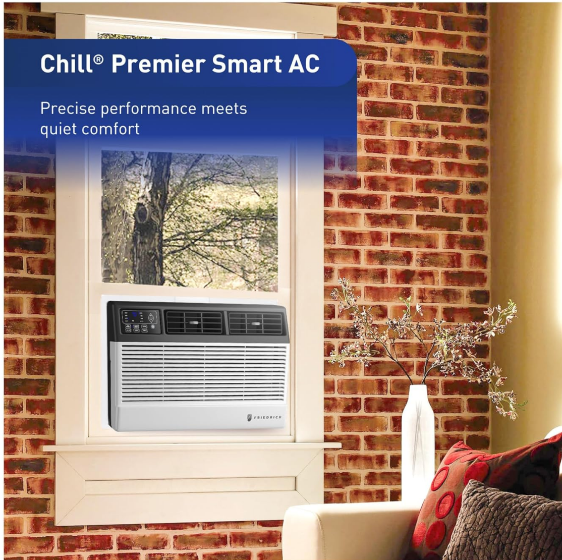
Image 6.1: The Friedrich Chill Premier Smart AC unit in a living space, emphasizing its quiet and precise performance.