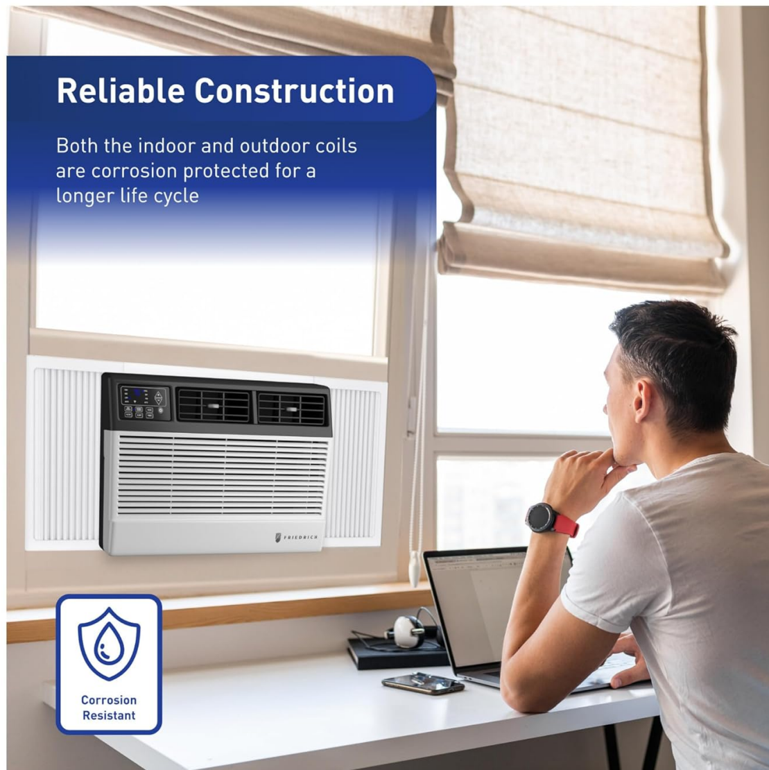
Image 7.2: The unit's reliable construction, with corrosion-protected coils for a longer lifespan.