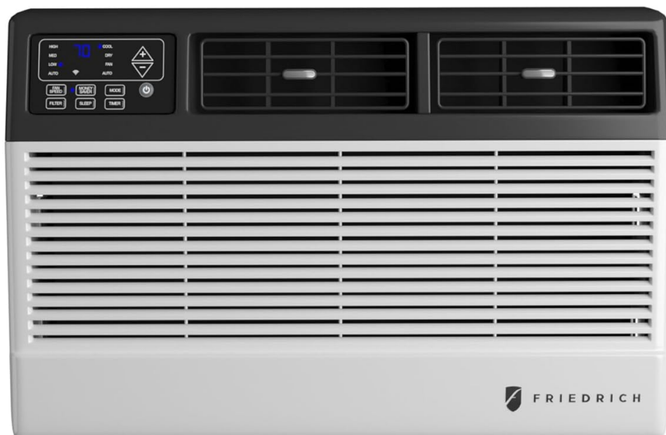
Image 1.1: Front view of the Friedrich Chill Premier 12,000 BTU window air conditioner, showing the control panel and air vents.