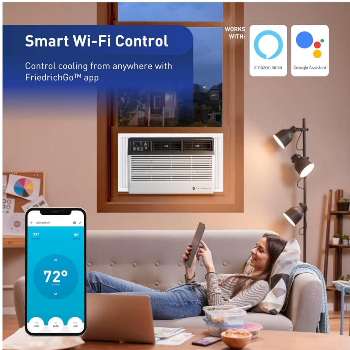
Image 5.1: Demonstrating Smart Wi-Fi Control with the Friedrich Go App, compatible with Amazon Alexa and Google Assistant.

The Friedrich Chill Premier features integrated Wi-Fi control. Download the Friedrich Go App on your smartphone to control the unit remotely. The unit is also compatible with voice commands via Amazon Alexa and Google Assistant.