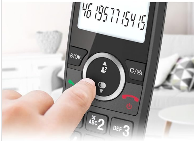
10 last number redial