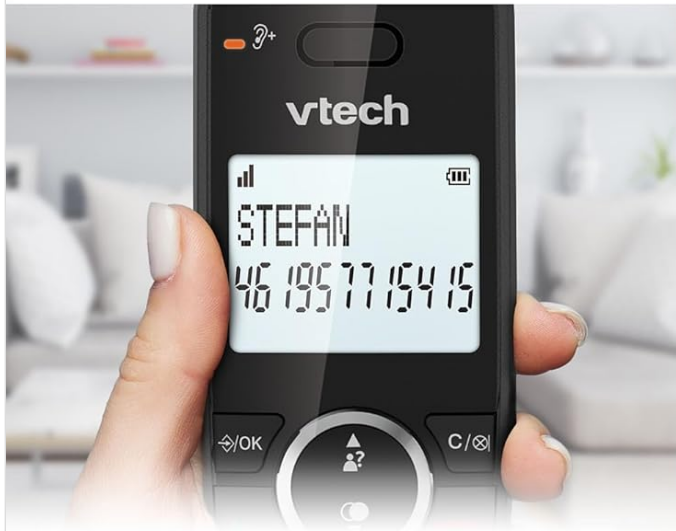
100 name and number phonebook