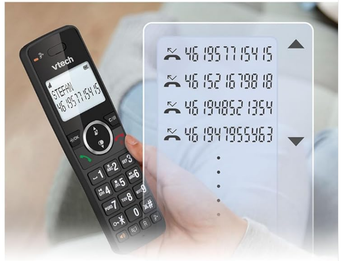
Calling numbers displayed with 20 number calls lists