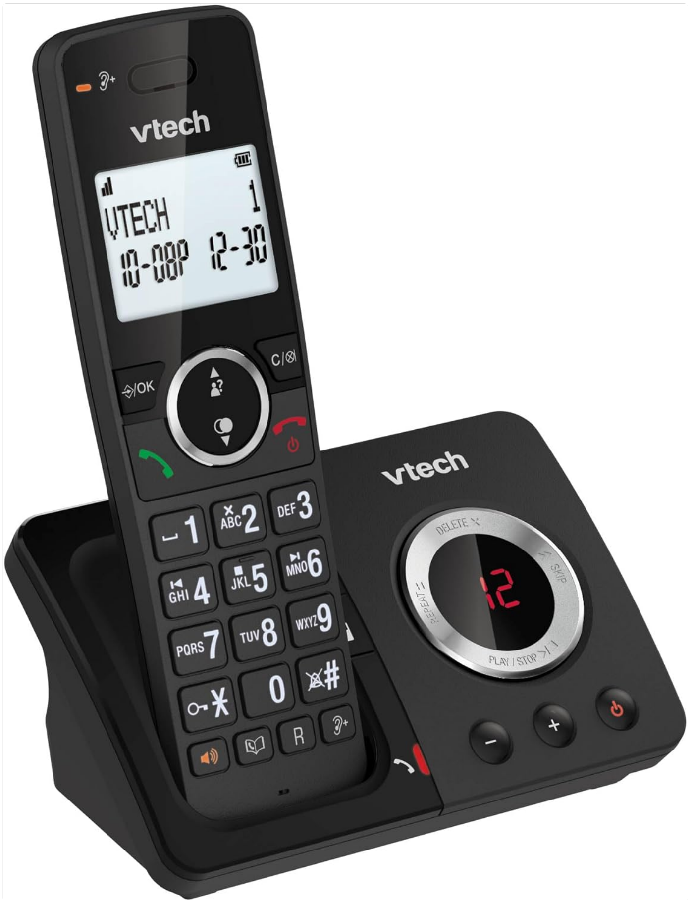
The VTech ES2050 DECT Cordless Phone with its base unit, showcasing the handset's backlit display and keypad, and the base unit's answering machine controls.