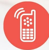
High quality handsfree speakerphone

Depiction of the VTech ES2050's easy one-touch features, including Mute/Alarm, adjustable ring volume and melodies, and a high-quality handsfree speakerphone.