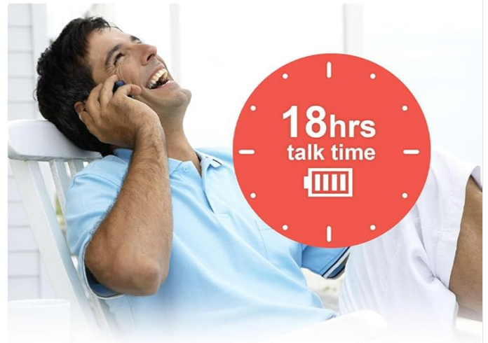
Up to 18 hours talk time / 250 hours standby time

A composite image illustrating key features: 100 name and number phonebook, calling numbers displayed with 20 call list records, 10 last number redial, and up to 18 hours talk time / 250 hours standby time.