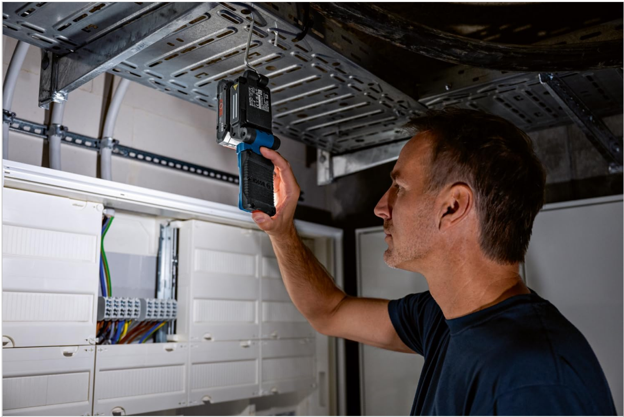
Image 5.2: A user demonstrating the versatility of the GLI 18V-800 by hanging it from an overhead structure using its integrated swivel metal hook, providing illumination for a task below.