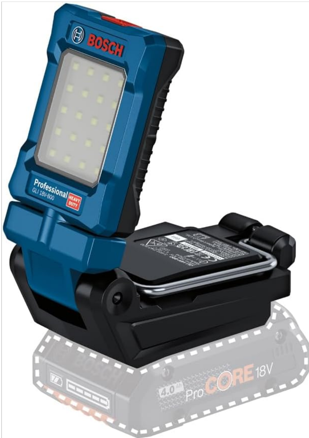
Image 1.1: The Bosch Professional GLI 18V-800 Cordless Light in its compact, folded state. The light head is folded over the battery compartment, which is designed to accept a Bosch Professional 18V battery (battery not included).