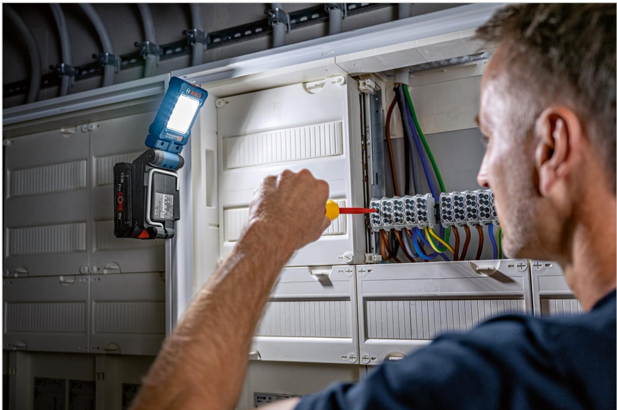
Image 5.3: The GLI 18V-800 positioned to illuminate an electrical panel, showcasing its ability to provide focused light for detailed work. The light is standing on its battery base.