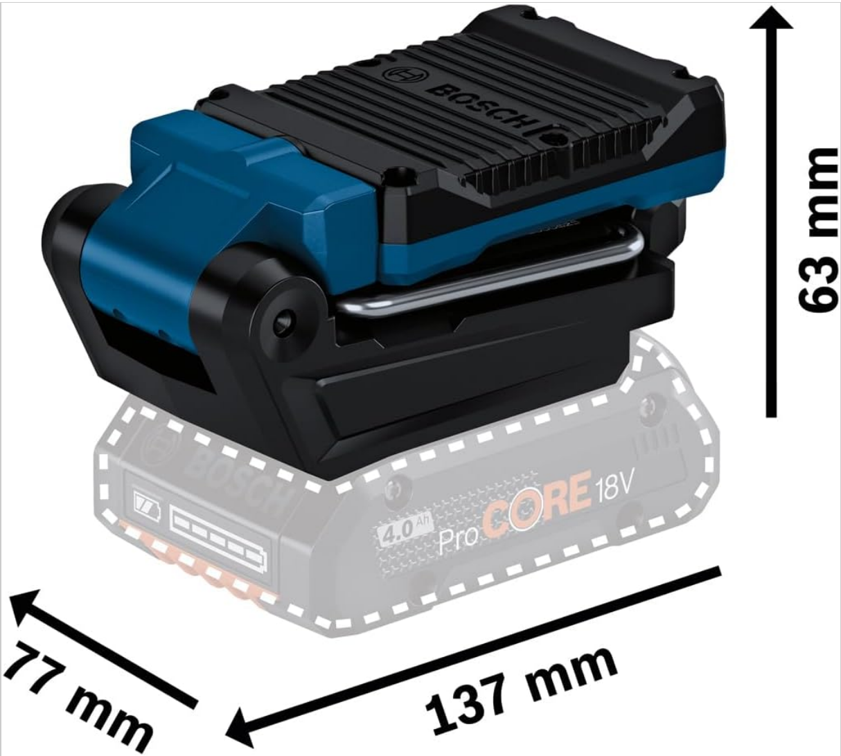
Image 8.1: Diagram illustrating the approximate dimensions of the GLI 18V-800 Cordless Light in its folded configuration.