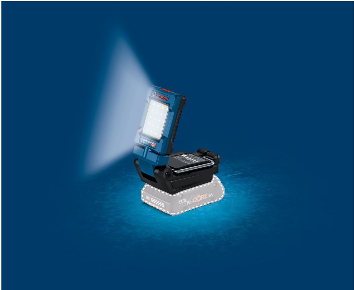
Image 5.1: The GLI 18V-800 in operation, demonstrating its illumination capability. The light head is angled to direct the beam onto a specific area.