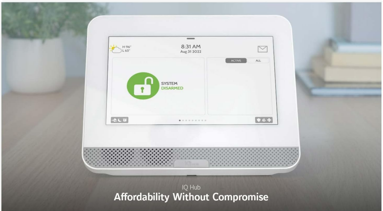
Image: Qolsys IQ 4 Hub on a wooden surface, displaying the disarmed system status and weather information. This shows the hub in a desktop configuration, highlighting the user interface.