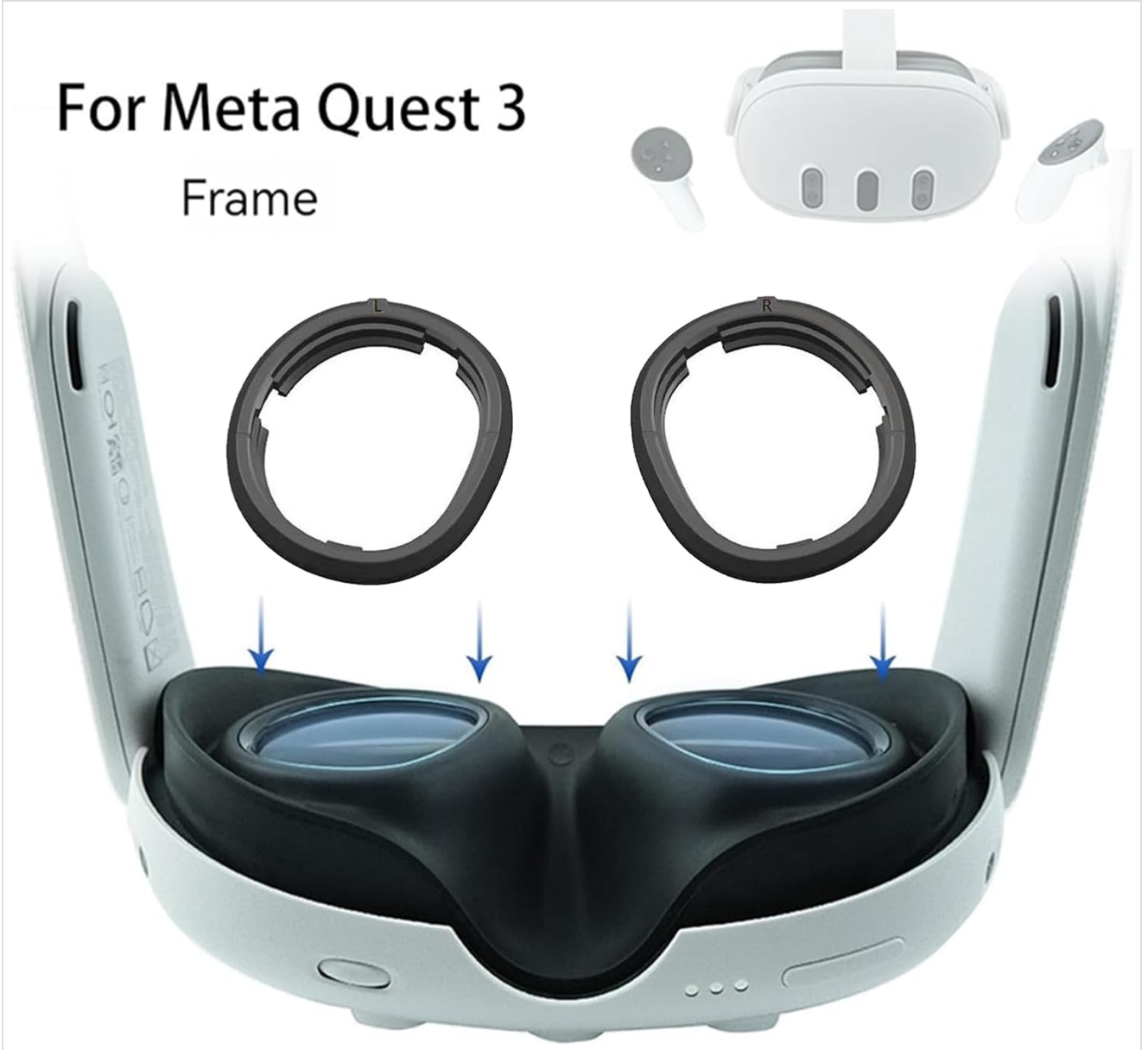
Image: The lens frames being pressed into the Meta Quest 3 headset.