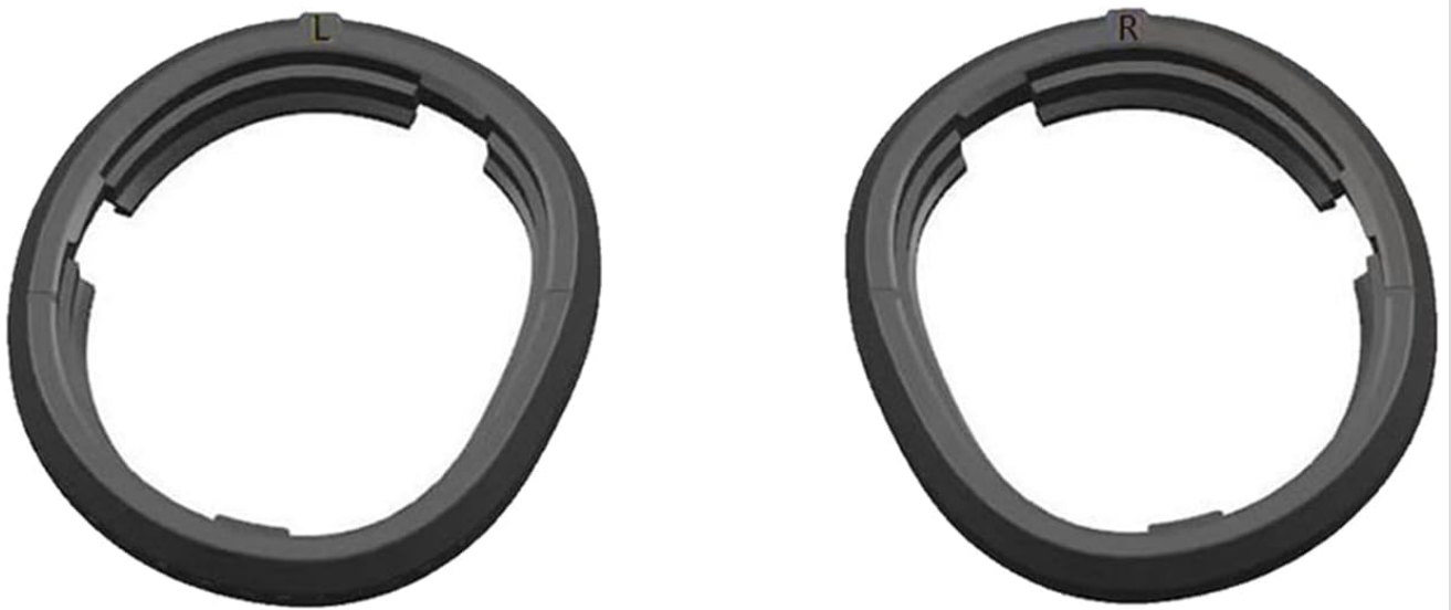
Image: Left and Right lens frames, marked for correct orientation.