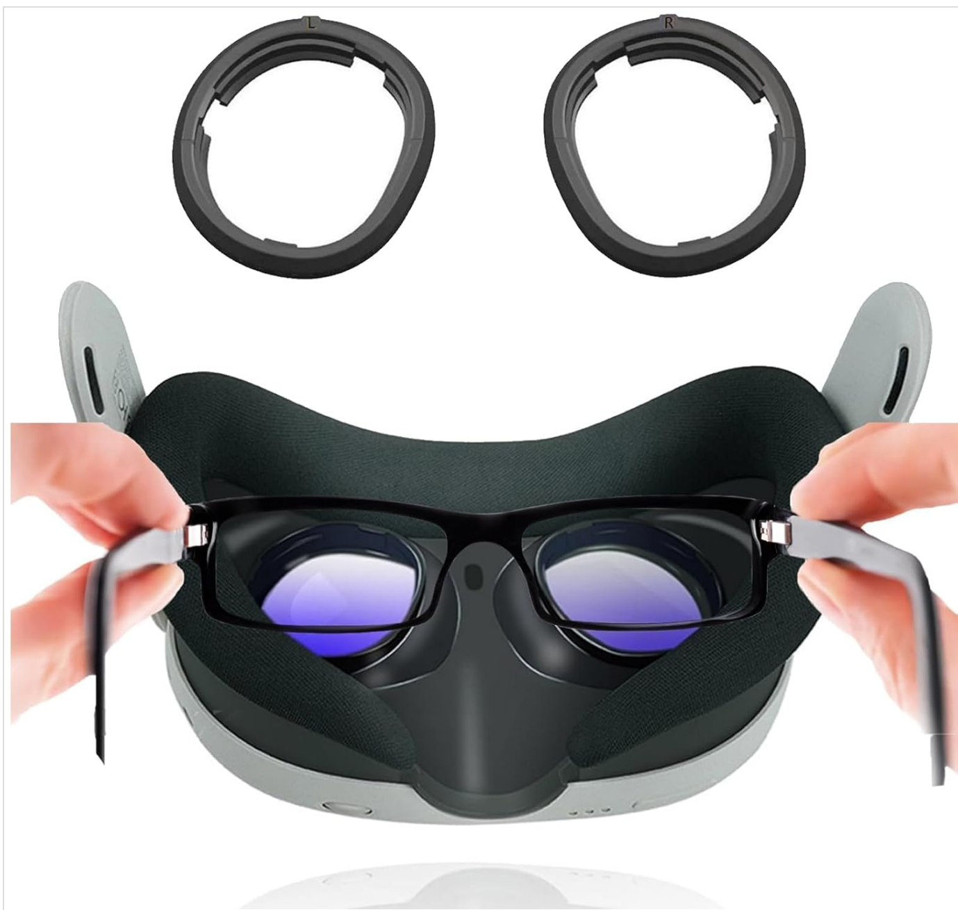
Image: The Growalleter Magnetic Eyeglass Frames installed within a Meta Quest 3 headset.