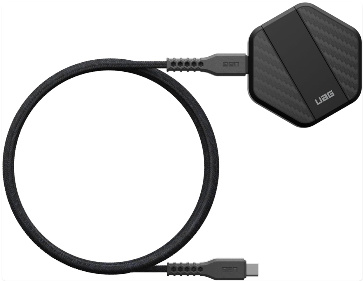
Figure 2: The UAG Wireless Charging Pad and its detachable USB-C cable.

Note: A USB-C wall charger is not included and must be purchased separately for optimal performance.