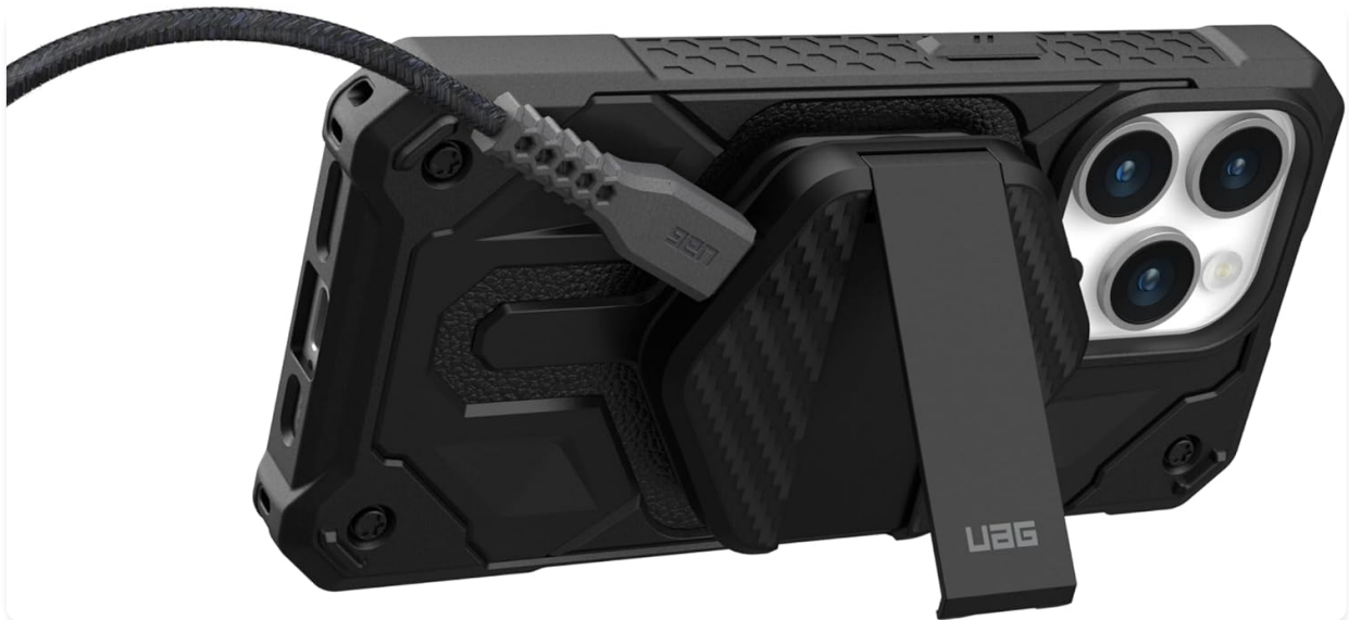
Figure 1: The UAG Wireless Charging Pad with Kickstand in use with a smartphone.

The URBAN ARMOR GEAR (UAG) Wireless Charging Pad with Kickstand is designed to provide efficient and convenient wireless charging for your compatible devices. Featuring 15W fast charging capabilities and integrated magnets for perfect alignment with MagSafe-compatible cases, this pad offers a seamless charging experience. Its durable metal alloy housing and carbon fiber inlay ensure longevity, while the built-in metal kickstand allows for hands-free viewing during charging.