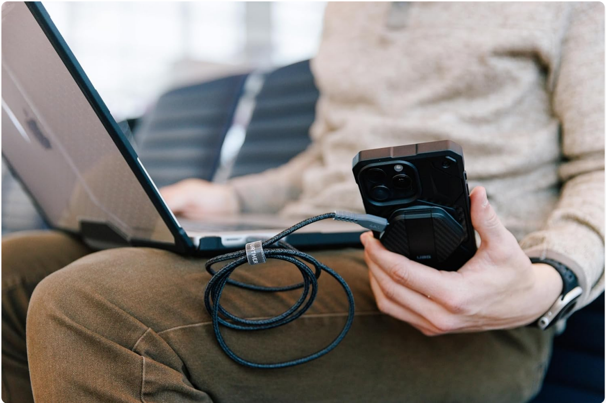
Figure 4: A smartphone charging on the UAG pad with its kickstand extended for viewing.