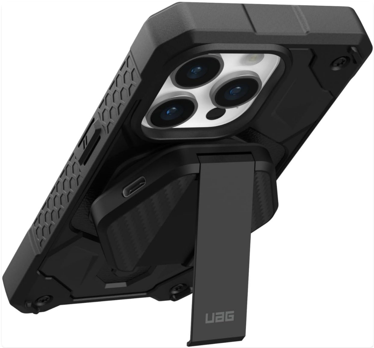
Figure 3: Connecting the charging pad to a smartphone.