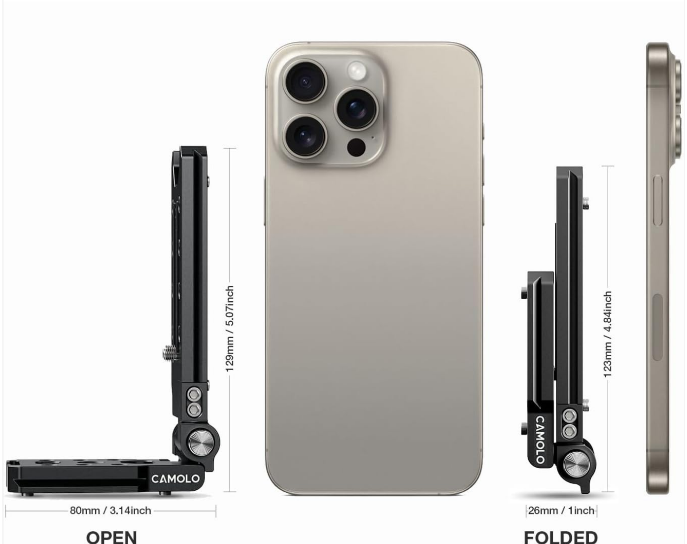
Figure 5: The L bracket's compact folded dimensions (123mm / 4.84 inches folded height) make it highly portable, comparable to a smartphone.

No matter open or folded, the size is compact and portable 145g (5.1oz) is lighter than a smartphone