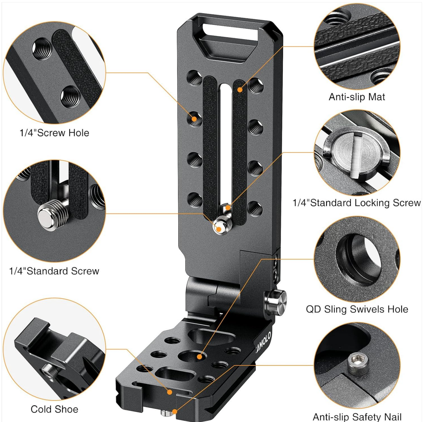
Figure 1: Key components of the CAMOLO Foldable Camera L Bracket. This image highlights features such as the 1/4" screw hole, anti-slip mat, 1/4" standard locking screw, QD sling swivels hole, cold shoe, and anti-slip safety nail.