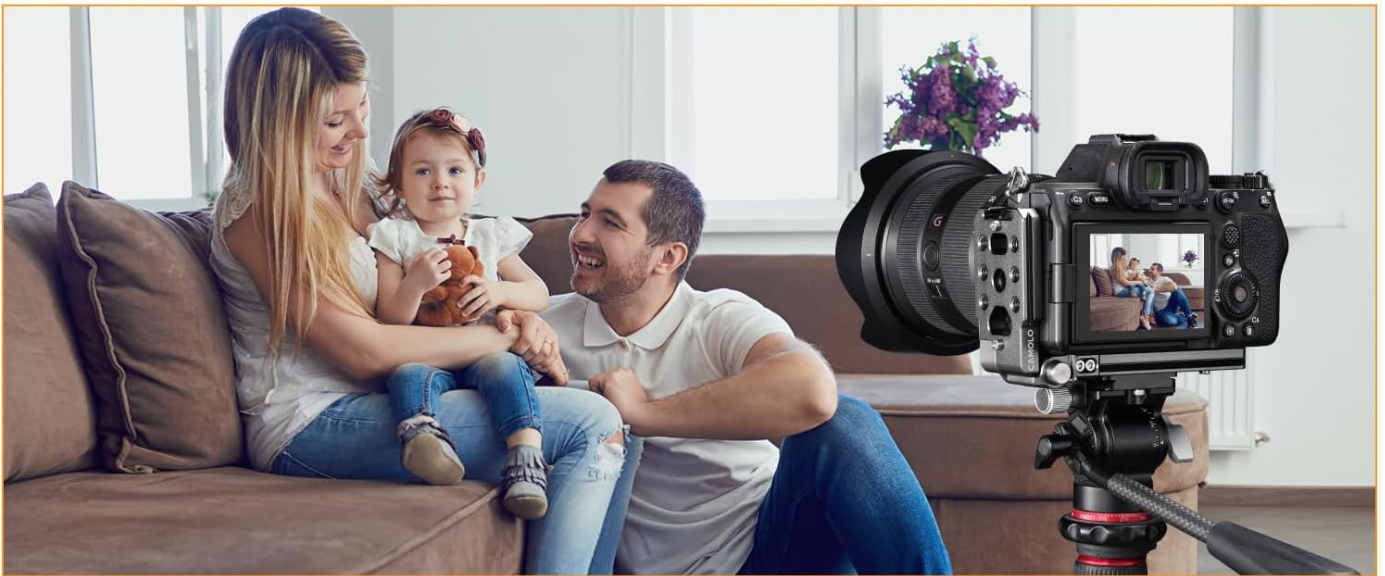
Figure 3: The L bracket allows for seamless switching between horizontal and vertical camera orientations on a tripod.

The L bracket is compatible with Arca-Swiss standard tripod heads. To switch between horizontal and vertical orientations: