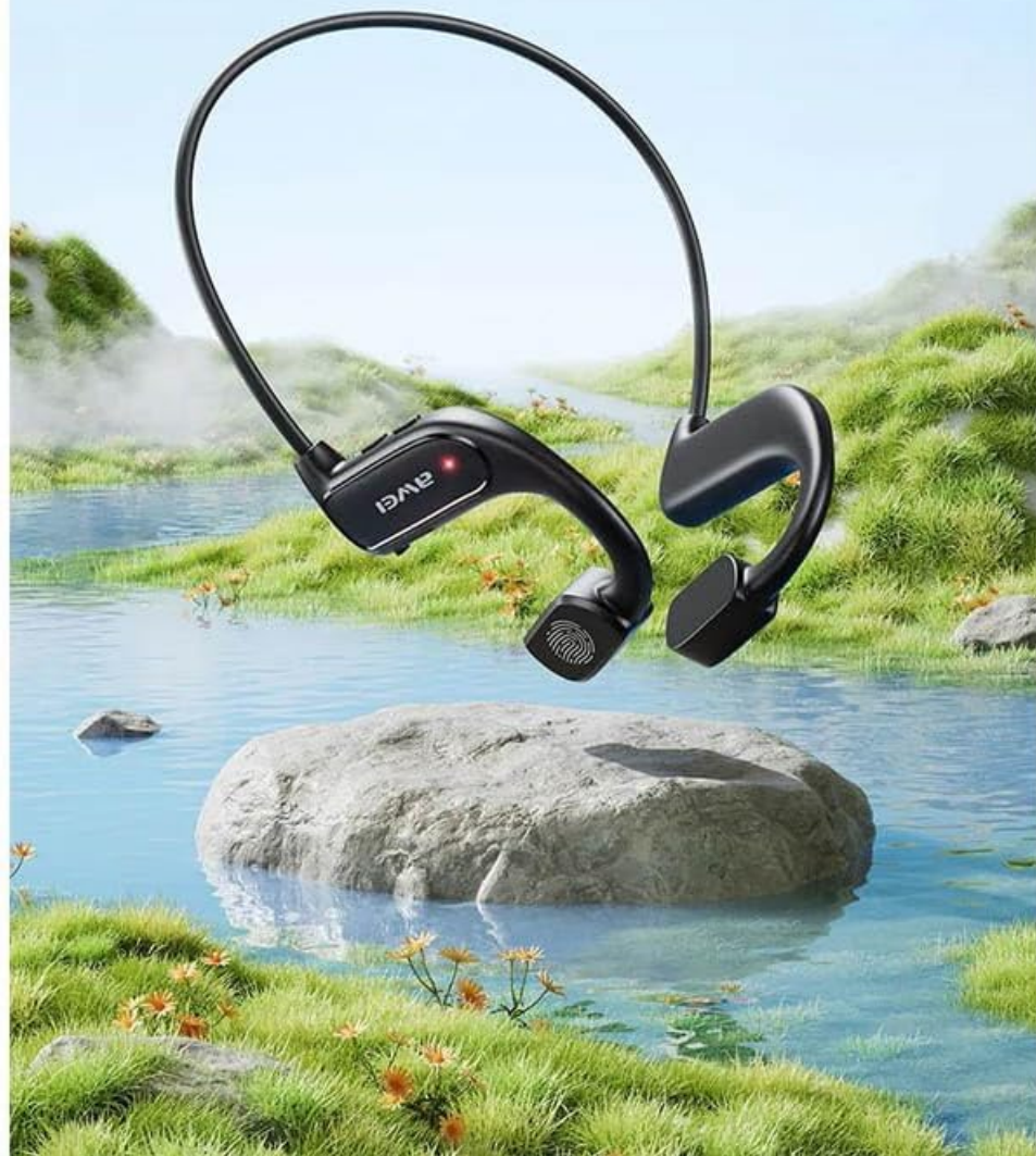
Image: AWEI A897BL headphones displayed in a serene outdoor environment, emphasizing their suitability for exercise and outdoor activities. The image highlights the sleek design and the brand logo.

HIFI sound quality / IPX4 waterproof sweatproof / Only weighs about 20G