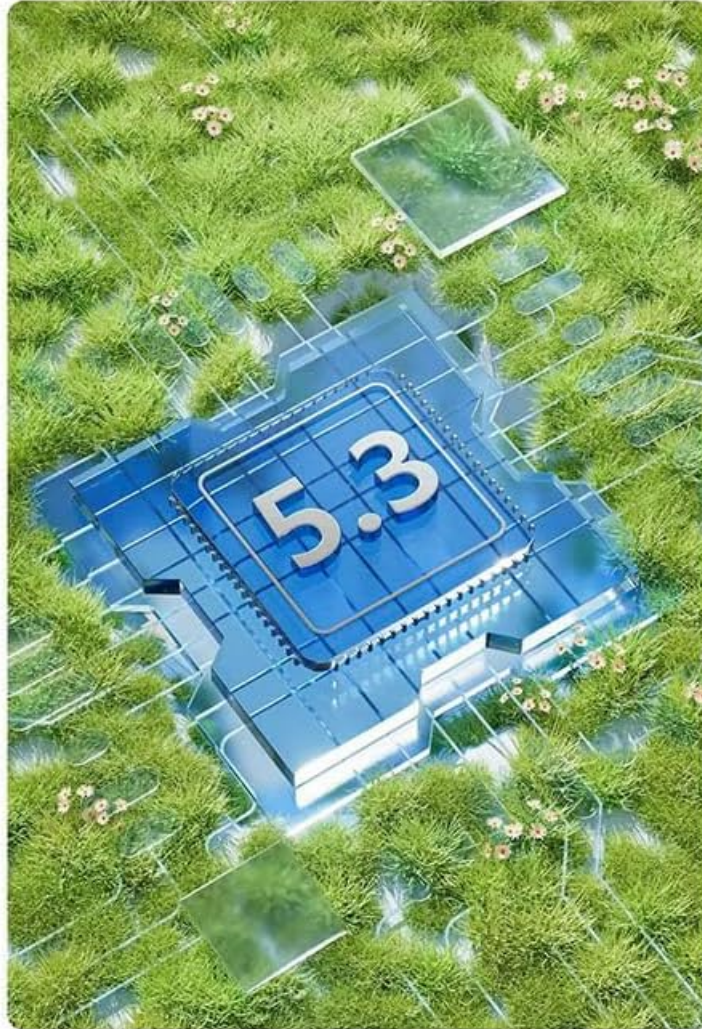
Image: A graphic representation of Bluetooth version 5.3 technology, highlighting its advanced capabilities for stable, low-power, and high-quality wireless audio transmission, ensuring an unimpeded listening experience.

Bluetooth version 5.3 improves the stability of wireless connections, with lower power consumption and more stable transmission, strong anti-interference, and smooth and good sound.