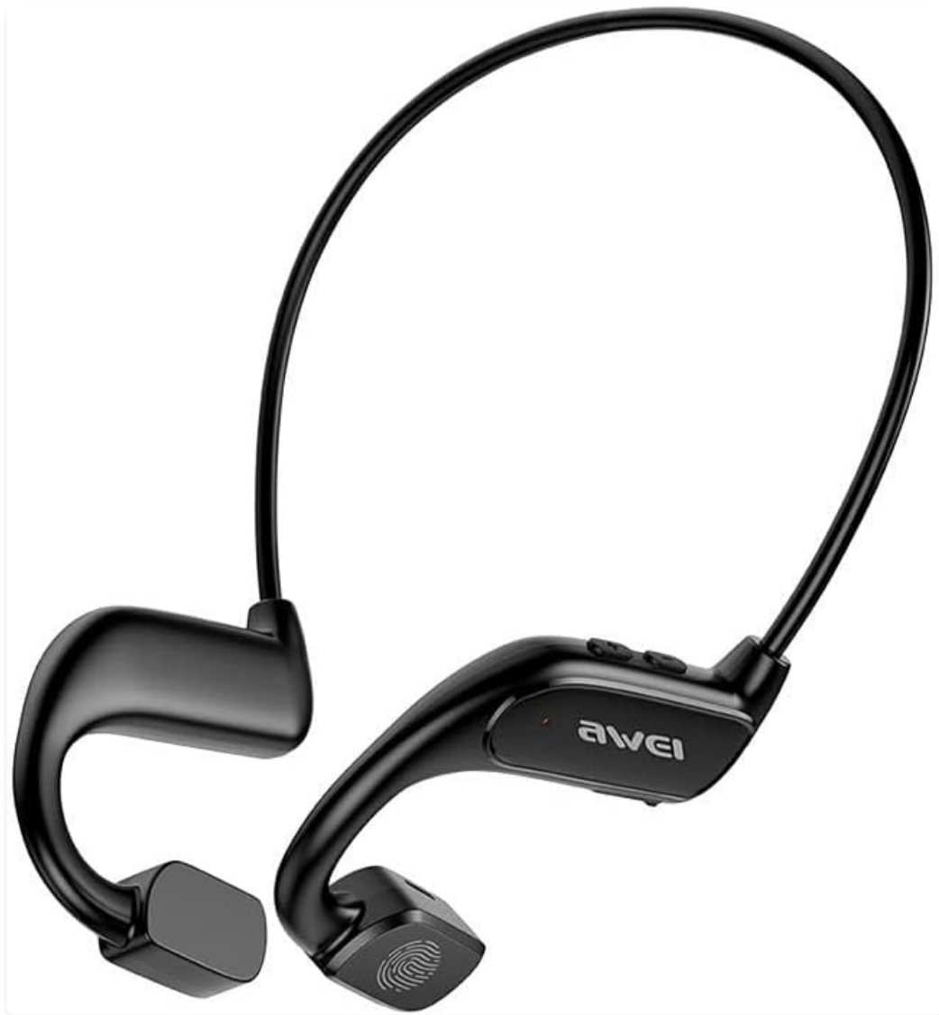
Image: Front view of the AWEI A897BL Air Conduction Bluetooth Headphones, showcasing their lightweight, open-ear design with a flexible neckband and integrated controls on the earpieces.