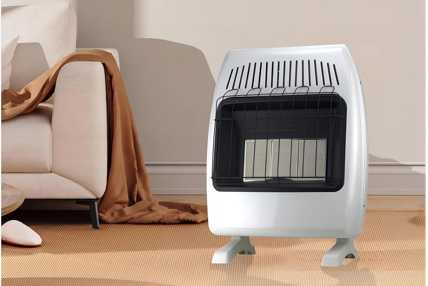
Image: An example of a wall heater successfully installed with the floor mounting legs, positioned stably in a room.