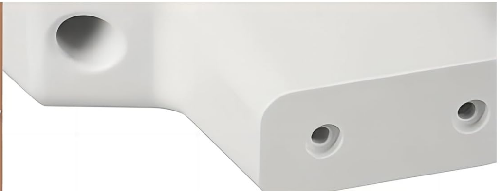
Image: Visual guide demonstrating the simple installation process, highlighting how the design helps avoid moisture and ensures stability.