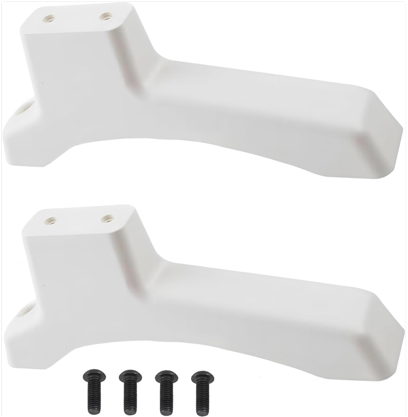
Image: The package includes two white heater legs and four black screws, which are essential for assembly.