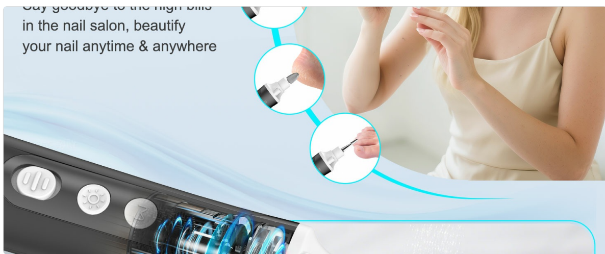
Image: A close-up of the Eletorot Electric Nail File in use, demonstrating its effectiveness in grinding a toenail.

Your browser does not support the video tag.